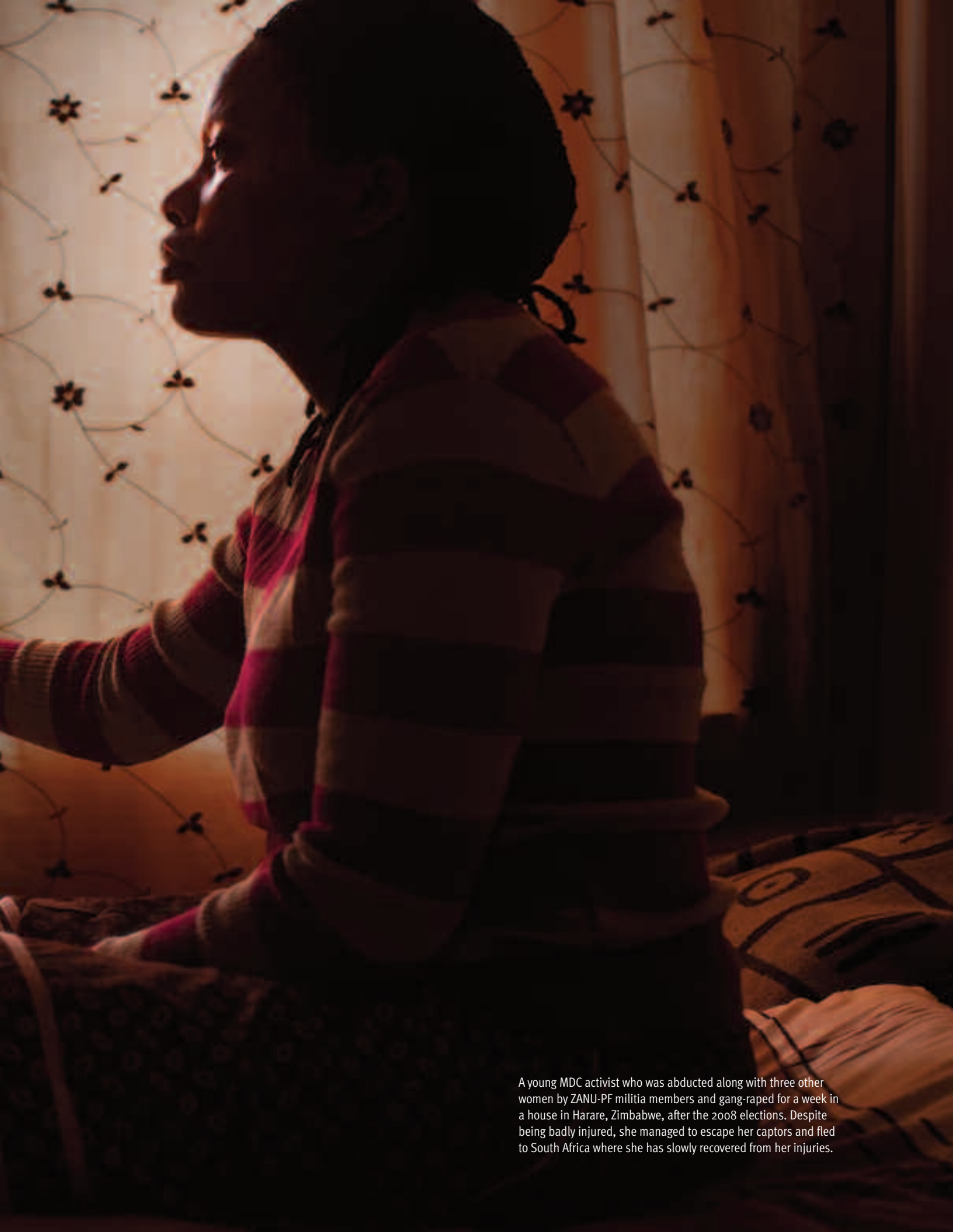
A young MDC activist who was abducted along with three other women by ZANU-PF militia members and gang-raped for a week in a house in Harare, Zimbabwe, after the 2008 elections. Despite being badly injured, she managed to escape her captors and fled to South Africa where she has slowly recovered from her injuries.