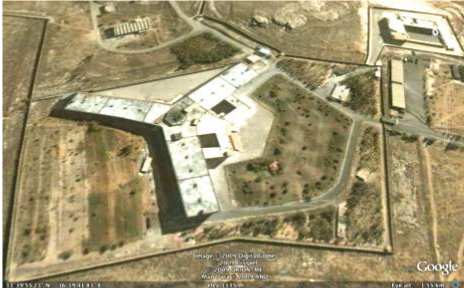
Aerial view of Sednaya prison.

Accordingly, we urge President Bashar al-Asad to: