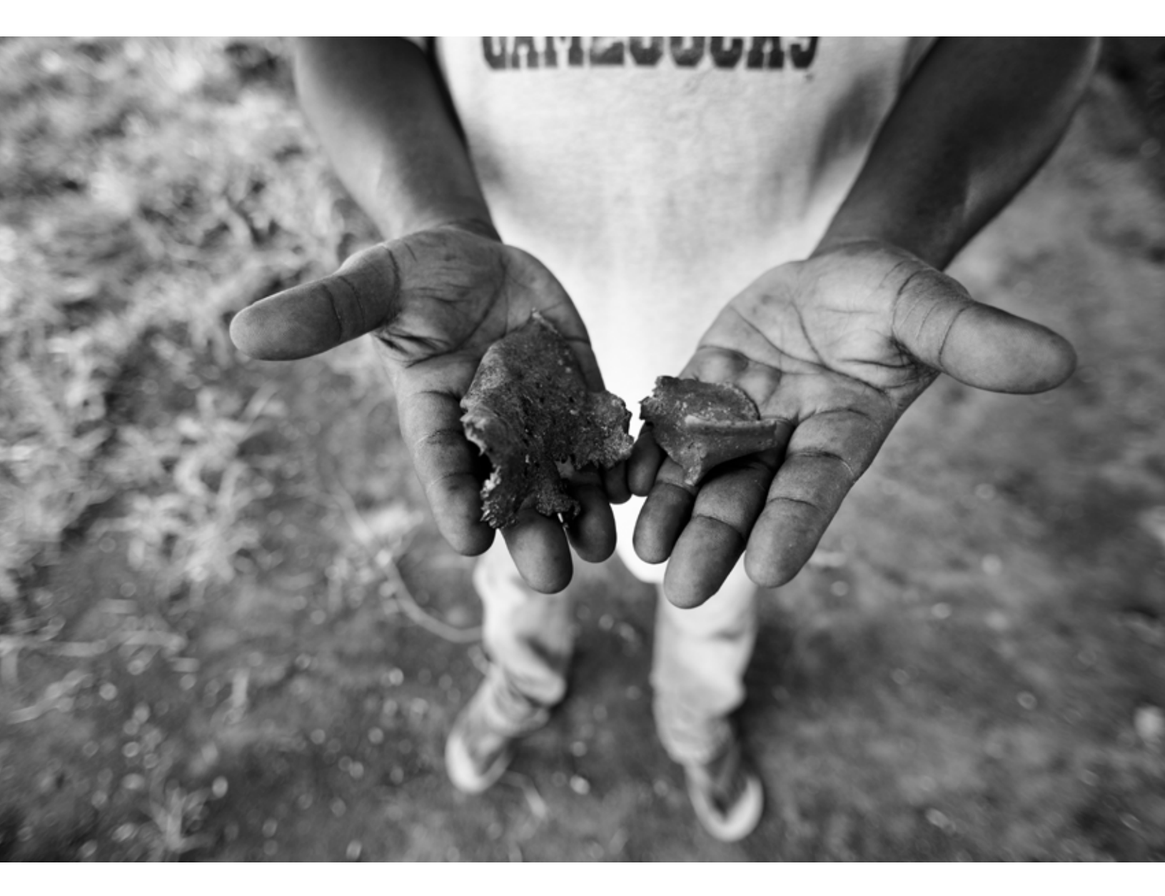
Shrapnel from a barrel bomb found near Yabus, Blue Nile. Sudanese military aircraft flying at high altitude drop the crude devices, which are filled with nails and other jagged pieces of metal that become deadly projectiles upon impact.

The evidence documented suggests that the Sudanese government has adopted a strategy to treat all populations in rebel held areas as enemies and legitimate targets, without distinguishing between civilian and combatant. This apparent approach lies at the heart of the serious violations of international humanitarian law documented in this report. Human Rights Watch also received reports of abuses by SPLA-North forces, including indiscriminate shelling and unlawful detentions, but did not have access to the relevant areas or individuals to confirm reports.