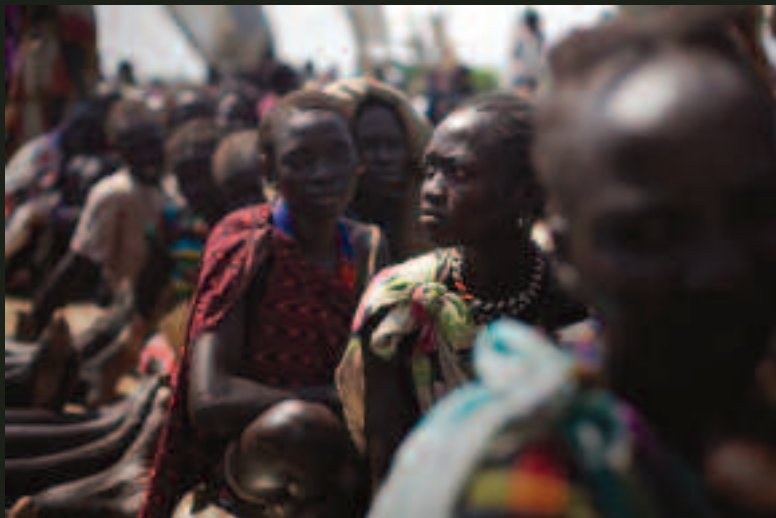
Women from the Murle tribe wait to receive emergency food aid in Pibor town.

Human Rights Watch calls on South Sudan to take urgent measures to address both patterns of violence: first to end violations committed by its own army and to hold those responsible for violations to account; and second urgently to investigate and prosecute those responsible for the crimes committed in the grave inter-ethnic violence. Serious allegations of government support to ethnic fighters have also been raised and require urgent and thorough investigation.