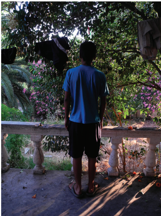
A 14-year-old unaccompanied migrant boy from Afghanistan stands outside the abandoned house in which he lives with 25 other Afghan migrants in Patras, Greece. Like many other migrants, he is trying to stow away on ships to Italy to claim asylum.