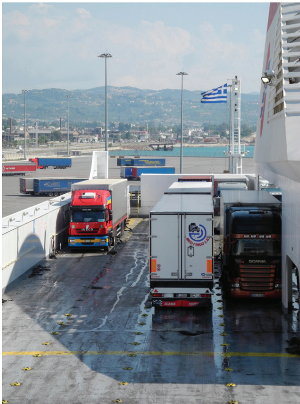
Trucks of the sort migrants stow away on hoping to reach Italy, loading onto ships at the Patras port. Migrants stow away between the axles, inside fuel tanks, or inside refrigerated containers.

coming with risk of loss of limbs or death, while hanging underneath a commercial truck or hiding inside refrigerated containers or fuel tanks.