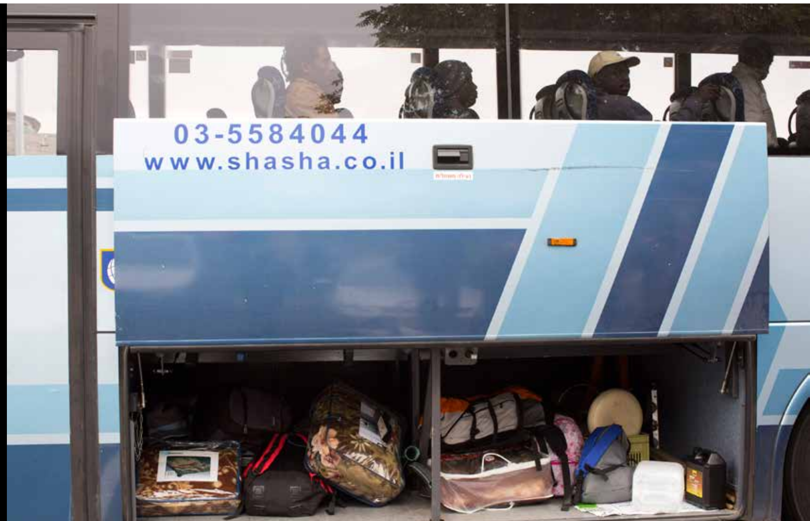
Israeli immigration police in Tel Aviv check the identity documents of “infiltrators” ordered to report to the Holot “Residency Center” in Israel’s Negev desert, January 26, 2014. Israeli law allows the authorities to arrest and detain anyone failing to report.

The fate of Eritreans returning from Israel is unknown, although Human Rights Watch has documented how the Eritrean authorities abuse some Eritreans returning from other countries. Seven Sudanese returning from Israel told Human Rights Watch they were detained and interrogated in Sudan’s capital, Khartoum, with three held for long periods during which time one was tortured, a second was put in solitary confinement, and a third was charged with treason for visiting Israel. Others were released after short periods.