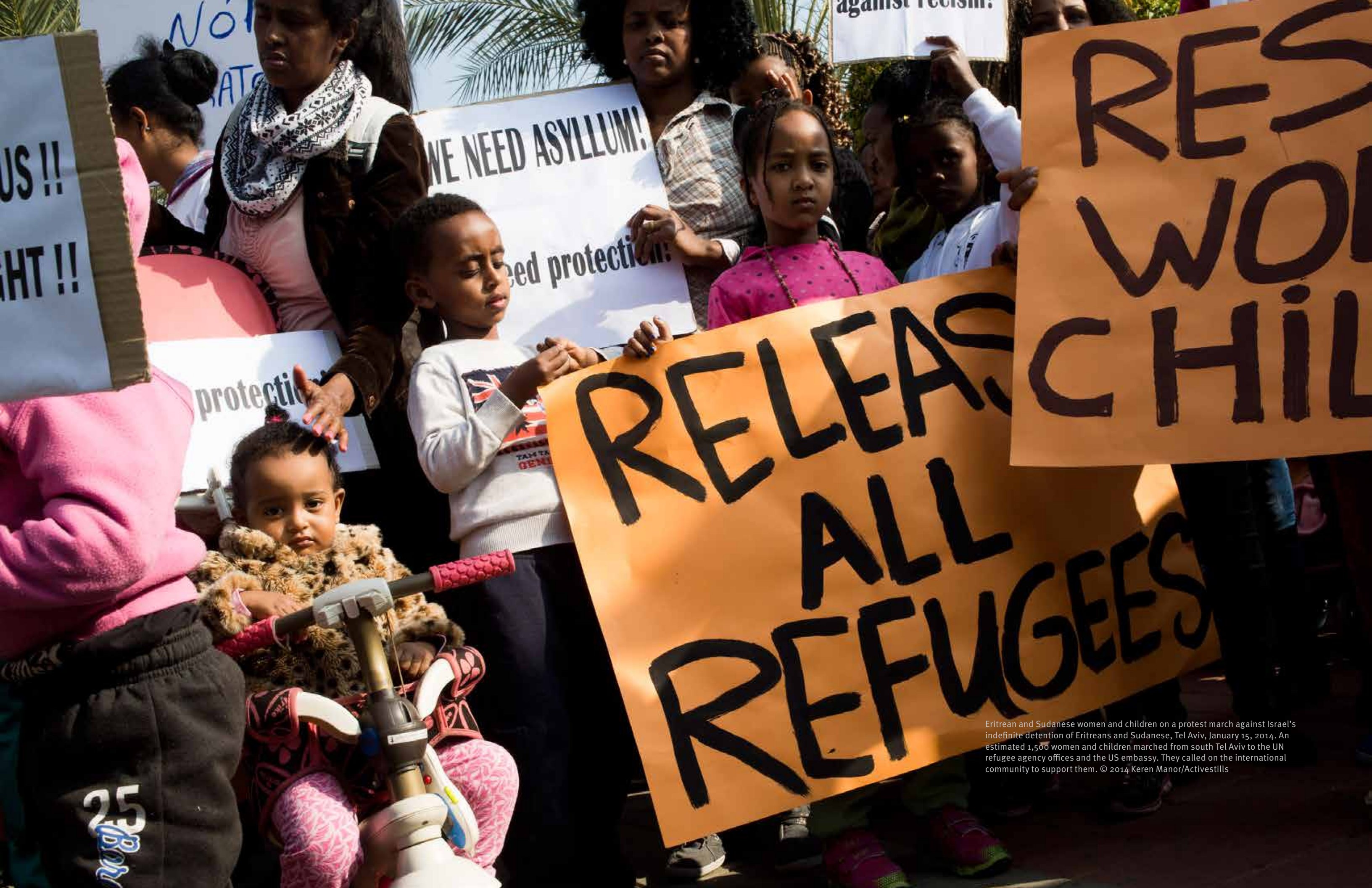
Eritrean and Sudanese women and children on a protest march against Israel's indefinite detention of Eritreans and Sudanese, Tel Aviv, January 15, 2014. An estimated 1,500 women and children marched from south Tel Aviv to the UN refugee agency offices and the US embassy. They called on the international community to support them.