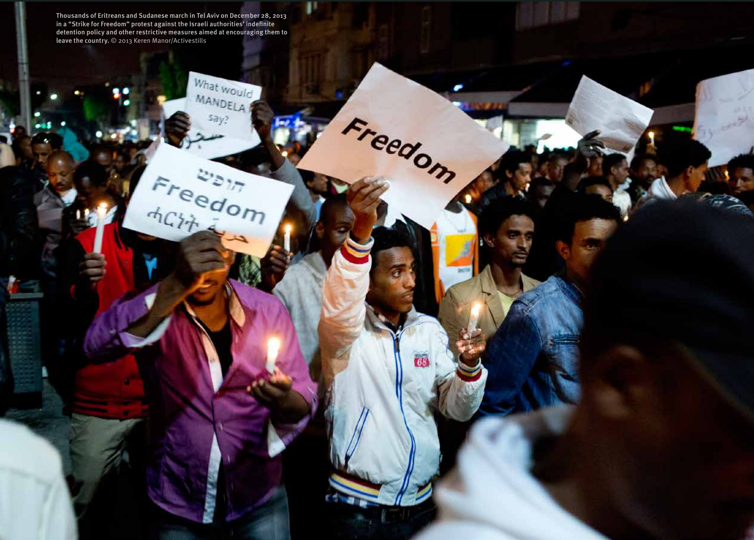
Thousands of Eritreans and Sudanese march in Tel Aviv on December 28, 2013 in a “Strike for Freedom” protest against the Israeli authorities’ indefinite detention policy and other restrictive measures aimed at encouraging them to leave the country.

I N January 2014, thousands of Eritreans and Sudanese in Israel took to the streets of Tel Aviv and Jerusalem to protest against the Israeli authorities’ policy of coercing them into returning to their countries where they face a serious risk of abuse at the hands of repressive governments. Their demands to the authorities were clear: end the practice of subjecting them to unlawful indefinite detention, stop labeling them “infiltrators” instead of asylum seekers and refugees, register and fairly assess their asylum claims, and respect their right to work.