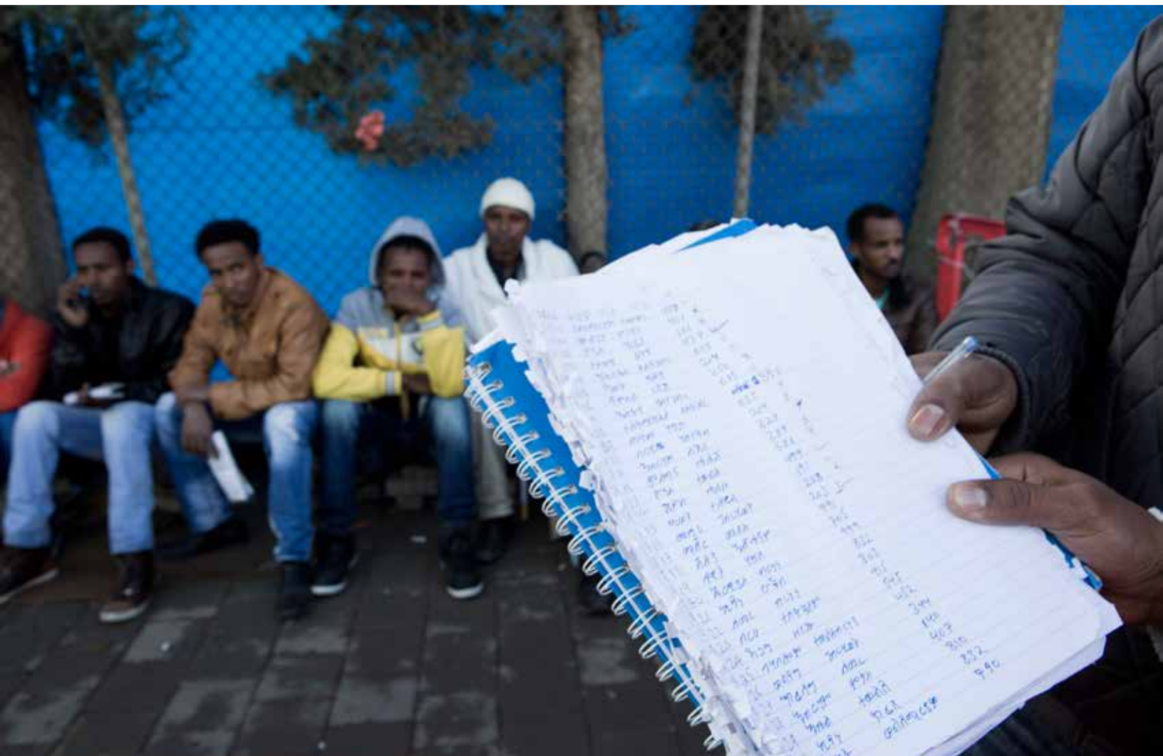
Sub-Saharan African nationals wait outside Israeli Interior Ministry offices in Tel Aviv on March 13, 2014 to renew their “conditional release permits.” Any Eritrean or Sudanese who entered Israel before May 31, 2011 can have their permit cancelled and be summoned to report to the Holot “Residency Center” in Israel’s Negev desert where they face indefinite detention.

Fairly reviewing tens of thousands of individual asylum claims in line with international refugee law standards would run up huge bills, take years, and, in any case, lead to the likely conclusion that all Sudanese and most Eritreans in Israel have valid refugee claims.