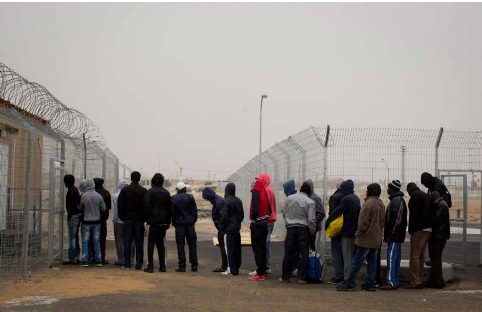
Eritreans and Sudanese report to the Holot “Residency Center” in Israel’s Negev desert on February 17, 2014. Holot is a detention center in all but name, with “residents” required to sign in three times daily, and be there by night, while the nearest town is 65 kilometers away.

1954 Prevention of Infiltration Law authorizing indefinite detention, Israel has detained up to 3,000 at any given time while the remaining tens of thousands living in Israel’s cities—mainly in Tel Aviv, Arad, Ashdod, Ashkelon, Eilat and Jerusalem—live in constant fear of being ordered to report to detention centers.