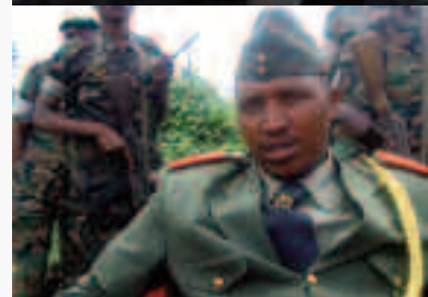
Liberian President Charles Taylor.