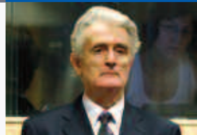
Chilean army general and head of state Augusto Pinochet.