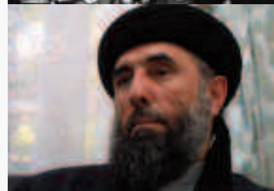
General Bosco Ntaganda, Democratic Republic of Congo.