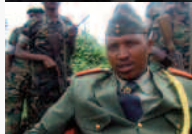
Liberian President Charles Taylor.