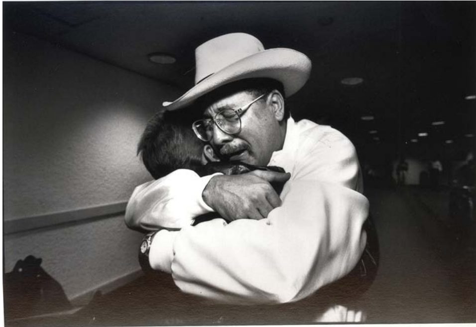
Paquito D’Rivera is reunited with his son after a nine-year separation.

to Miami, police barged into their home and took away their passports. D’Rivera responded by making “a very big scandal around the world.” He bought a fax machine and began sending letters to newspapers “all over the planet” until, after several weeks of intense publicity, the government returned their passports. D’Rivera finally was able to meet them in Miami in January 1989. 77