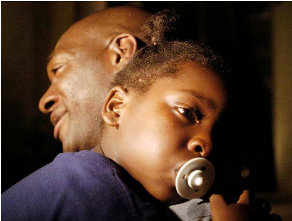
José Contreras is reunited with his wife and two daughters after a two-year separation.

Many thousands of others have opted for a risky escape on the high seas. A well-known recent example is that of José Contreras , now a pitcher in Major League Baseball, who defected from Cuba in October 2002, but was unable to get his wife and young children permission to leave. Officials of the Cuban government reportedly told Contreras’s wife