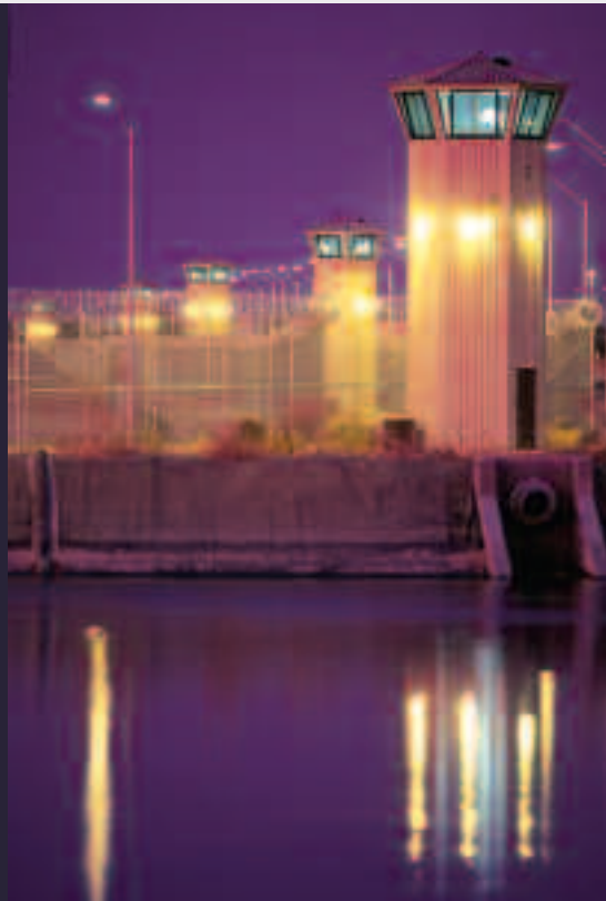
California State Prison, Centinela in Imperial County, California.

California's law permitting juveniles to be sentenced to life without parole for murder was enacted before major advances in understanding adolescent brain development, and fails to recognize that teenagers are particularly amenable to change and rehabilitation. All youth should have the chance to prove they have changed, and to earn parole.