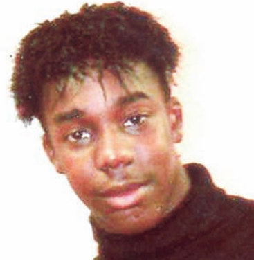
Drachir P. was 16 in this photo and 17 at the time of his crime.