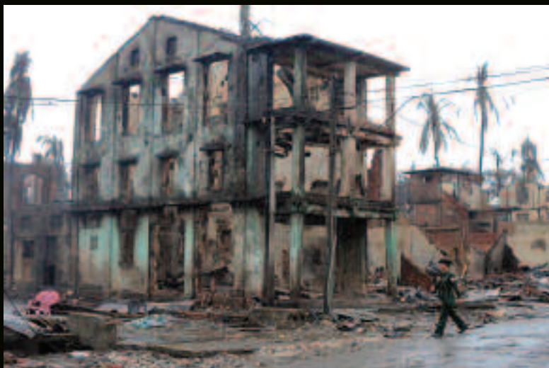
A Burmese soldier walks past a partially destroyed building in Sittwe, capital of Arakan State in western Burma, on June 14, 2012.

Human Rights Watch calls on the Burmese government to take urgent measures to end abuses by the security forces and punish those responsible, ensure humanitarian access, amend discriminatory provisions in the citizenship law, and permit independent international monitors to reach affected areas and investigate abuses. Bangladesh should abide by international law and not return Rohingya asylum seekers.