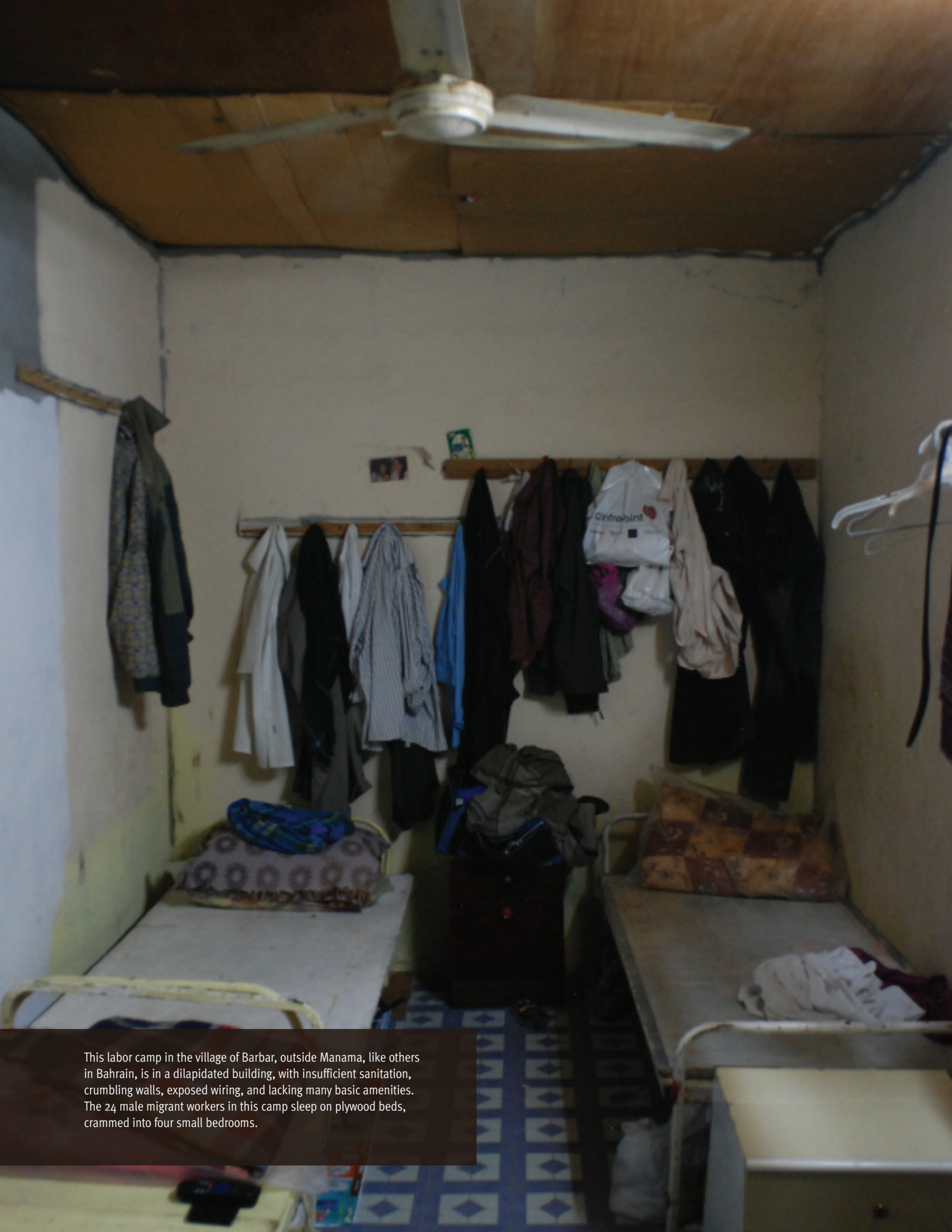
This labor camp in the village of Barbar, outside Manama, like others in Bahrain, is in a dilapidated building, with insufficient sanitation, crumbling walls, exposed wiring, and lacking many basic amenities. The 24 male migrant workers in this camp sleep on plywood beds, crammed into four small bedrooms.