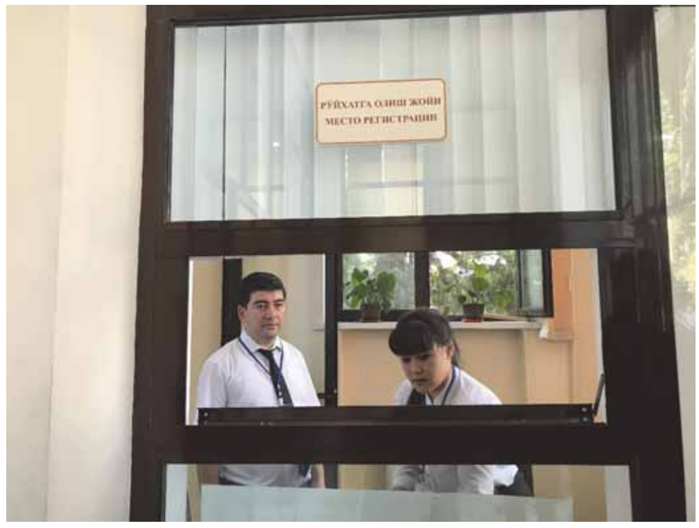
Employees at the Tashkent city Presidential Reception Center, one of a network across the country established by President Mirziyoyev.

and corruption committed by government authorities past and present. In addition, Uzbek authorities should release all political prisoners immediately and unconditionally, and actively encourage the development of independent civil society.