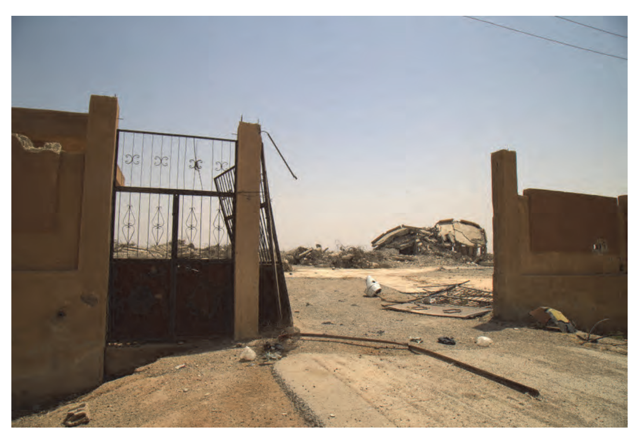
Entrance to the Badia school that was struck by coalition aircraft on March 20, 2017.

Photos of the school posted in the immediate aftermath of the attack show that the attack caused near total destruction of the building, but that parts of the building frame were still standing.