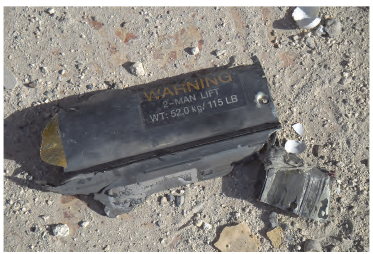
Remnants of an air-launched Hellfire missile found in the ruins of a residential house after a coalition airstrike hit the house, killing 18 civilians, including 18 children.