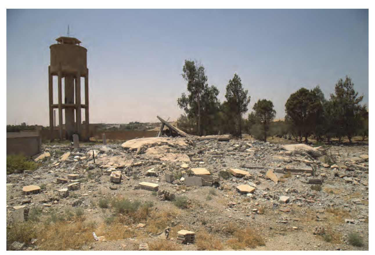
Rubble of a residential house that local residents said was attacked in a coalition airstrike on March 30, 2017, killing six civilians.

Relatives provided Human Rights Watch with the names of those killed: