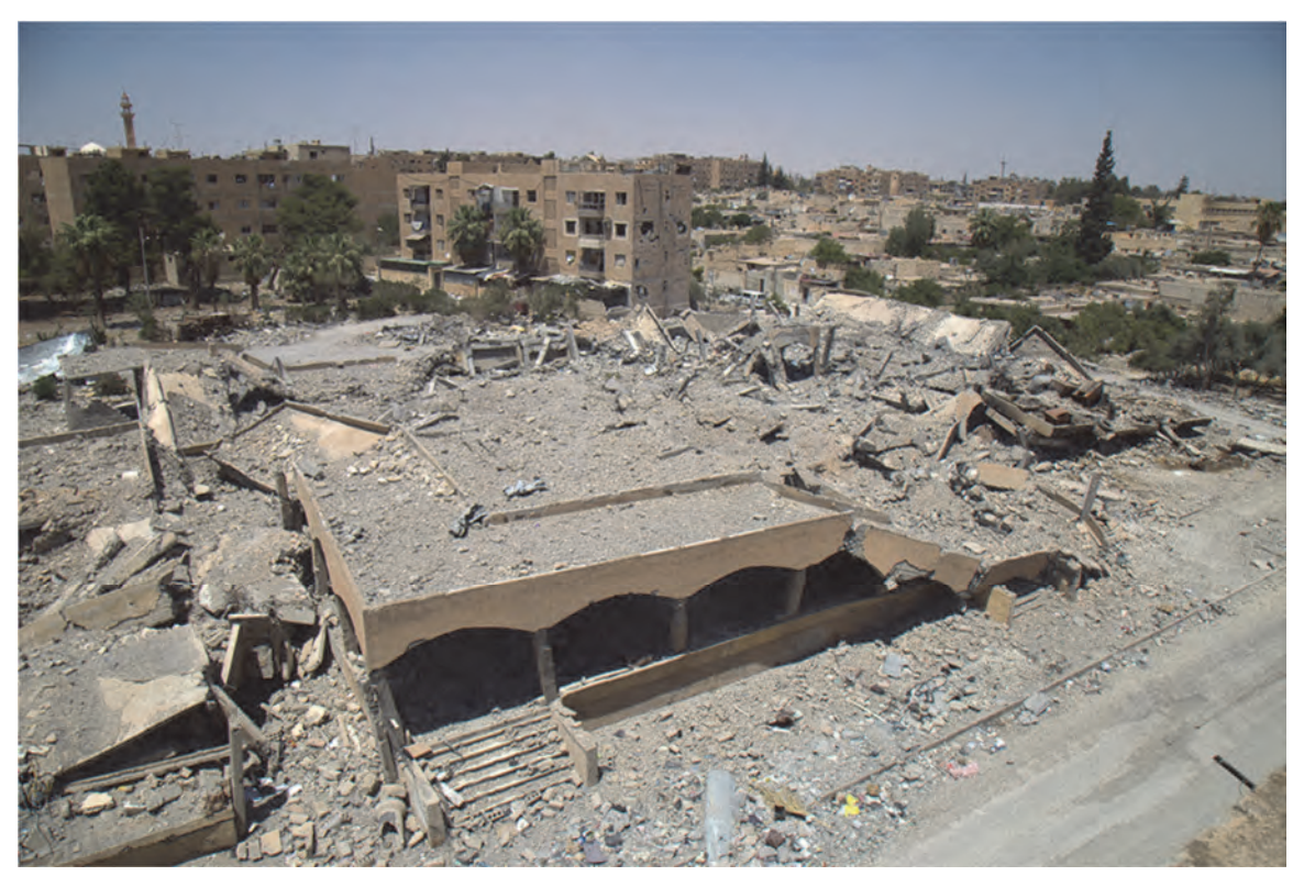
The ruins of a market and bakery in Tabqa after an airstrike, in all likelihood carried out by US-led coalition forces, on March 22, 2017.

section were ISIS members.<sup>58</sup> Mohammad's friend, "Ahmad," who looked after the internet café while Mohammad stepped out, gave a similar account. "About 50 percent of those in the internet café for men were ISIS members," he said. "There were a few ISIS members in the market as well, but not as many as in the internet café." Only two of the people in the internet café survived, he said. Human Rights Watch observed injuries to Ahmad's foot and hand, which he said he sustained in the attack.