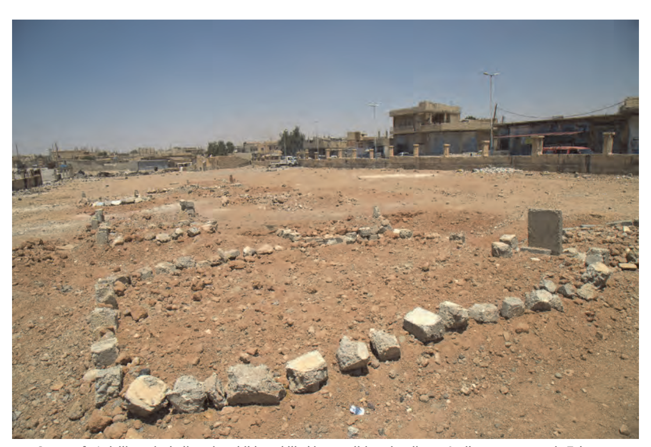
Graves of 16 civilians, including nine children, killed in a coalition airstrike on April 25 or 25, 2017, in Tabqa city.