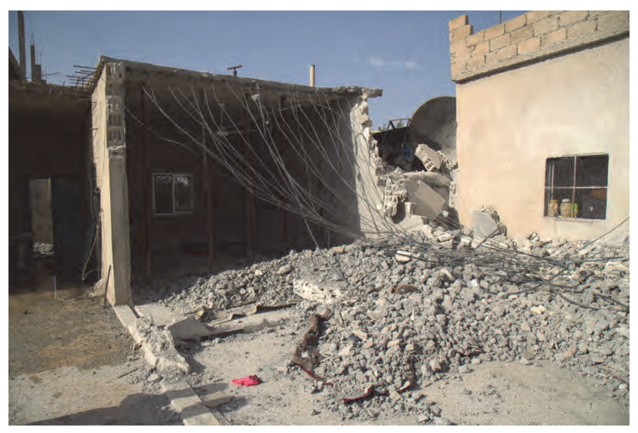
Partially cleared rubble of a residential house that was struck in an aerial attack likely end of April, killing 18 members of the same family.

Local residents told Human Rights Watch that one munition hit a narrow street in front of the house and killed an ISIS fighter. A second munition hit the house where the Dalo family had sought refuge killing all 18 members of the family, including 3 women and 11 children.