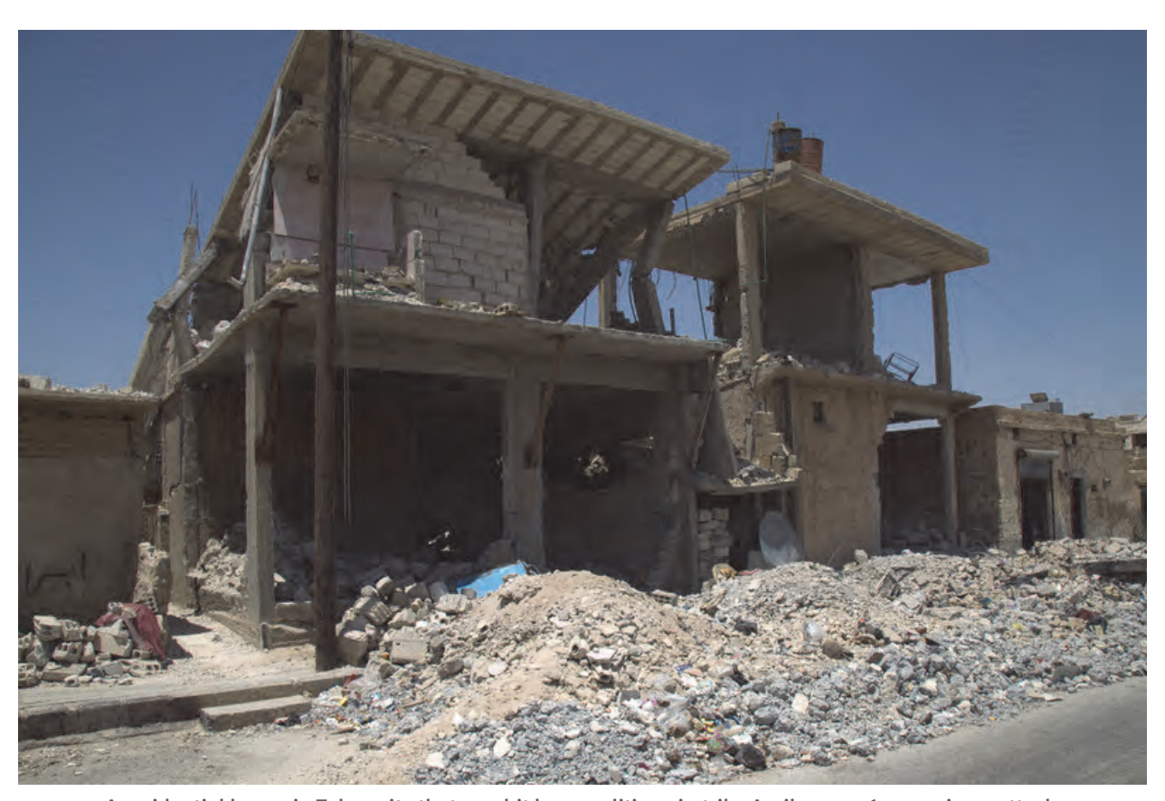
A residential house in Tabqa city that was hit by a coalition airstrike April 25 or 26, 2017, in an attack that killed 16 civilians, including nine children.

In response to questions from Human Rights Watch, the CJTF press desk said that coalition forces conducted precision strikes in the vicinity of the location provided. On September 18 the press desk said that the CJTF was still assessing whether the strike resulted in civilian casualties.77