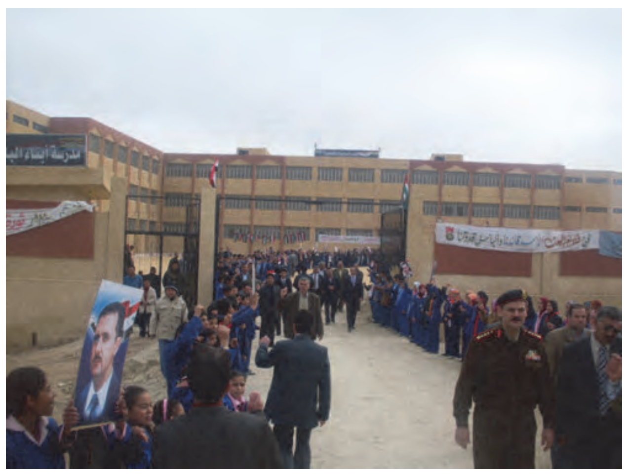
Photo from the opening of the Badia school in Syia in 2009.