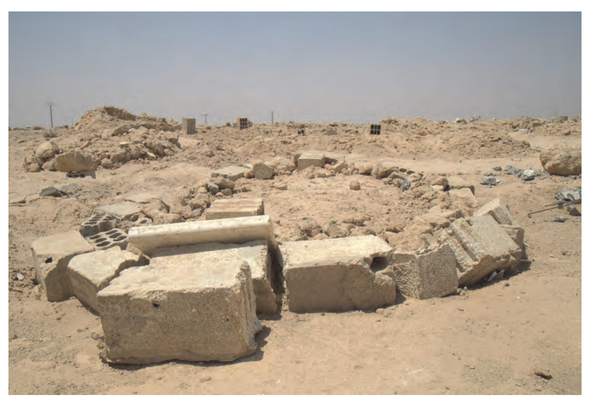
Site where local residents said they buried dozens of people killed in a March 20 attack on a school in Mansourah that housed displaced civilians.