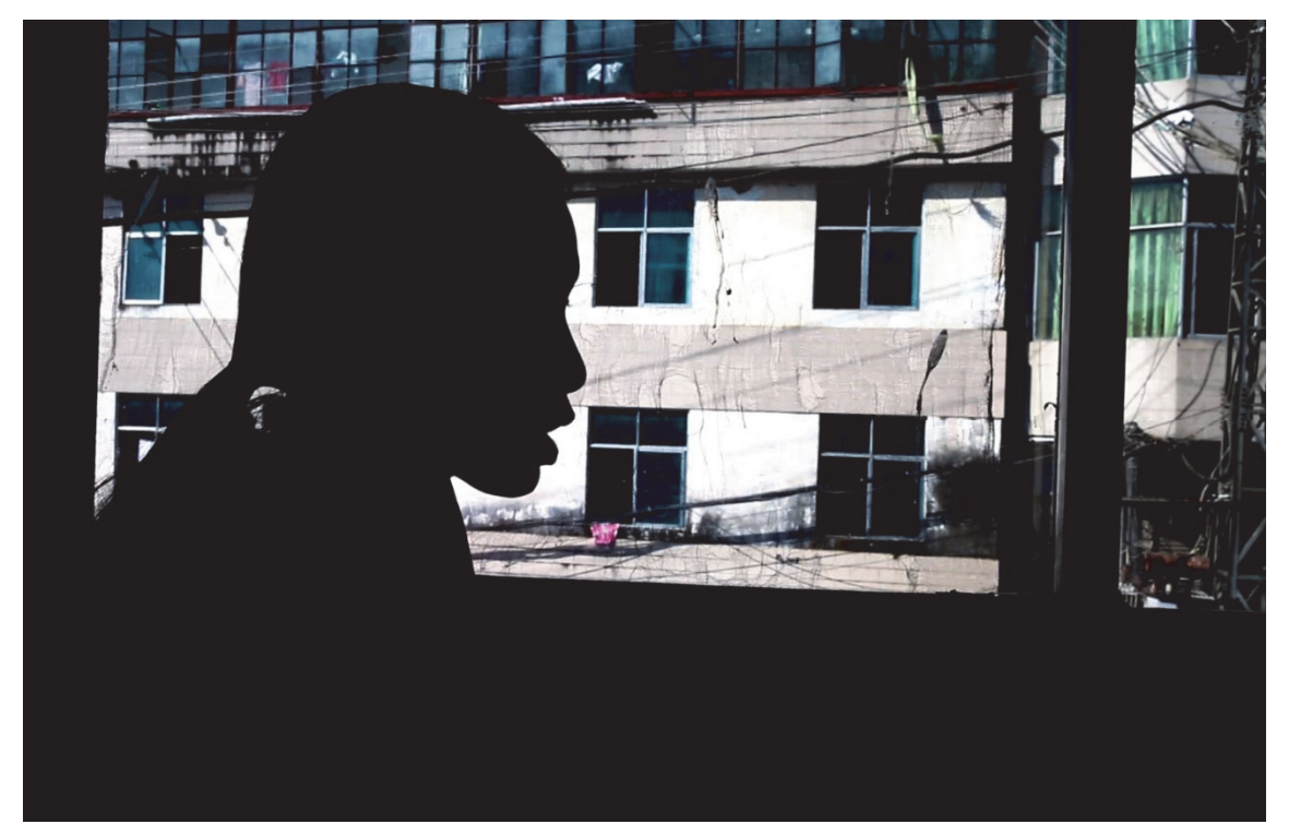
"I do not know exactly or remember how I got into the new house...When I woke up, I saw a man but not my friends anymore. I don't know exactly, but later I guessed that was a Chinese house. I did not know where to run away...I realized that I was trafficked. From that time on, I planned to learn basic Chinese [language] and find ways to run."—Young Kachin woman, trafficked at age 17, escaped after six months.

frequently as the family sought to make them pregnant. The survivors said that the families that bought them often seemed more interested in having a baby than a "bride." Many trafficked women and girls tacitly understood—and some were explicitly told—that once they had a baby they were free to go, as long as they left the child or children behind. A few were subjected to what they believed were forced fertility treatments.