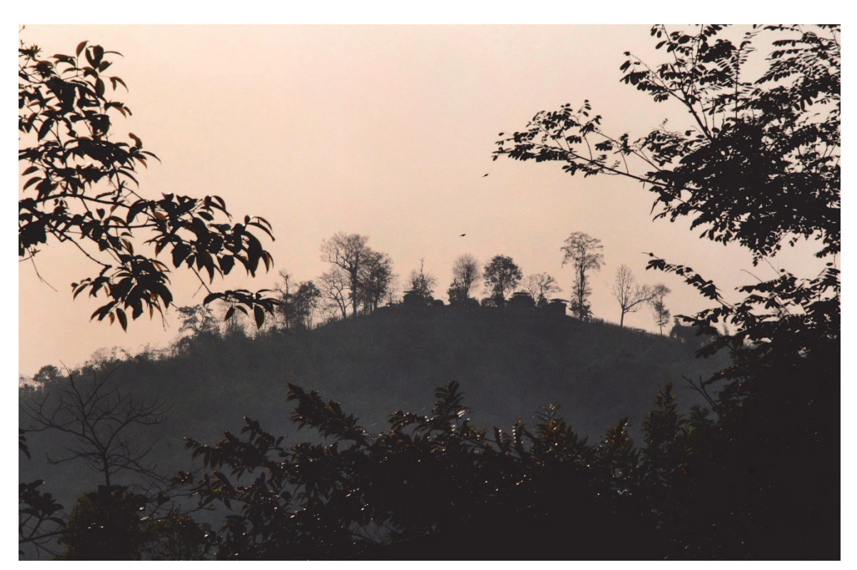
Myanmar army forces on a hilltop as seen from outside of Laiza, the Kachin Independence Army's (KIA) headquarters in Kachin State, Myanmar. While much of the world's attention has been focused on the plight of Myanmar's Rohingya Muslims, a largely ignored conflict continues in Myanmar's north between the army and the KIA and other ethnic armed groups. The conflict, which dates back to the earliest days of Myanmar's independence, has intensified in recent years.

The 2011 offensive and subsequent counter-insurgency operations since then were brutally executed: the Myanmar army attacked Kachin villages, razed homes, pillaged properties, and forced the displacement of tens of thousands of people. Soldiers threatened and tortured civilians during interrogations and raped women. The army used antipersonnel mines and conscripted laborers, including children as young as 14, on the front lines.<sup>8</sup>