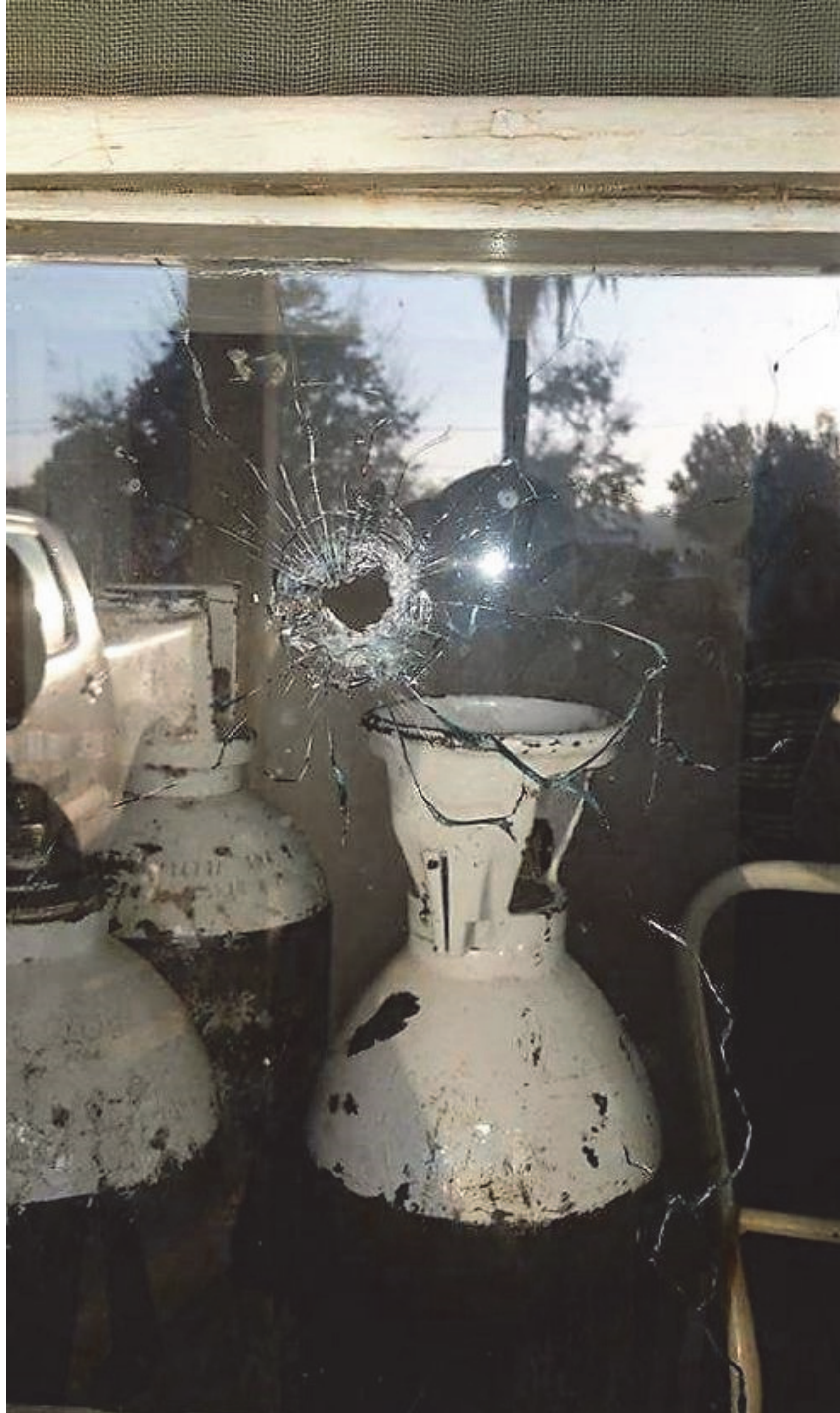
A bullet hole in the window of Morrumbala District Hospital after a raid by Renamo gunmen on August 12, 2016.