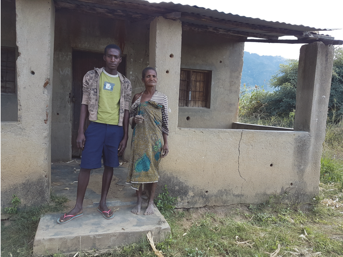
A woman and her son in front of their house with bullet holes in Mukodza village, Gorongosa. They said soldiers arrived in army vehicles and fired without warning at the house in June 2016, forcing them to flee through a window.

Rangers and armored vehicles, used aggressive language and, without warning, set fire to the houses, destroying the residences and barns and killing domestic animals. Residents who tried to remove their possessions from the houses were forced away.