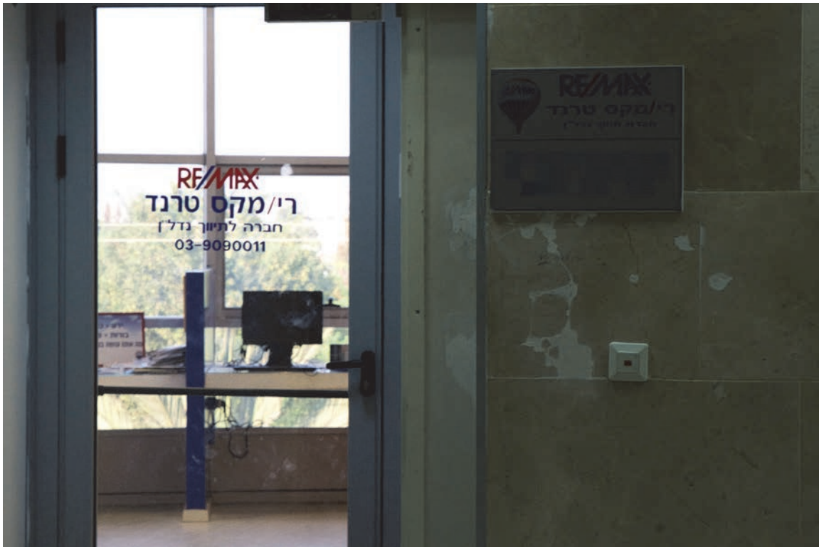
RE/MAX Trend, a branch of a Colorado-based real estate franchise located in the Israeli town of Rosh Ha’Ayin, sells and rents homes in the settlement of Ariel. RE/MAX also has a branch in the settlement of Ma’aleh Adumim.

according to its website; the franchise encompasses some 100 branches. 168 One of those branches is located in the settlement of Ma’aleh Adumim, and several other branches offer properties for sale or rent in settlements. 169 The number of homes that RE/MAX offers for sale or rent in settlements varies; in November 2015, for example, it listed 80 properties in 18 settlements on its Israeli website. 170 These listings included 12 properties in Ariel, at a total value of more than 13 million shekels ($3.25 million). 171