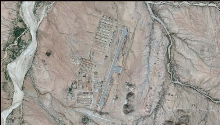
Satellite Imagery of the Sawa military camp, including the Warsai Yikealo Secondary School, recorded in January 2015.

Eritrea’s few international partners and donors should make clear that ongoing support will require concrete efforts by the government in these areas and push the government to establish independent, credible complaints mechanisms to investigate allegations of abuse of trainees and conscripts.