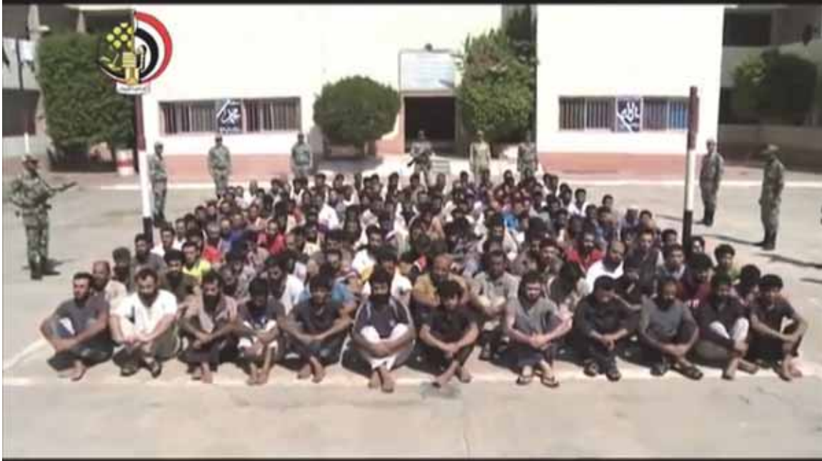
Image taken from the video titled “Confessions of Terrorists Arrested In Sinai,” that was circulated by the army and published by different local media including Al-Ahram’s YouTube channel. The image shows big numbers of detainees the army arrested in North Sinai inside one of the military bases, likely al-Galaa Military Base.

their disappeared relatives in such videos and photos. 165 Human Rights Watch has been able to verify that at least two individuals shown in videos and two photos posted on the Facebook page of the military spokesperson were forcibly disappeared by the army. A former soldier, who served at al-Galaa Military Base, said that another video published by al-Ahram , a state-owned newspaper, showed scores of detainees inside the base. 166