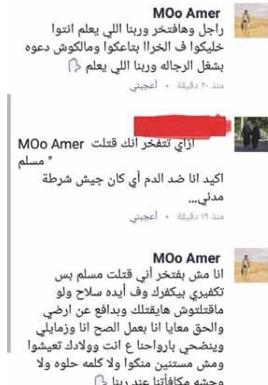
A screenshot sent by an activist to Human Rights Watch that showed statements posted on May 8, 2018, on Facebook by an Egyptian army officer apparently confirming his participation in an extrajudicial killing of a child. The officer did not respond to Human Rights Watch inquiries about his statements and the account was later deactivated. Human Rights Watch reviewed other pictures he posted of himself, in which he was carrying a weapon and wearing an Egyptian military uniform.

None of the victims’ families Human Rights Watch interviewed said that prosecutors investigated the killings of their relatives. Families felt intimidated by security forces and therefore accepted hospital burial permission forms and police reports that identified “bullets from an unknown source” as the cause of their relatives’ death. Those interviewed said they had to agree to this cause of death in order to obtain burial permissions, seek medical treatment for their relatives, or sometimes receive compensation. One family said they buried their relative without permission or a death certificate.