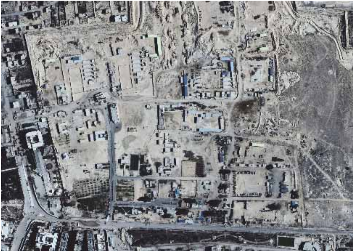
Satellite Image of Battalion 101 Military Base, December 4, 2017.

An Egyptian military base located in al-Arish hosts Battalion 101 of the Border Guards Unit. 311 The Border Guard Troops is a unit within the Egyptian army tasked with guarding the country's borders. Since the current conflict in Sinai escalated, the base appears to have been hosting more troops. According to eyewitness accounts, the army began detaining civilians at the base shortly after July 2013. 312