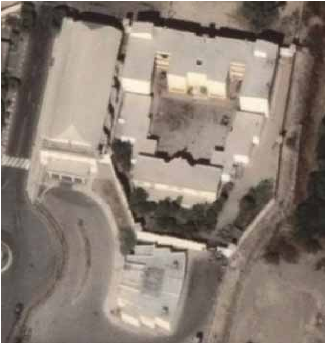
Satellite Imagery: Al-Azoly prison building in al-Galaa Military Base, October 12, 2017.