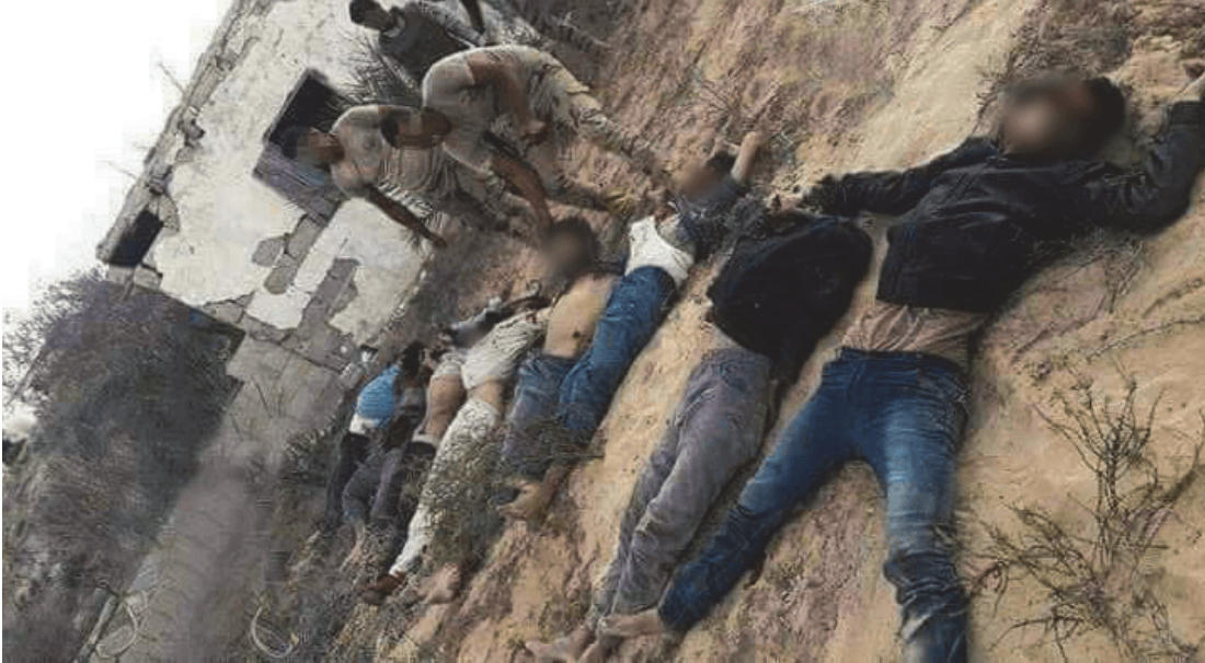
In at least two incidents, Human Rights Watch verified extrajudicial executions by government forces in North Sinai. This picture, provided to Human Rights Watch by a Sinai activist, shows the bodies of victims of extrajudicial executions by the army in April 2017.

Three Sinai residents confirmed to Human Rights Watch that the executioner was a well-known militia member from Sheikh Zuwayed whom they knew personally. 193 An Egyptian Military Intelligence officer, recognizable by his military uniform arm patch, appeared to be observing and directing the first execution, and the soldiers appeared to use the US-made Humvee vehicles to transport the detainees. 194 In December 2016, before the video was leaked, the army posted an official statement on Facebook with images of the slain individuals and weapons placed next to them, claiming they were “armed terrorist elements” killed in a security raid. 195 Activists in North Sinai reported that the two of the victims were brothers, ages 16 and 19, whom the army had arrested from Rafah and forcibly disappeared in July 2016. 196