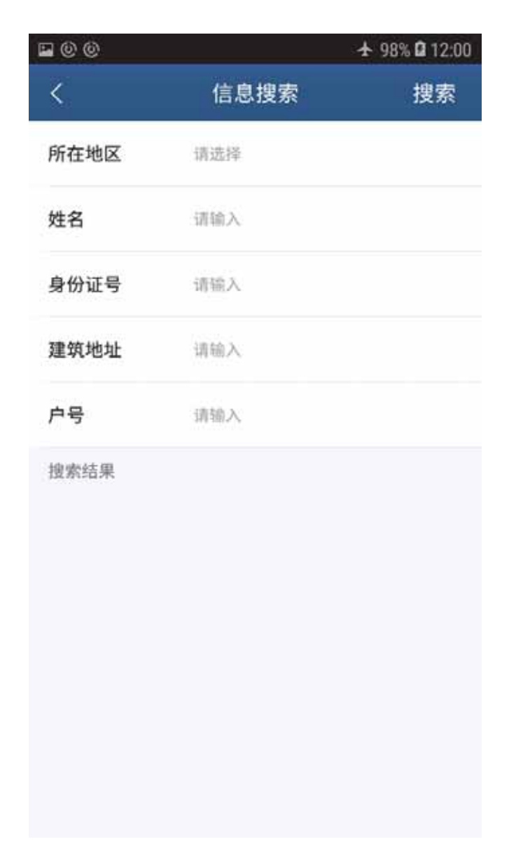
Fig.30: Screenshot showing how officials can search for information about people.