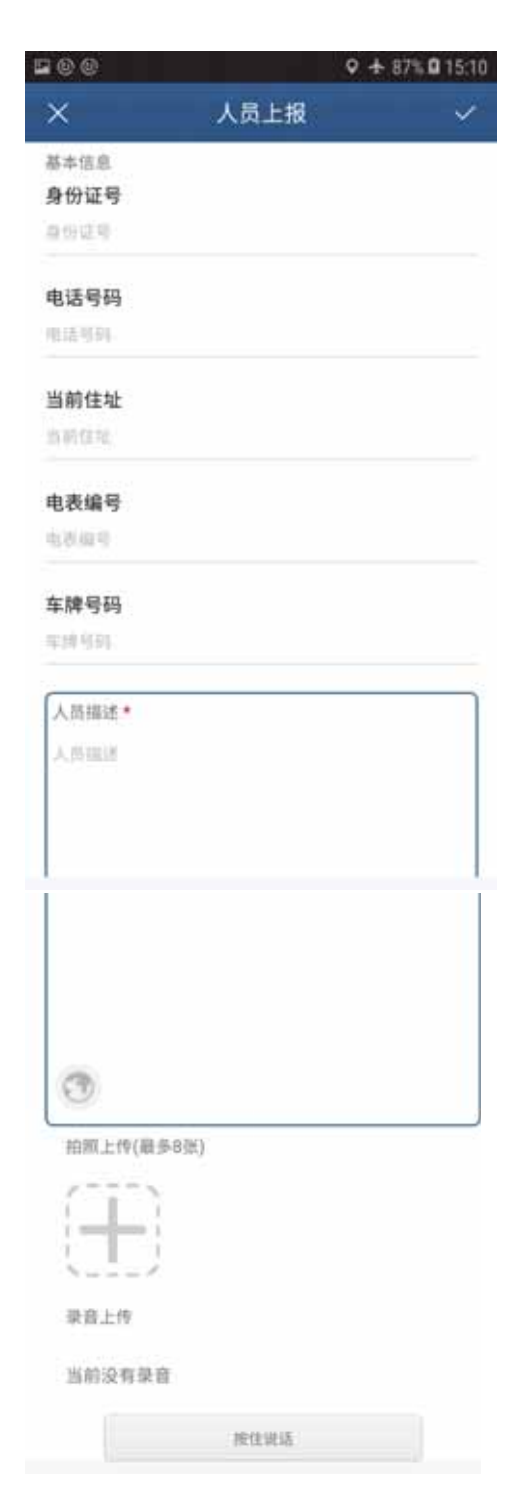
Fig.35: This is how officials can log a report about a person they find problematic.