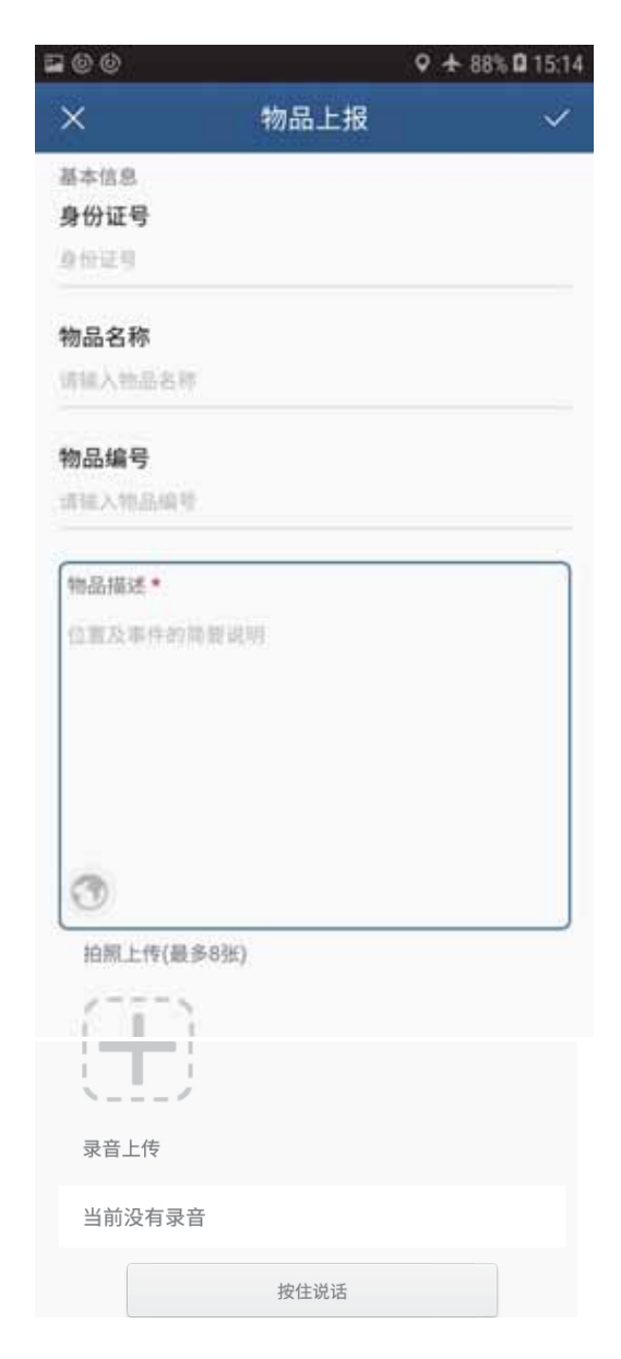
Fig.36: This is how officials can log an object they find problematic.