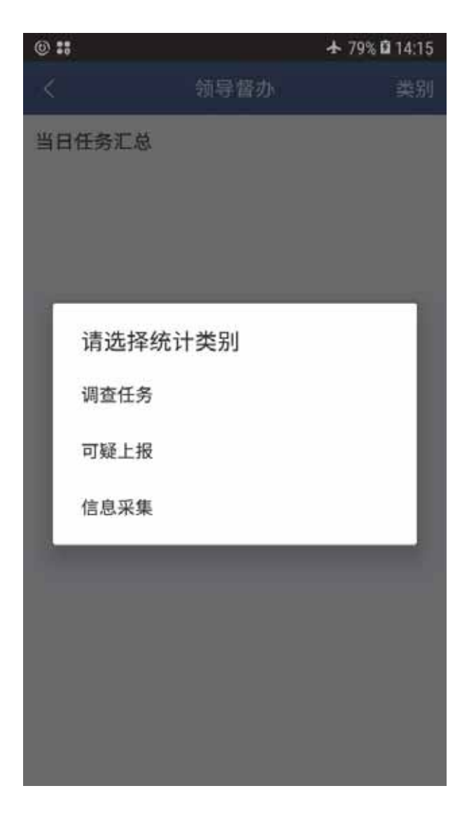
Fig. 28: A screenshot entitled "leader supervision" showing how supervisors can keep tabs on lower-level officials as they accomplish IJOP-related tasks.