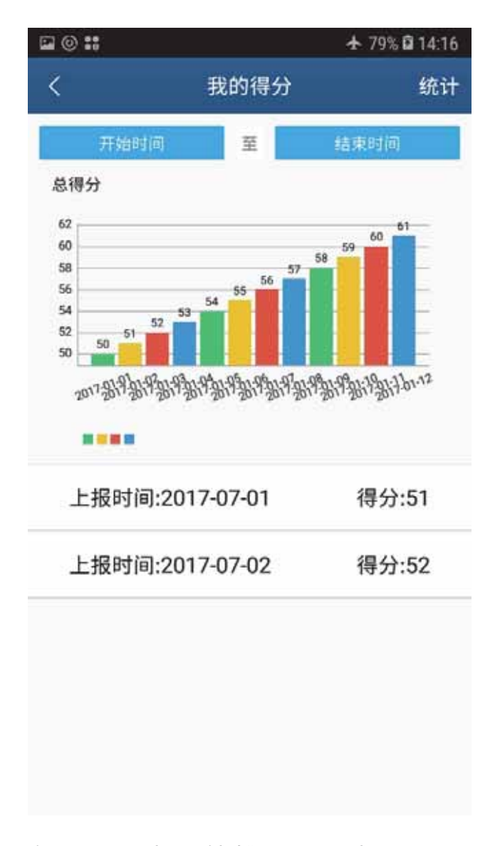
Fig.29: A screenshot entitled "my score" evaluates officials' progress accomplishing IJOP-related tasks.