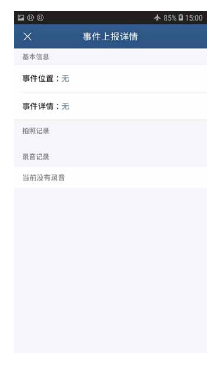
Fig.34: Screenshot showing details of an incident report.