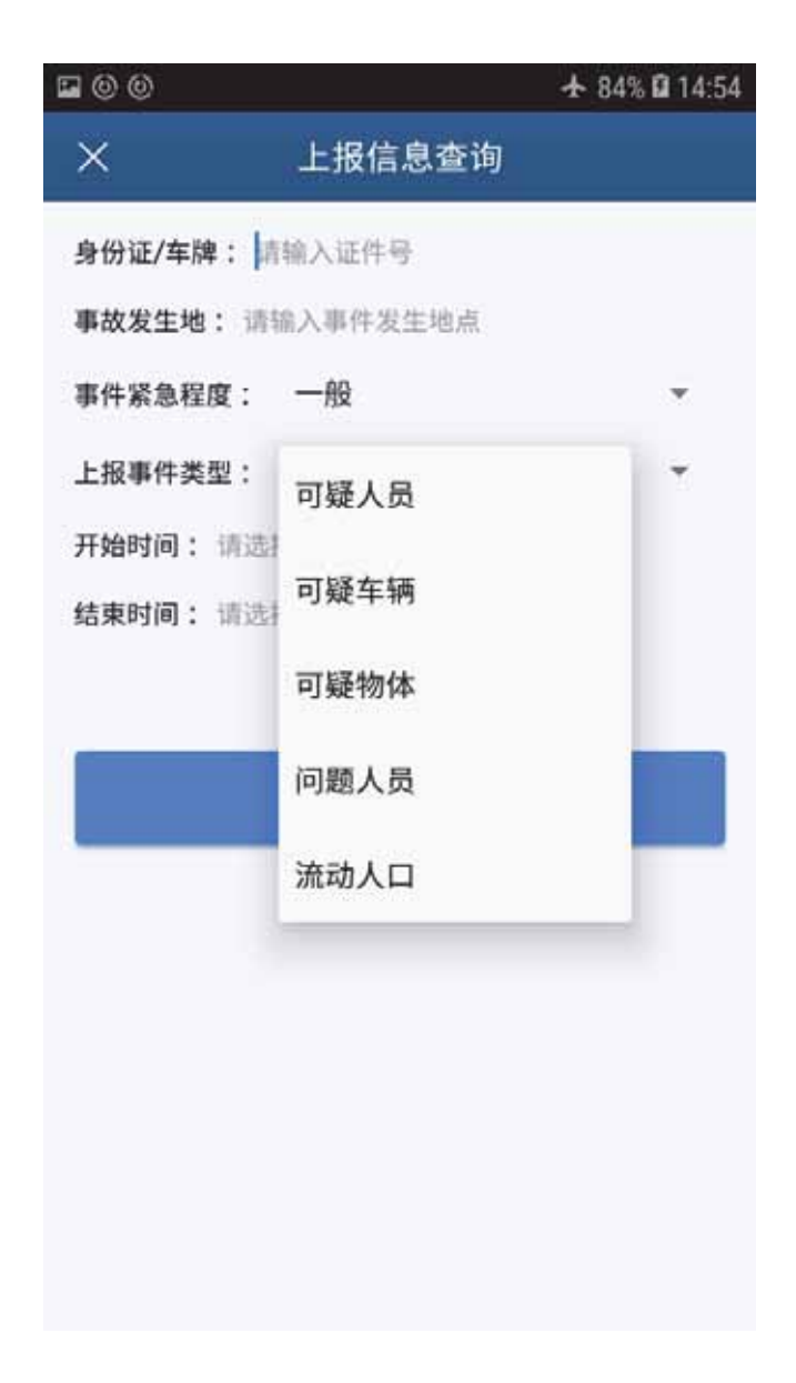
Fig.32: Screenshot showing how officials can search for incident reports filed concerning suspicious vehicles, objects, people, or about internal migrants.