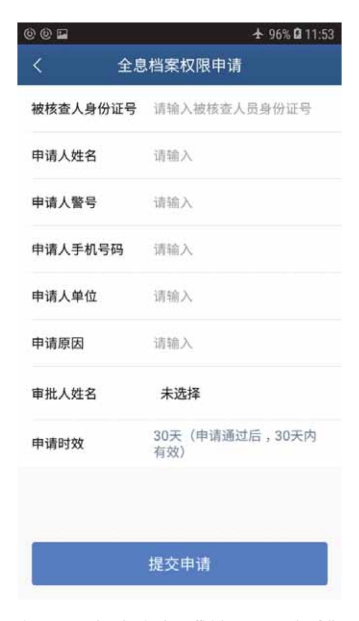
Fig.31: Screenshot showing how officials can access the "full profile" of a given individual.