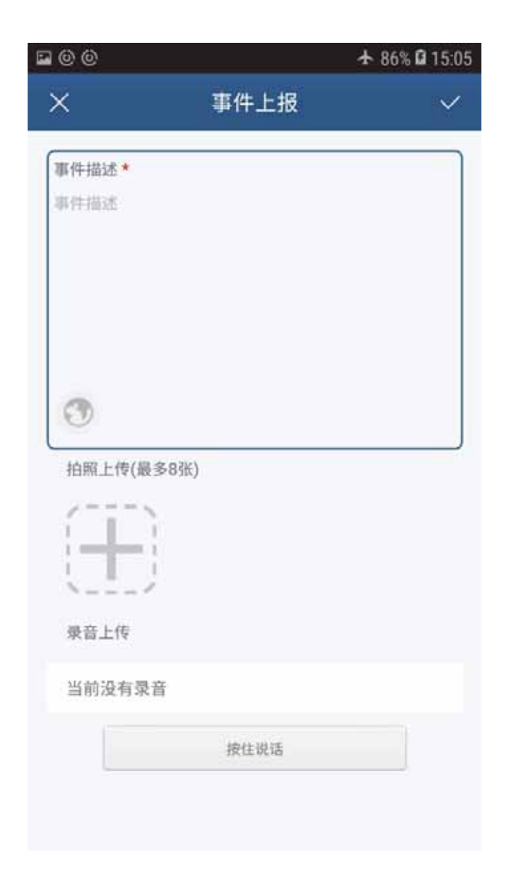
Fig.33: This is how officials can log an incident report.