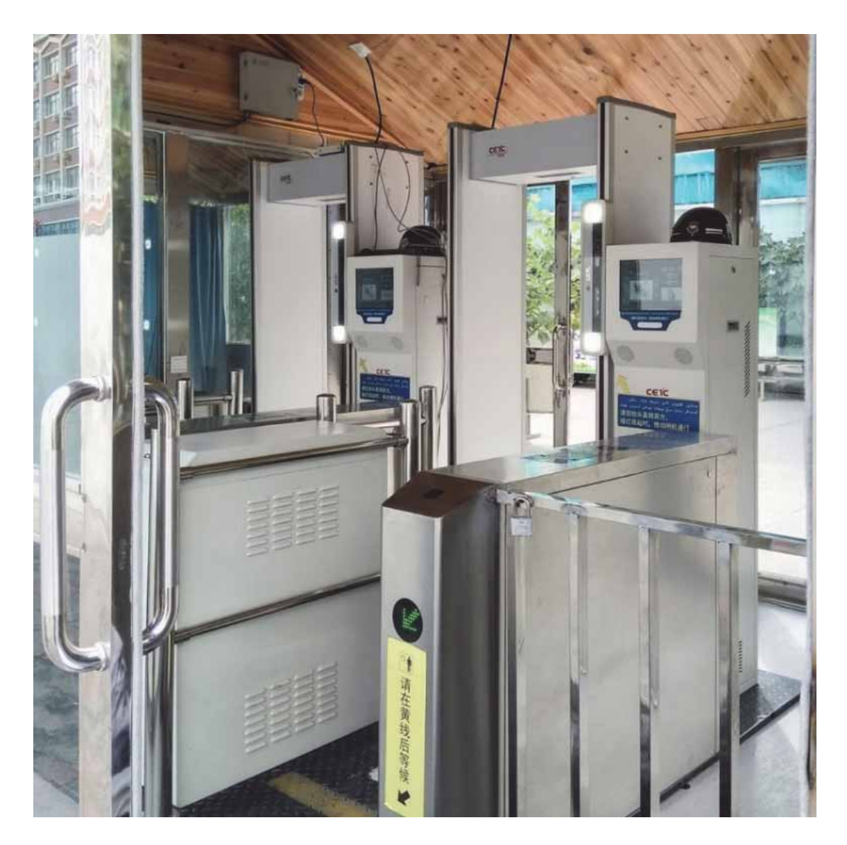
CETC's "three-dimensional portrait and integrated data doors" – special machines that are used in some of Xinjiang's checkpoints to vacuum up people's identifying information from their electronic devices. This is placed at the entrance to the Aq Mosque, in Urumqi, 2018.