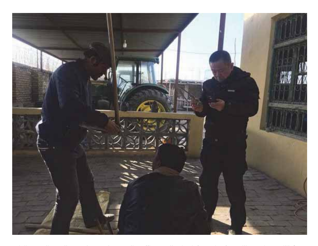
A Xinjiang Police College webpage shows police officers collecting information from villagers in Kargilik (or Yecheng) County in Kashgar Prefecture, Xinjiang.

On this page, the IJOP app requests different types of data depending on the type of situation in which information is being collected. For example, when officials are collecting information from people "on the street," "in political education camps," or "during registration for those who have gone abroad," the app further prompts them to choose from a drop-down menu whether the person in question belongs to one of 36 types of problematic "person types."