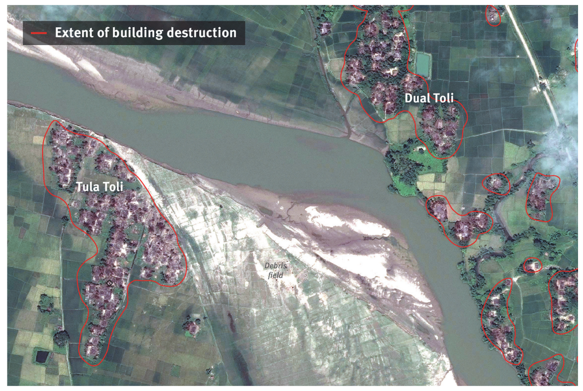
Satellite imagery