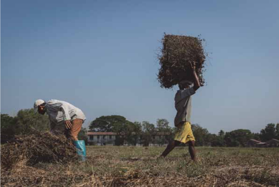
Farmers wrap and transport crops from a field in the Ayeyarwady Region.