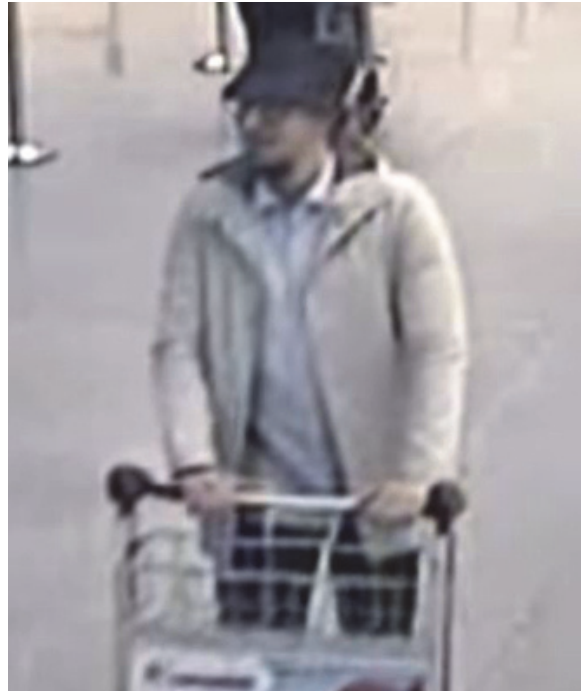
CCTV image from Belgium’s Zaventem Airport of the “man in the hat,” a prime suspect in the airport bombing.