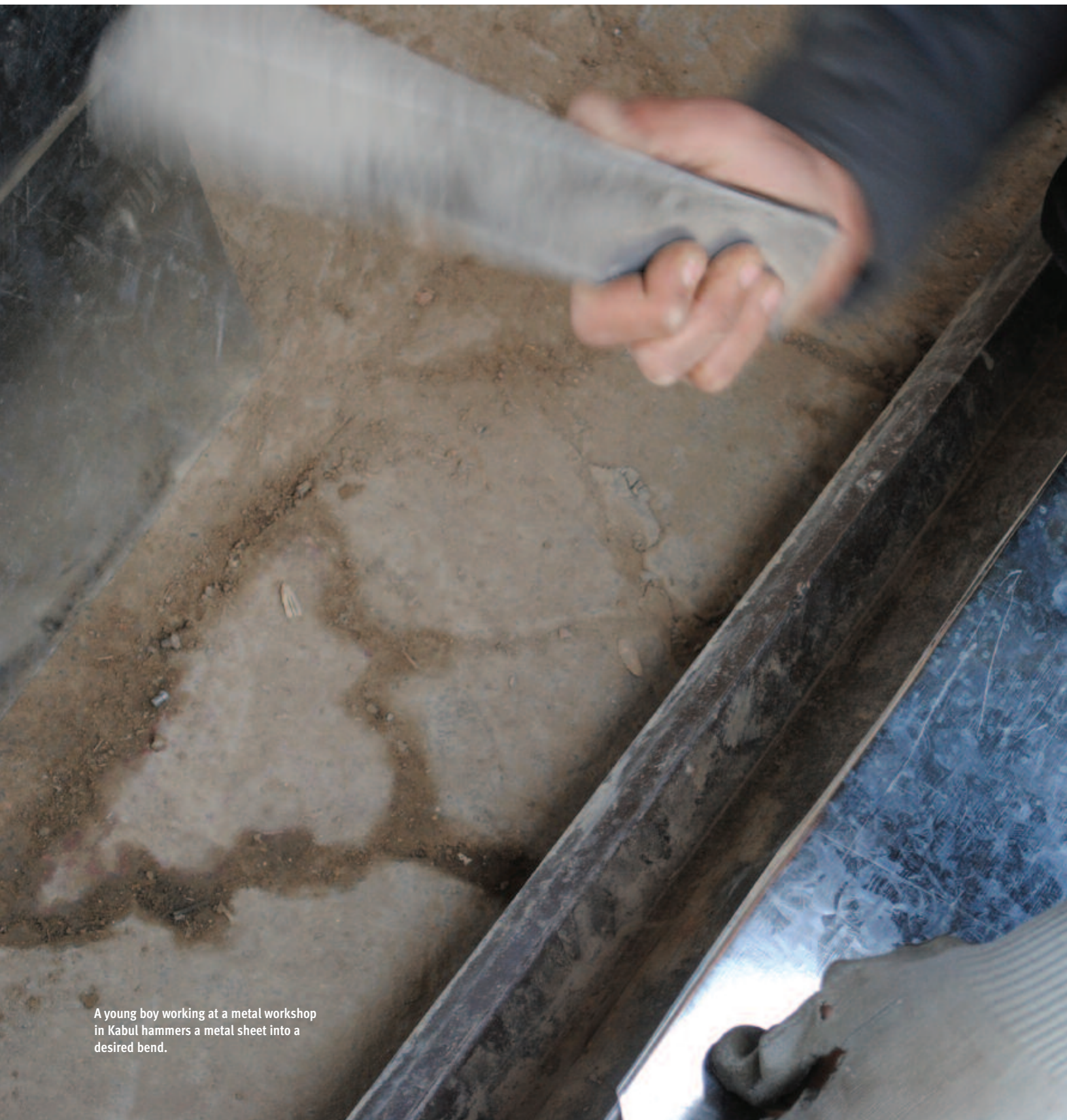
A young boy working at a metal workshop in Kabul hammers a metal sheet into a desired bend.