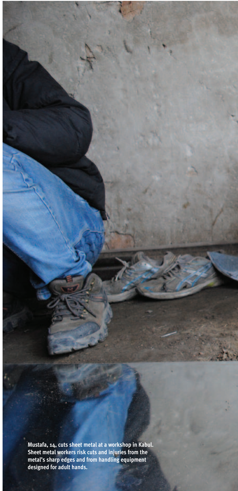
Mustafa, 14, cuts sheet metal at a workshop in Kabul. Sheet metal workers risk cuts and injuries from the metal's sharp edges and from handling equipment designed for adult hands.

Human Rights Watch also found that, beginning in their teenage years, children routinely carry out the full range of often hazardous tasks in metal work. They cut metal sheets using sharp metal cutters designed for adult hands, weld metal parts together, and carry and stack metal gates and window frames.