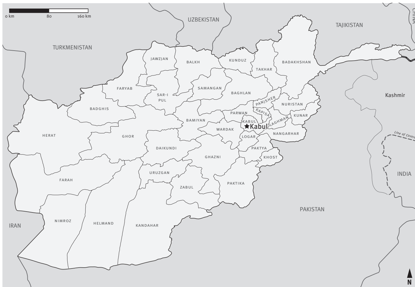
Map of Afghanistan.