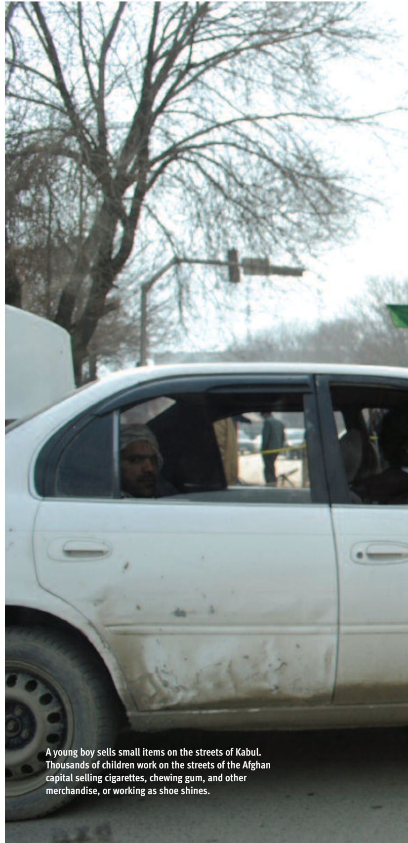
A young boy sells small items on the streets of Kabul. Thousands of children work on the streets of the Afghan capital selling cigarettes, chewing gum, and other merchandise, or working as shoe shiners.

Under Afghanistan’s Labor Law, 18 is the minimum age for employment. Children between the ages of 15-17 are allowed to work only if the work is not harmful to them, requires less than 35 hours a week, and represents a form of vocational training. Under the law, children 14 and younger are not allowed to work. 6 In April 2010, Afghanistan ratified both of the key international treaties related to child labor: International Labour Organization (ILO) Convention No. 182 on the Worst Forms of Child Labor, and Convention No. 138 on the Minimum Age of Employment. Despite these