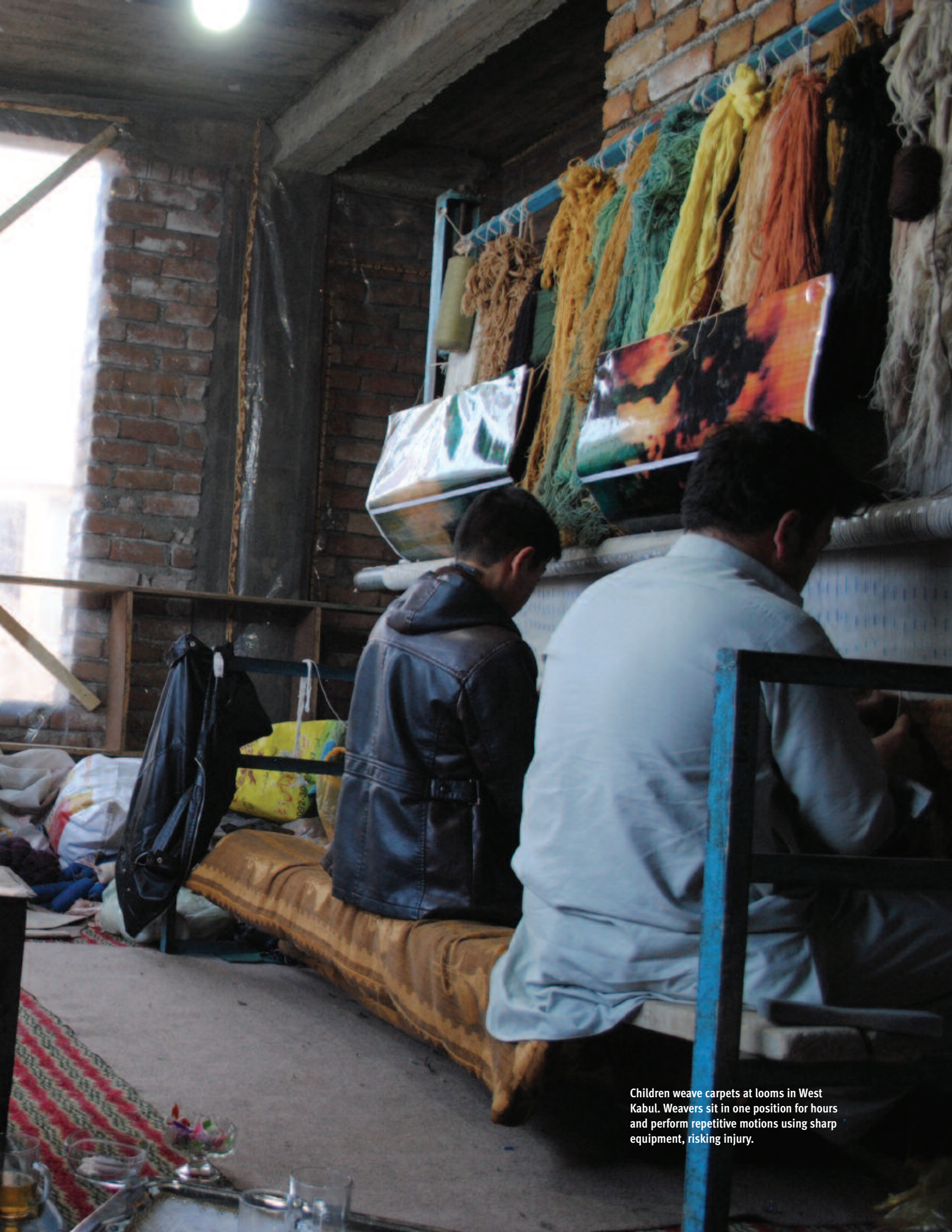
Children weave carpets at looms in West Kabul. Weavers sit in one position for hours and perform repetitive motions using sharp equipment, risking injury.