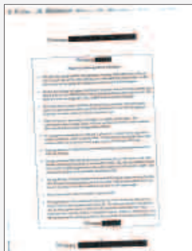
Report of the Central Intelligence Agency, inspector general, “Counterterrorism Detention and Interrogation Activities (September 2001 – October 2003) (2003-7123-IG),” May 7, 2004, p. 15.