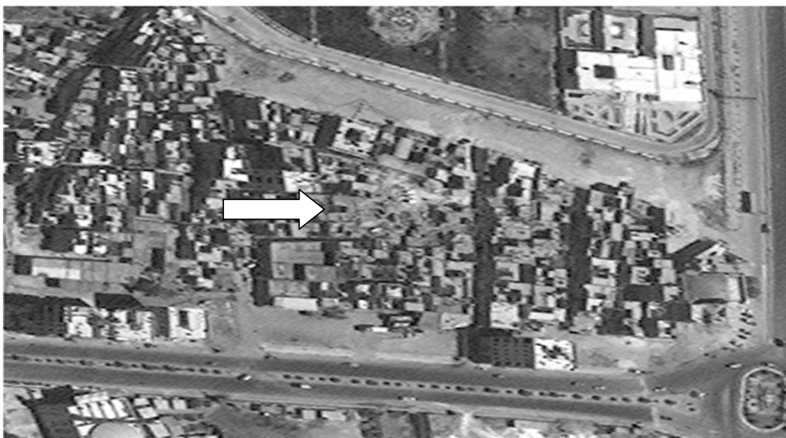
Digital Globe World View 1 – 27 July