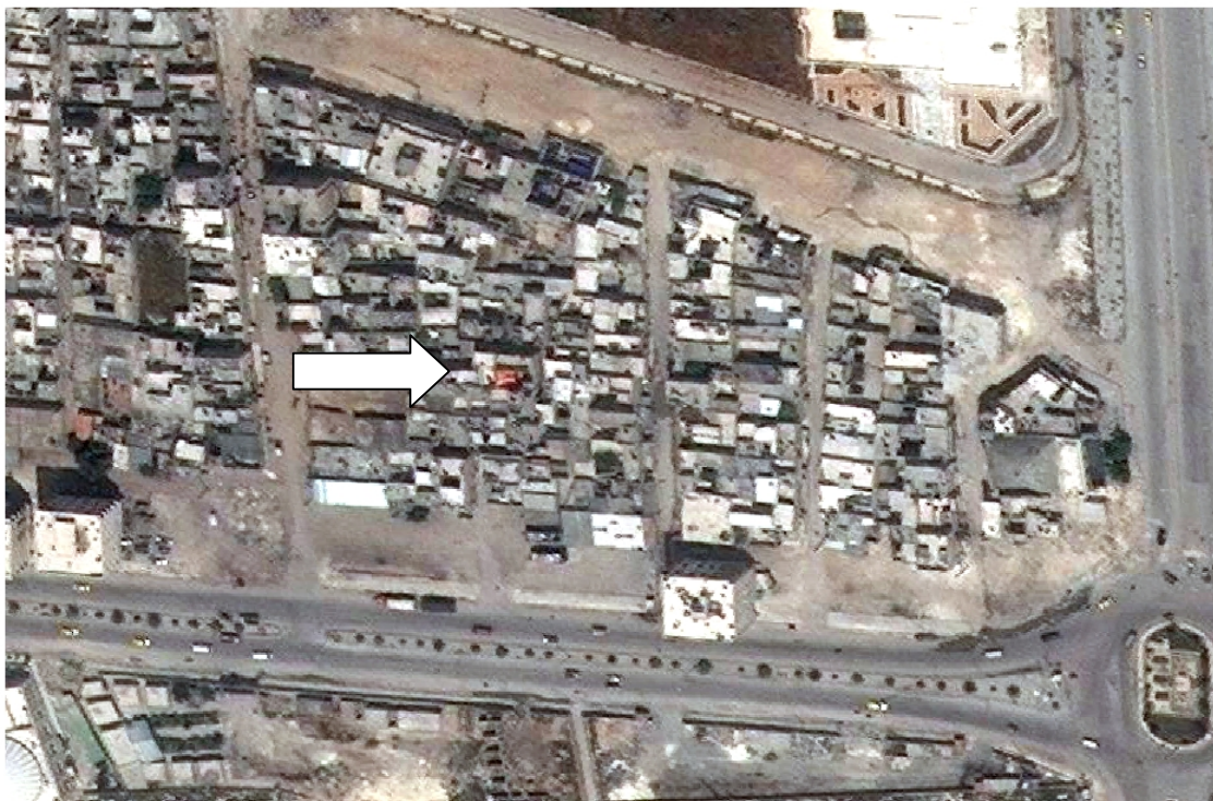
Digital Globe World View 1 – 13 May