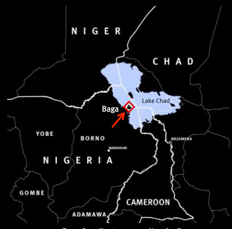
Town Coordinates: 13.094N 13.821E

Summary of main findings: A total of 2,275 destroyed and 125 severely damaged buildings were identified within the town of Baga (Borno State, Nigeria) based on a change detection analysis of two very high resolution satellite images collected on the mornings of April 6, before the violence, and April 26, 2013, after the violence. Damages were widely distributed across the southern half of Baga, with multiple clusters of near total building destruction measuring approximately 8 hectares in total area. Virtually all identified building damages exhibit signatures fully consistent with fire, including the presence of burn scars, destroyed trees as well as intact load-bearing walls without a roof. Further, damages match the spatial extent of satellite-detected active fire zones recorded on the night of April 16 (20:55 UTC, 21:55 local time) and the afternoon of April 17, 2013 (12:15 UTC, 13:15 local time) strongly suggesting identified building damages occurred during this period. It is likely that a small percentage of destroyed or severely damaged buildings have not been identified because of tree cover. Total building damages are therefore likely to be higher.