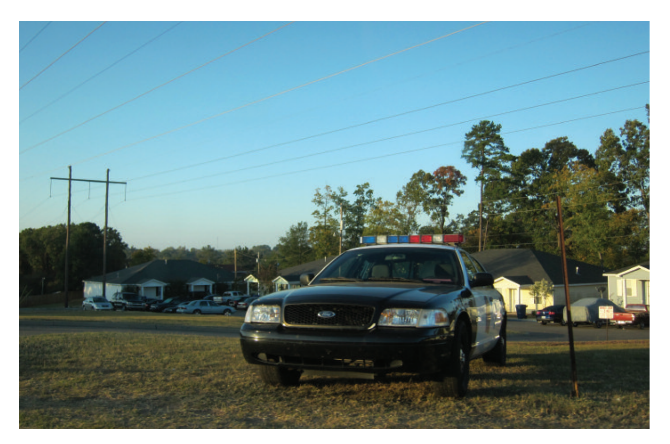
A police car on patrol in Troy, Alabama, where a state law in 2011 had placed severe restrictions on the access of unauthorized immigrants to public services, schools, and business contracts. A US Supreme Court ruling in 2012 set aside most of those limits, but allowed police to question people about their immigration status during routine stops.