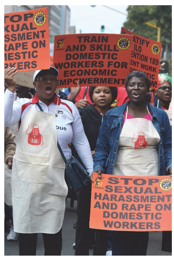
Hundreds of domestic workers organized by the South African Domestic and Allied Workers' Union (SADSAWU) rallied in April 2013 before the Office of the Department of Labour to speed South Africa's ratification of the ILO Domestic Workers Convention. South Africa ratified the convention in June 2013.

Migrant workers, refugees, and asylum seekers may face barriers due to their status, language barriers, and unfamiliarity with local laws. Migrant workers with undocumented status may be afraid to approach authorities to report abuse for fear of arrest or deportation. Migrant workers whose legal status is tied to their employers are more likely to face abusive situations because their employers know that they cannot leave their employment without losing their status. Human Rights Watch has documented violence, including sexual violence, faced by migrant domestic workers in the Middle East, where countries implement the kafala (sponsorship) system under which workers visas are tied to their employers and they are not allowed to leave or change jobs without their employer's permission.<sup>13</sup> In 2016, Human Rights Watch found the potential loss of legal residency made Syrian refugees vulnerable to labor and sexual exploitation by employers in Lebanon, and limited their ability to turn to authorities for protection.14