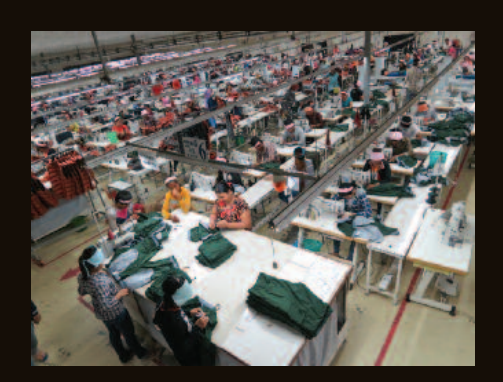
Women workers in a garment factory in Cambodia.