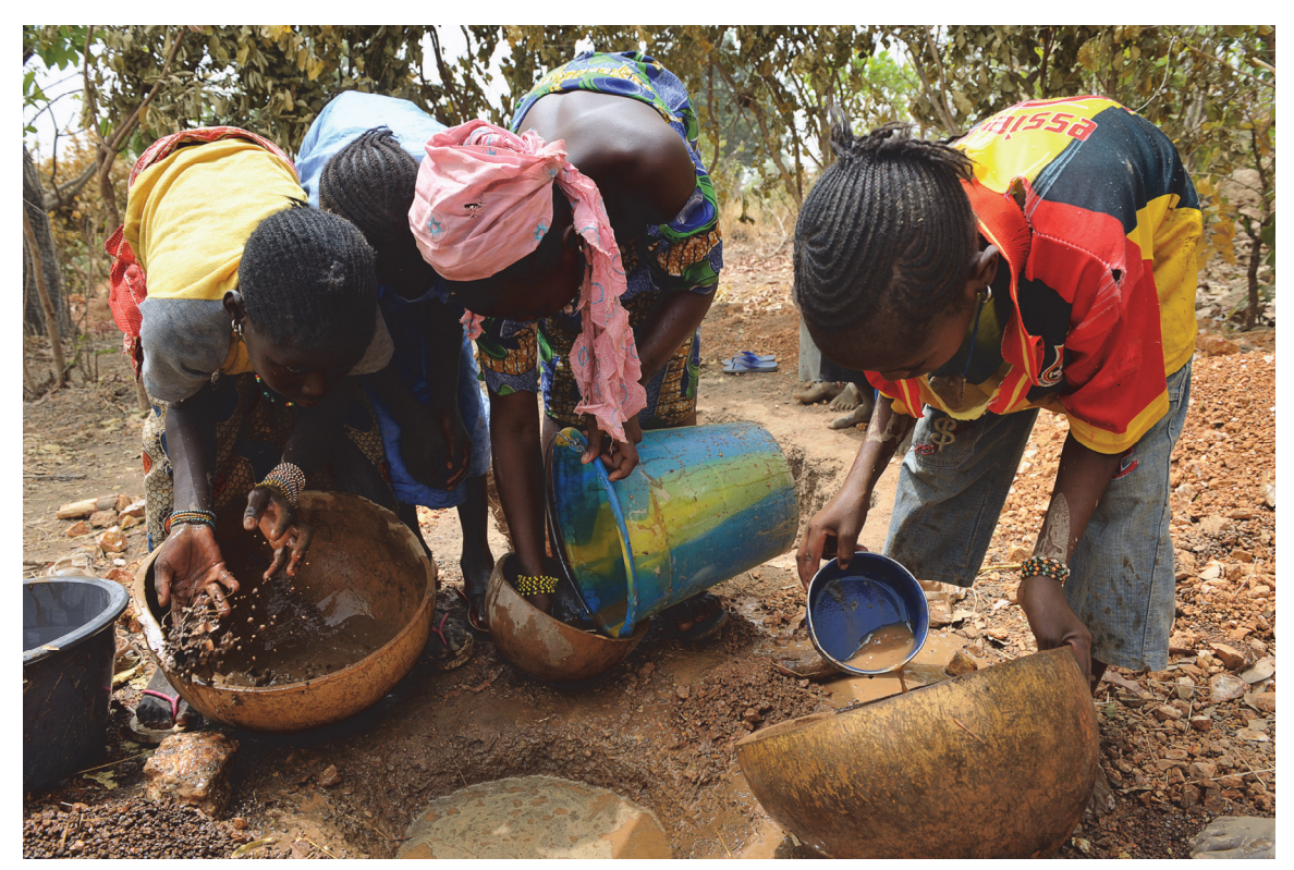
Children and a woman pan for gold at an artisanal gold mine, Kéniéba circle, Mali. Sexual exploitation is common in mining areas, particularly in large mines that bring together many different populations from within and outside Mali.

The ILO Committee of Experts on the Application of Conventions and Recommendations (CEACR) considers, in relation to labor discrimination cases, that once the complainant has produced plausible or prima facie evidence of discrimination, then shifting the burden of proof to the employer "is a useful tool of correcting a situation that could otherwise result in inequality."<sup>20</sup>