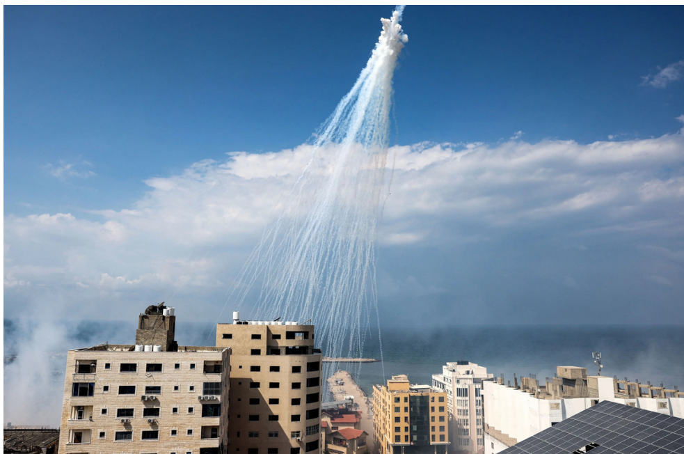
Airbursts of artillery-fired white phosphorus fall over the Gaza city port, October 11, 2023.

Human Rights Watch verified videos of white phosphorus use by the Israeli military in Lebanon and Gaza on October 10 and 11, 2023, respectively. Videos showed multiple airbursts of artillery-fired white phosphorus over two rural locations along the Israel-Lebanon border and over the Gaza City port. 3