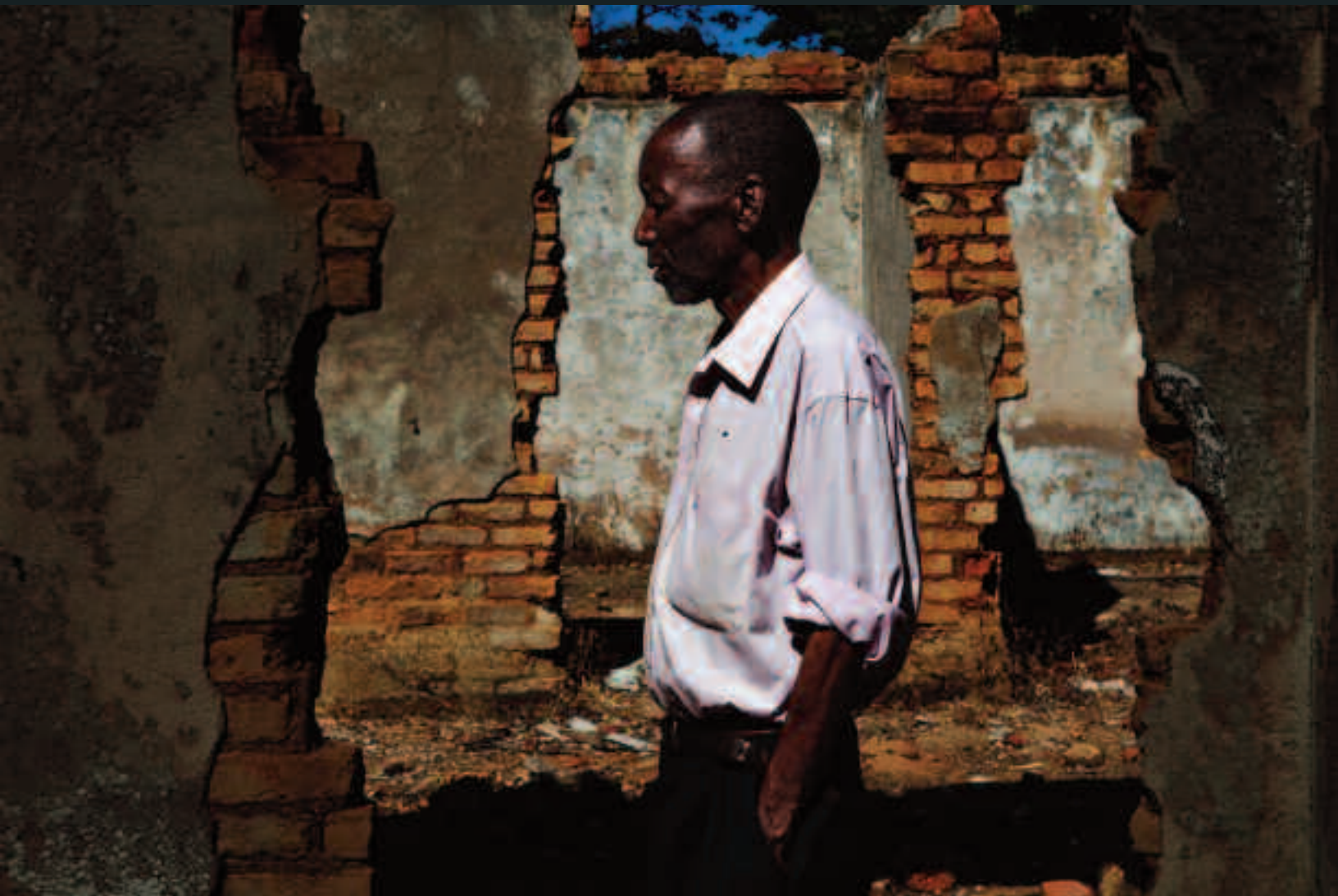
An elderly man stands in the ruins of his home in Zimbabwe, torched by ZANU-PF militias.