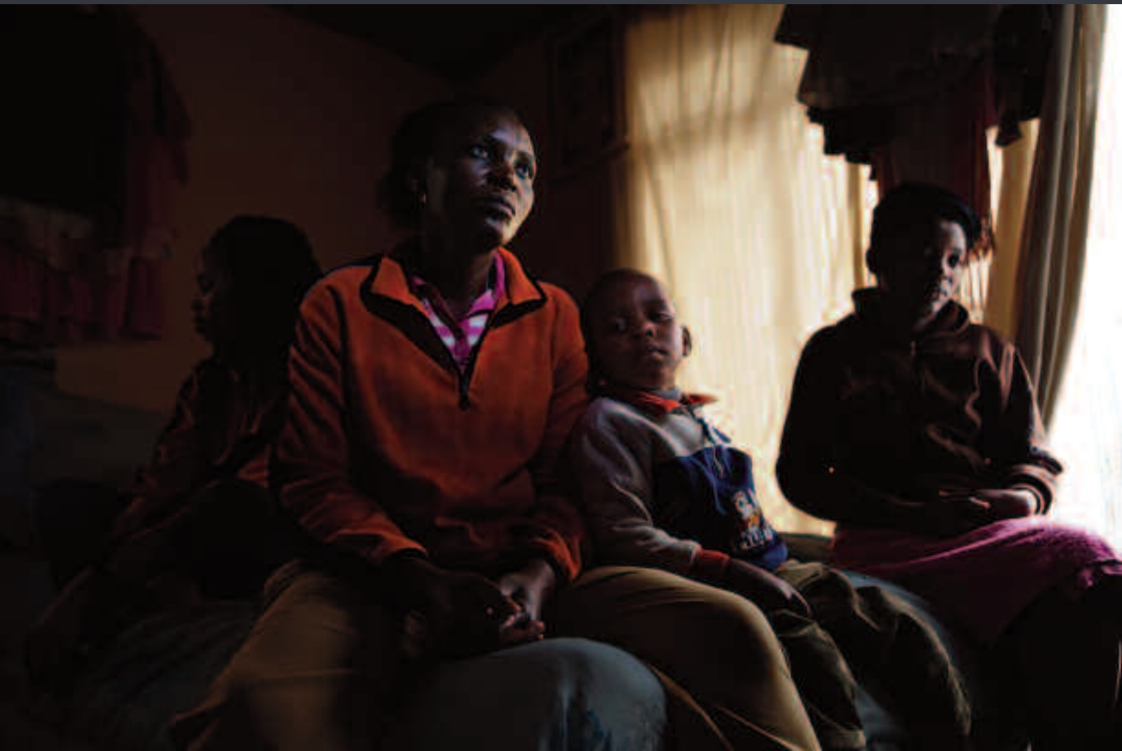
A Zimbabwean refugee sits with her children in South Africa. Police killed her husband, an MDC organizer, during a peaceful protest march in Zimbabwe in 2007.