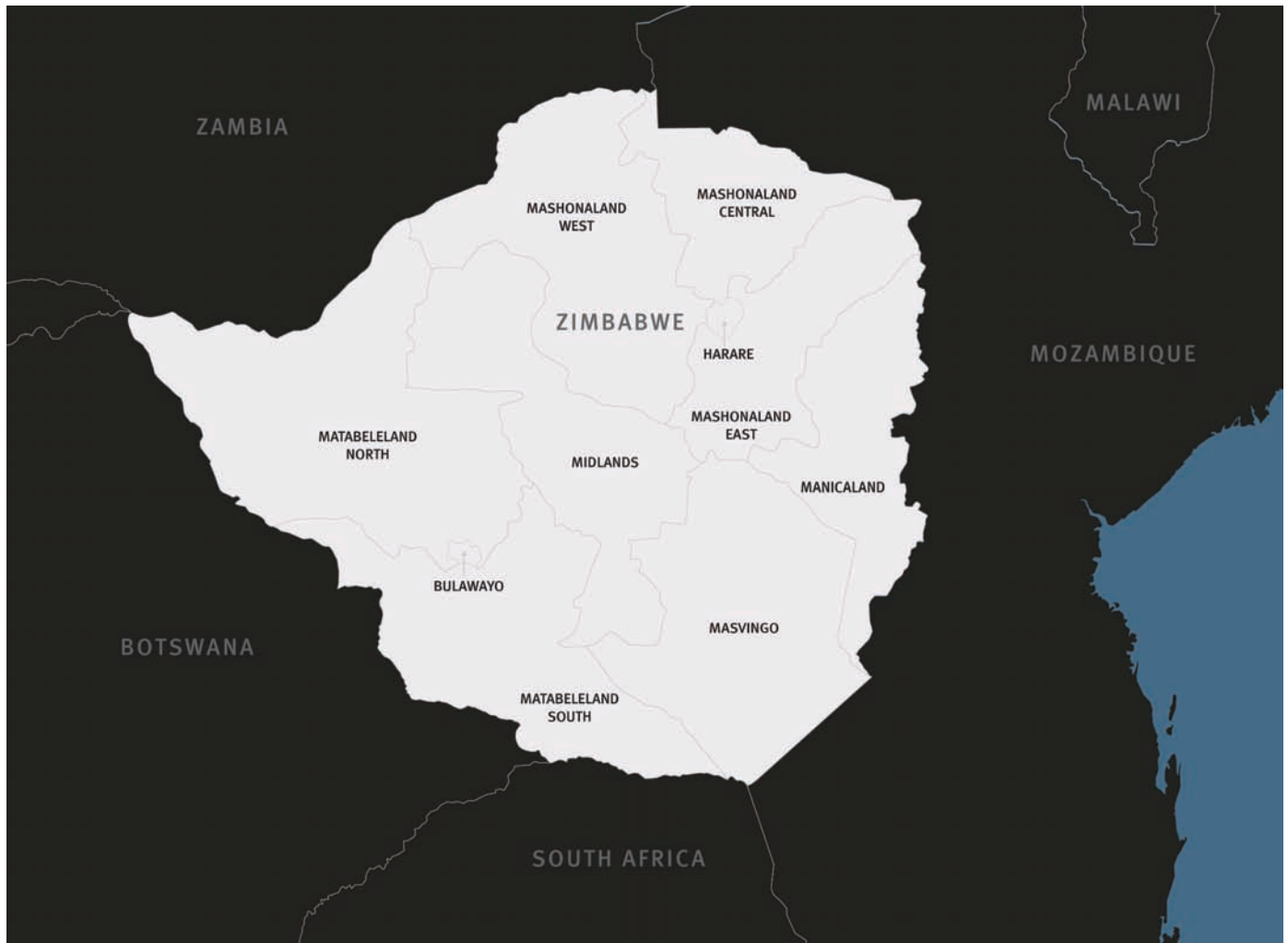
Map of Zimbabwe © 2011 Human Rights Watch