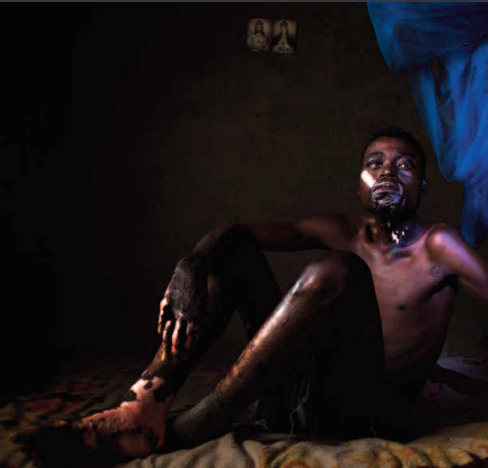
A young supporter of the Movement for Democratic Change [MDC] opposition party sits in his room in rural Zimbabwe. He said that after the 2008 March elections, Zimbabwean Army soldiers locked him and other supporters in a building and set it ablaze. He now has limited use of his hands and is blind in one eye.