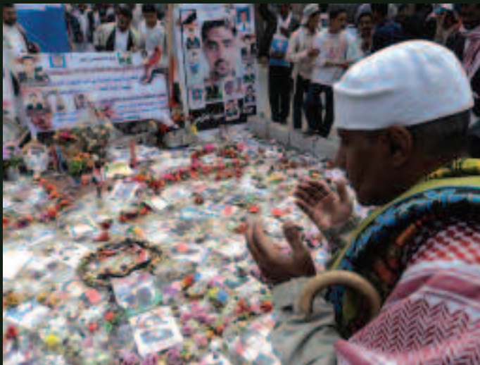
A ceremony honoring those killed in the Friday of Dignity massacre in Sanaa, Yemen, on March 18, 2011, held one week later at the site of the killings. The text on the posters contains a prayer and names of the dead.

Unpunished Massacre details political interference in the investigation as well as testimony from protesters, suspects, and other witnesses implicating government officials in the attack. It calls on Yemeni authorities to carry out a new probe to ensure all those responsible for the massacre are brought to justice, regardless of rank. It warns that absent these measures, the procedures could perpetuate impunity in a post-Saleh Yemen.