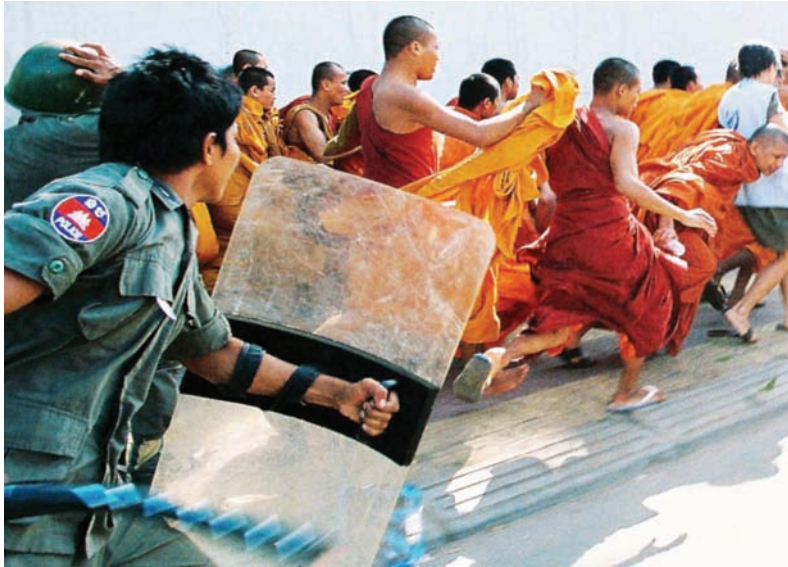
Cambodian riot police chased and beat Khmer Krom Buddhist monks after they tried to deliver a petition to the Vietnamese Embassy in Phnom Penh calling for greater religious freedom for Khmer Krom in Vietnam.

Cambodian territory, is the fault line on which virtually every popular opposition movement in Cambodia attacks the government, and an issue on which the Cambodian government is extremely sensitive.