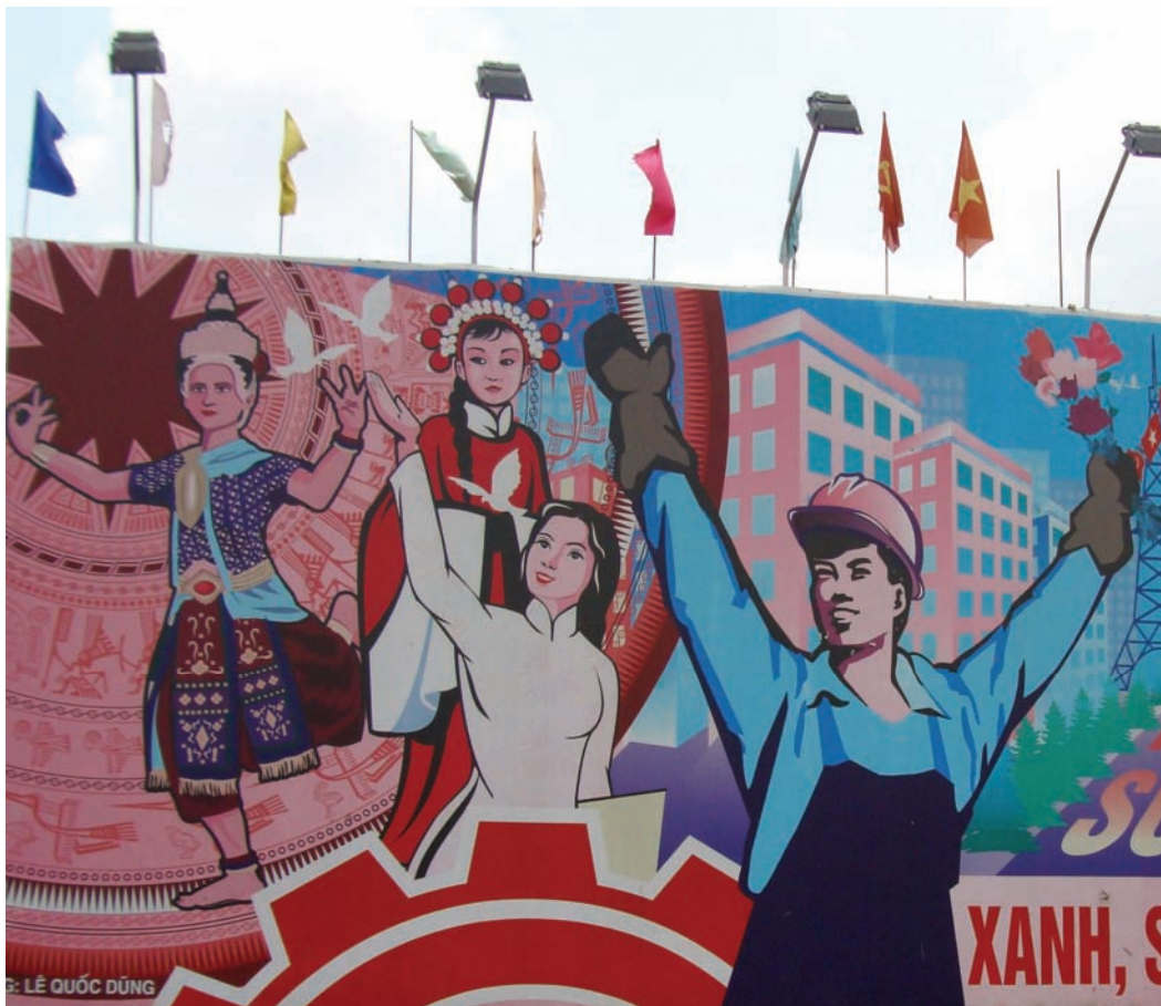
A government propaganda billboard in Soc Trang provincial town exhorts Vietnam's different ethnic minority groups, including a Khmer woman at the far left, to work together to build a beautiful, clean and "civilized" city.

The actual situation of the Khmer Krom is difficult to ascertain, given the restrictions Vietnam places on human rights research. However, the widespread perception among Khmer Krom of discrimination is itself a cause for concern, and has only been deepened by the government's efforts to deny there is a problem and forcefully punish those who complain.