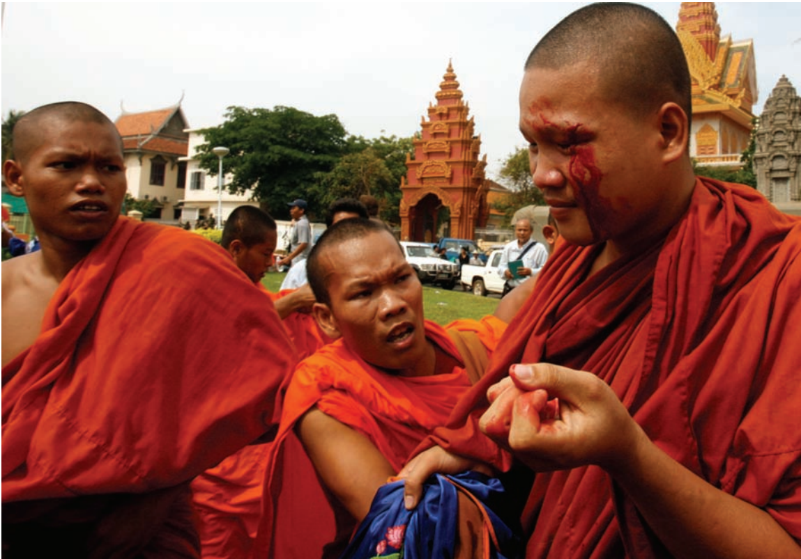
Counter-demonstrators physically attacked Khmer Krom protesters on April 20, 2007 in front of Phnom Penh's Ounalom Pagoda.

On April 20, 2007, police forcefully dispersed another demonstration by around 50 Khmer Krom monks at the Vietnamese and US embassies in Phnom Penh. 187 Later that night one of the monks who had joined in the march was badly beaten by a group of unknown men after returning to his pagoda. 188