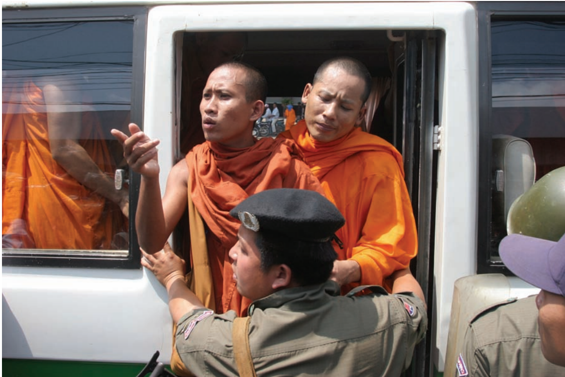
Phnom Penh authorities ordered police to load protesting monks onto busses during a demonstration in Phnom Penh on February 27, 2007, for defrocking and deportation to Vietnam.

representative of the chief of monks for the Phnom Penh municipality, ordered the monks to cease demonstrating and threatened to have all the protesters defrocked and investigated. A stand-off ensued, as police officers began to push the monks into a bus, ostensibly to be defrocked and sent to Vietnam.