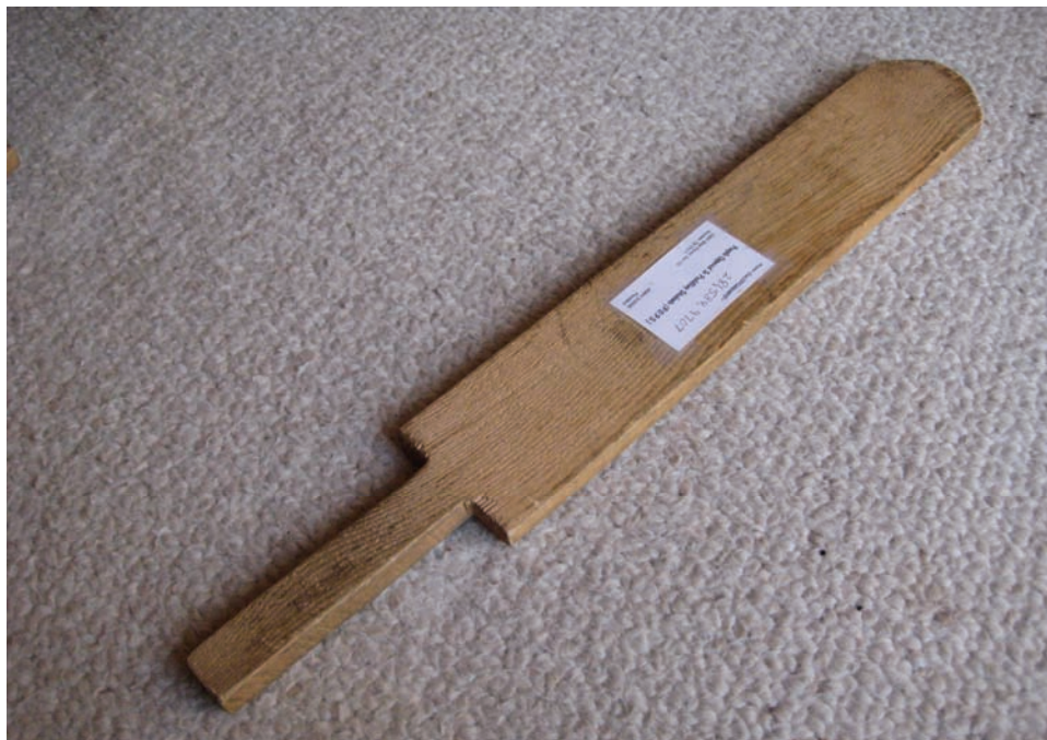
Paddles made from baseball bats (keys indicate size) and standard paddle.