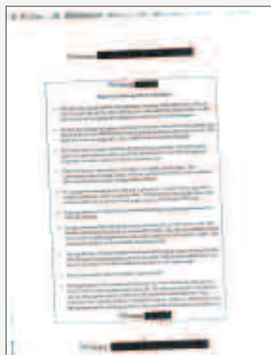
Report of the Central Intelligence Agency, inspector general, “Counterterrorism Detention and Interrogation Activities (September 2001 – October 2003) (2003-7123-IG),” May 7, 2004, p. 15.