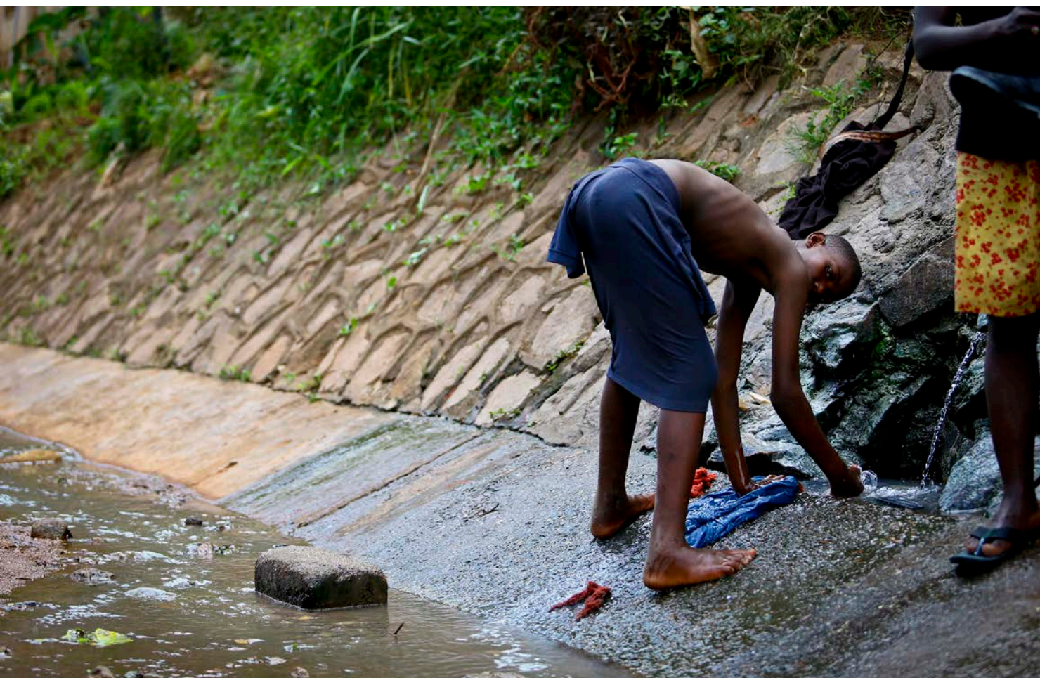
A 14-year-old boy washes his only pair of pants in the Nakivubo sewage channel in Kampala, his shirt tied around his waist.

The Ugandan government has adopted strong domestic child protection legislation including the Children Act and laws prohibiting child labor. The Ministry of Gender, Labour and Social Development has created multiple programs and policies intended to realize the rights of at-risk children like the National Strategic Programme Plan of Interventions for Orphans and Other Vulnerable Children, which includes street children. And yet the government of Uganda has failed to meet its obligations to protect children on the streets from abuse at the hands of the police, local authorities, and others, because of the shortcomings in the government's implementation of its child protection framework.