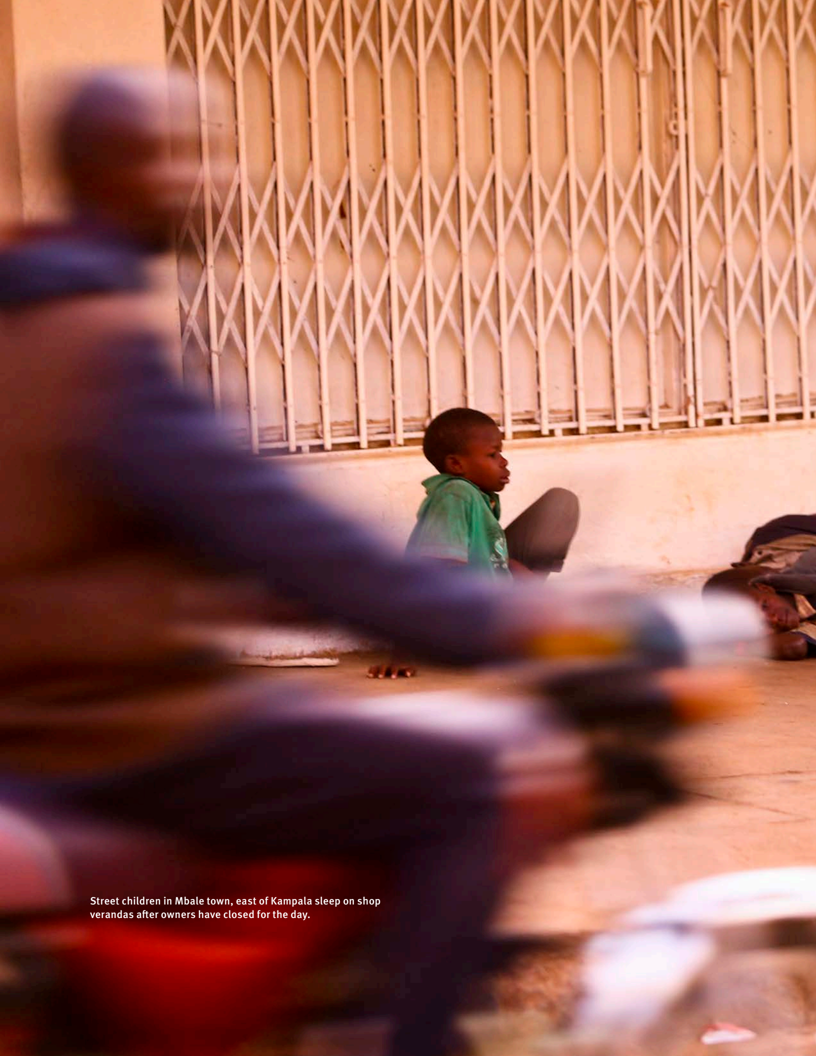
Street children in Mbale town, east of Kampala sleep on shop verandas after owners have closed for the day.