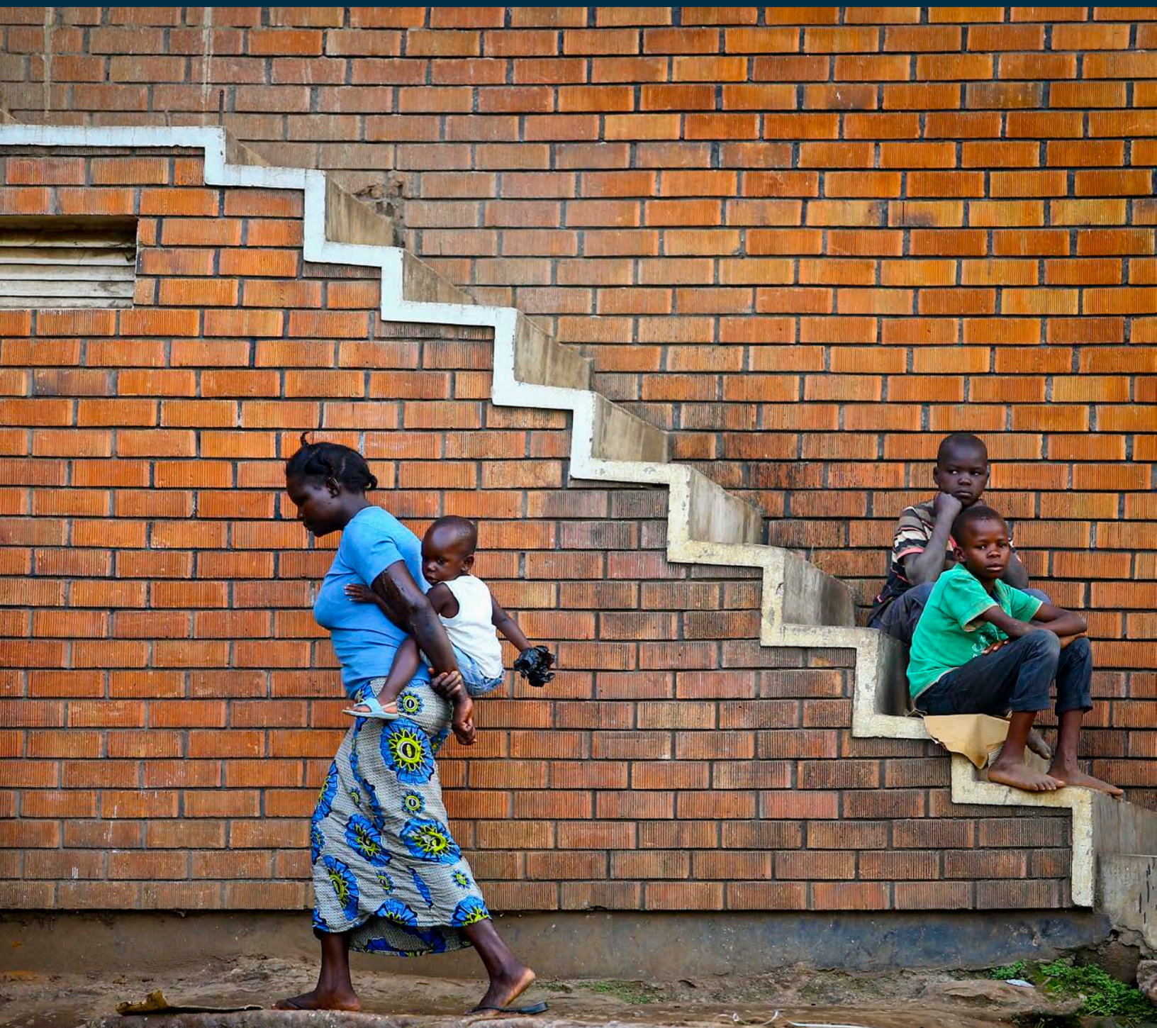
Street boys rest on the steps of a building in downtown Mbale town, east of Kampala. Many street children spend their time outside of stores and other businesses, in car parks, or inside music or video halls during the day when they are not searching for work or ways to find food.