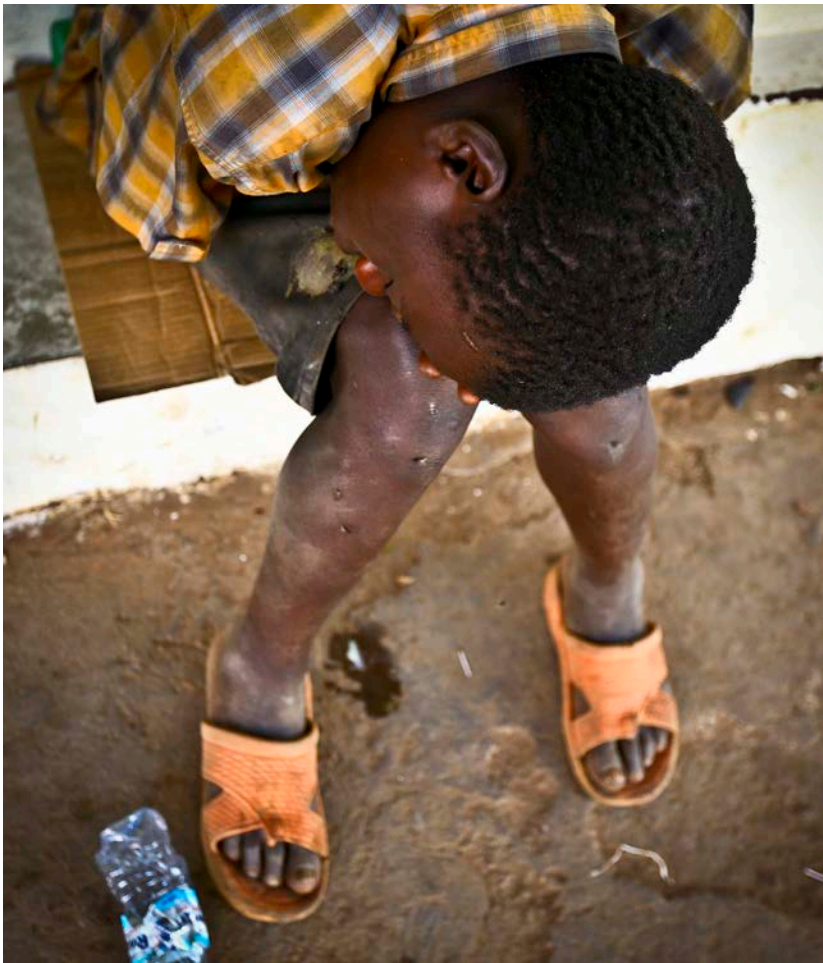
A boy sleeps seated during the day outside of a closed business on a street in Mbale town, east of Kampala. Many children sleep during the day, and not at night, out of fear of being attacked at night by older street children or security personnel.

The government should ensure that street children are afforded the same rights and protections under domestic Ugandan law and regional and international provisions as all other Ugandan children. Human Rights Watch calls on the government of Uganda to meaningfully implement its child protection system and ensure that authorities in child protection at the district level have the means, support, and training to adequately perform their duties. The ministry of gender and local government officials should cease ordering roundups of children and arbitrary arrests. They should instead focus on ending the stigma associated with street children by providing education and positive campaigns on the rights of all