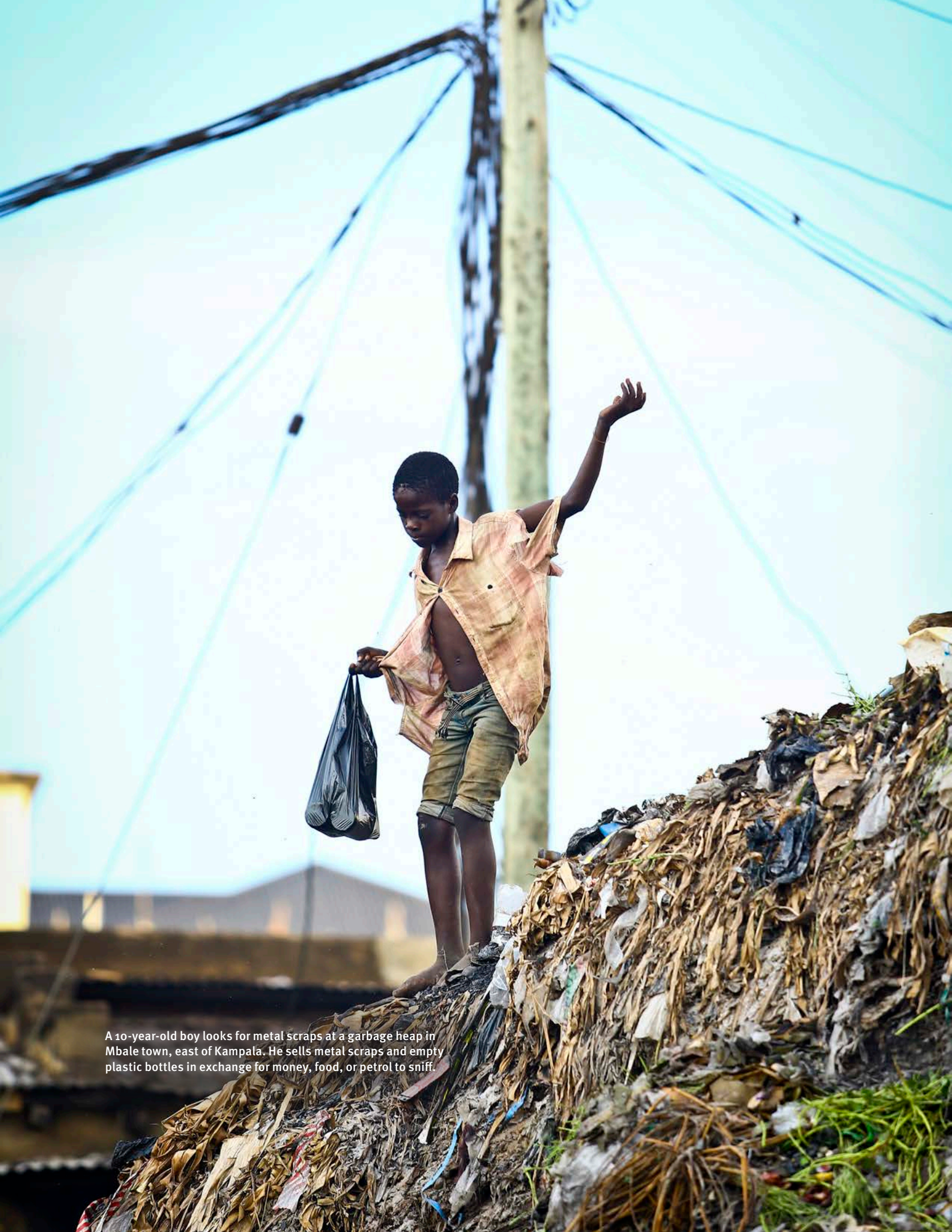
A 10-year-old boy looks for metal scraps at a garbage heap in Mbale town, east of Kampala. He sells metal scraps and empty plastic bottles in exchange for money, food, or petrol to sniff.