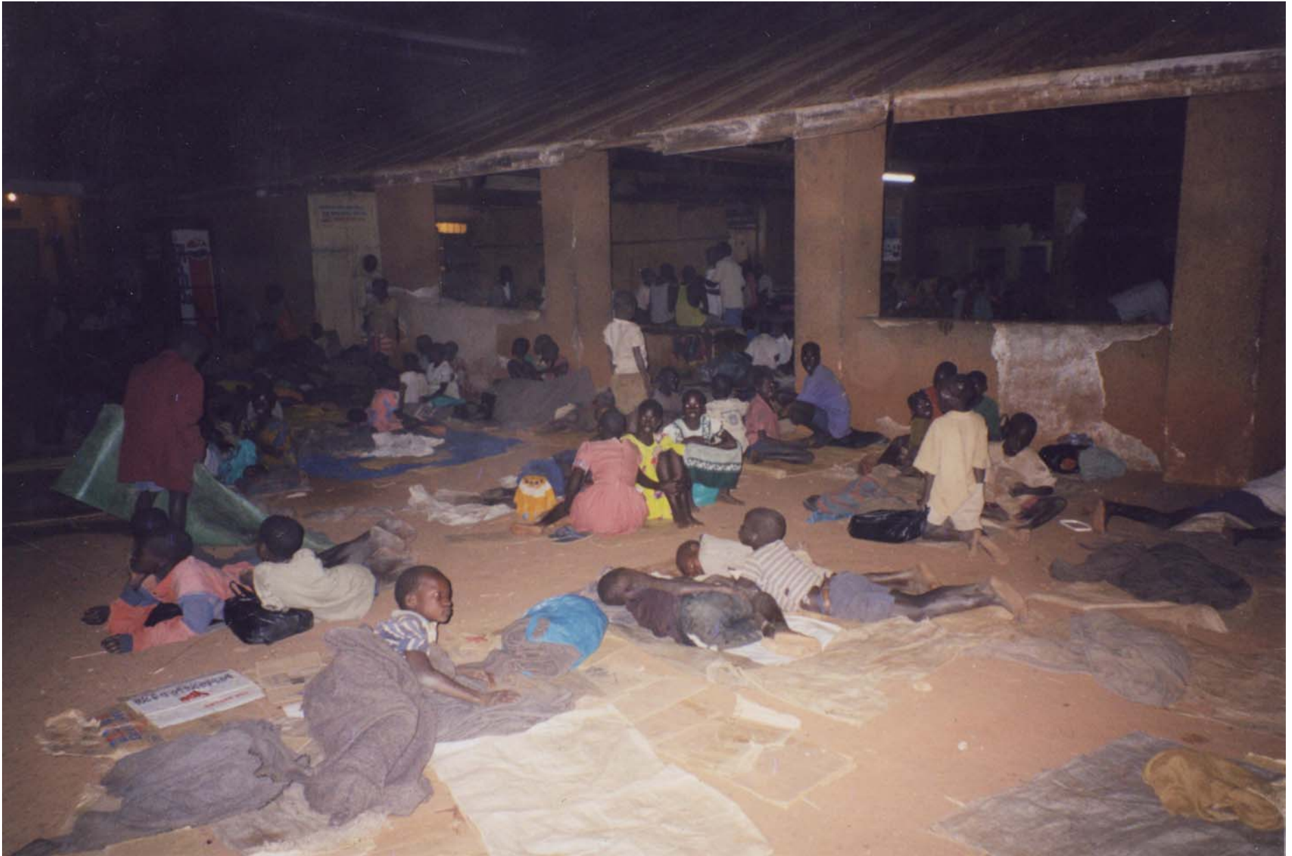
Children known as "night commuters" sleep at the bus terminal in Gulu, seeking safety from LRA abduction.