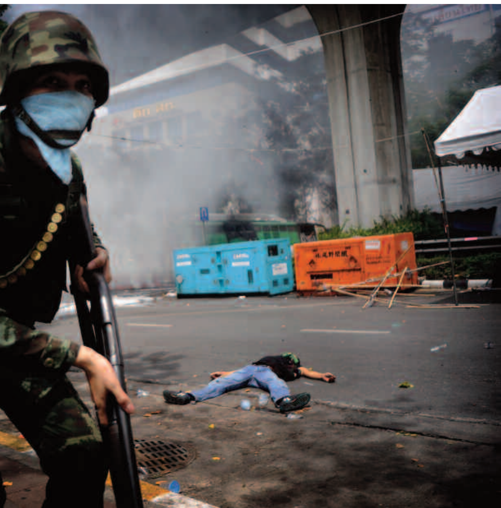
A protester lies shot as armed soldiers attempt to clear an area occupied by Red Shirts along Rachadamri Road in Bangkok in the early morning hours of May 19, 2010.