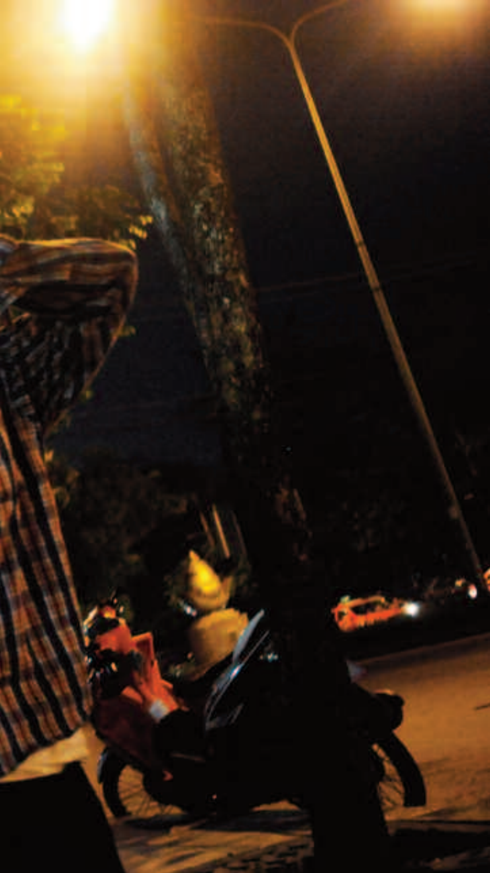
A Red Shirt protester aims a slingshot at Thai army soldiers in Lumpini Park, along Wittayu road in Bangkok on May 13, 2010.