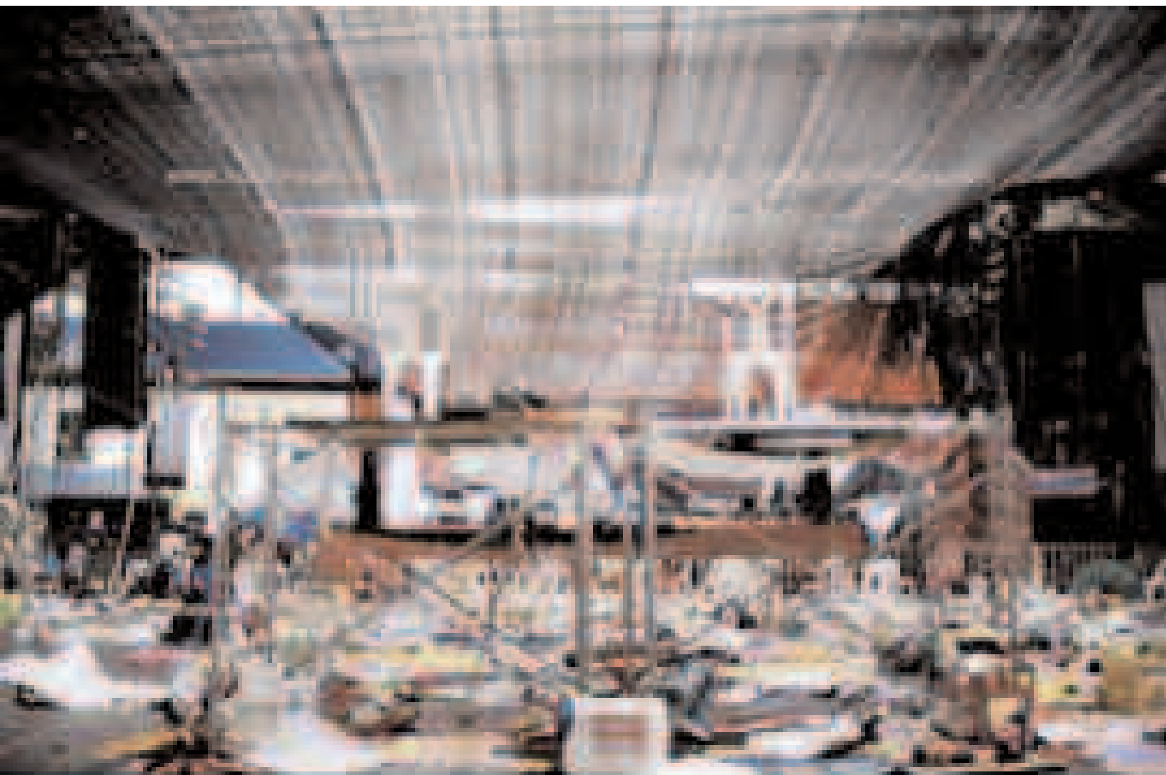
The deserted Red Shirt camp at Ratchaprasong intersection in Bangkok after the army dispersed the protesters on May 19, 2010.