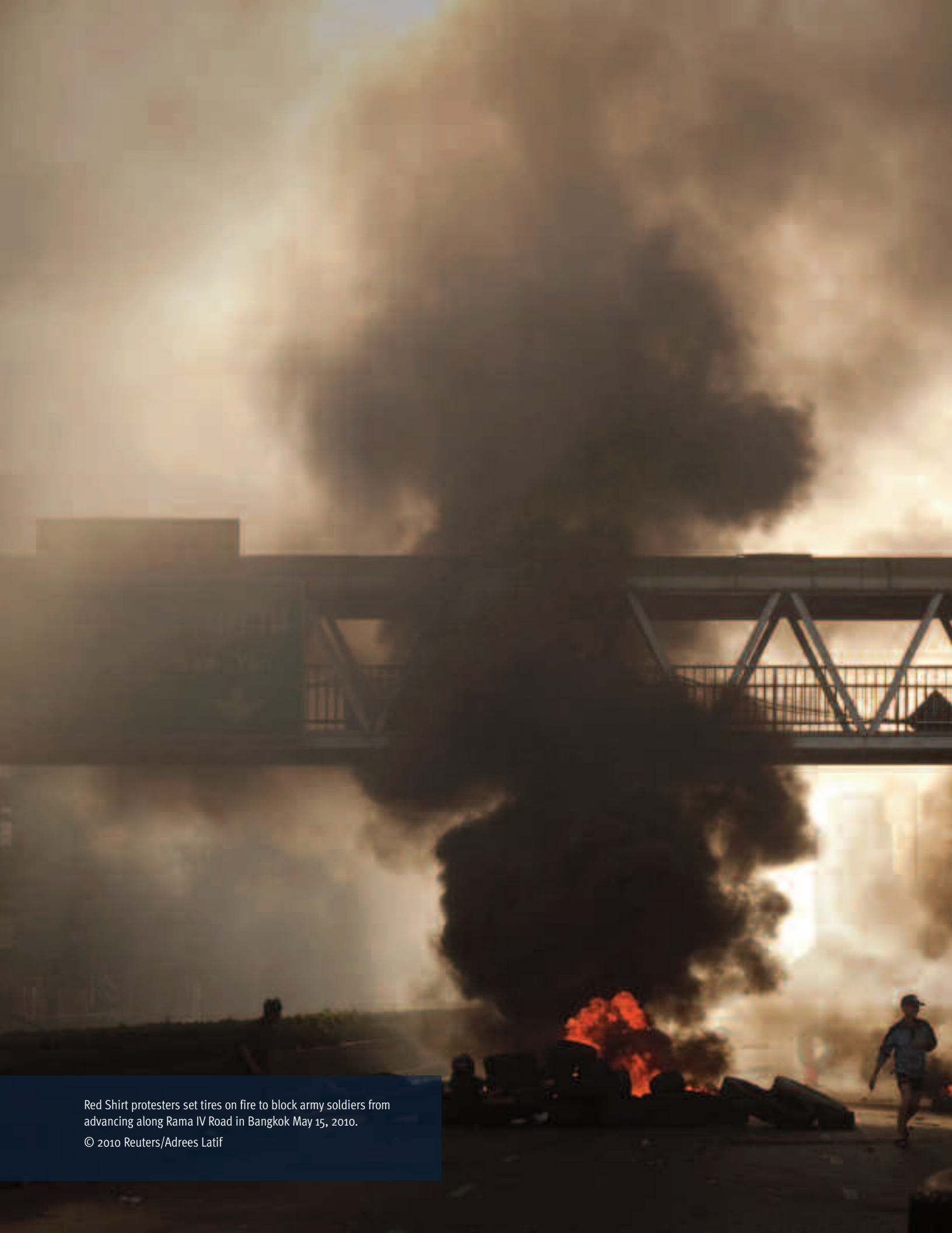
Red Shirt protesters set tires on fire to block army soldiers from advancing along Rama IV Road in Bangkok May 15, 2010.