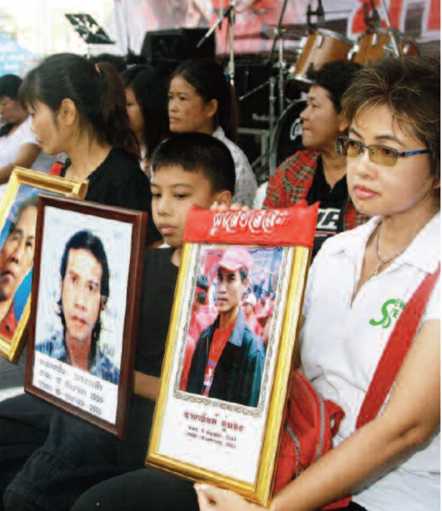
Relatives of UDD protesters who were killed during the clashes with soldiers on April 10, 2010, appear on stage calling for accountability, Bangkok, May 9, 2010.