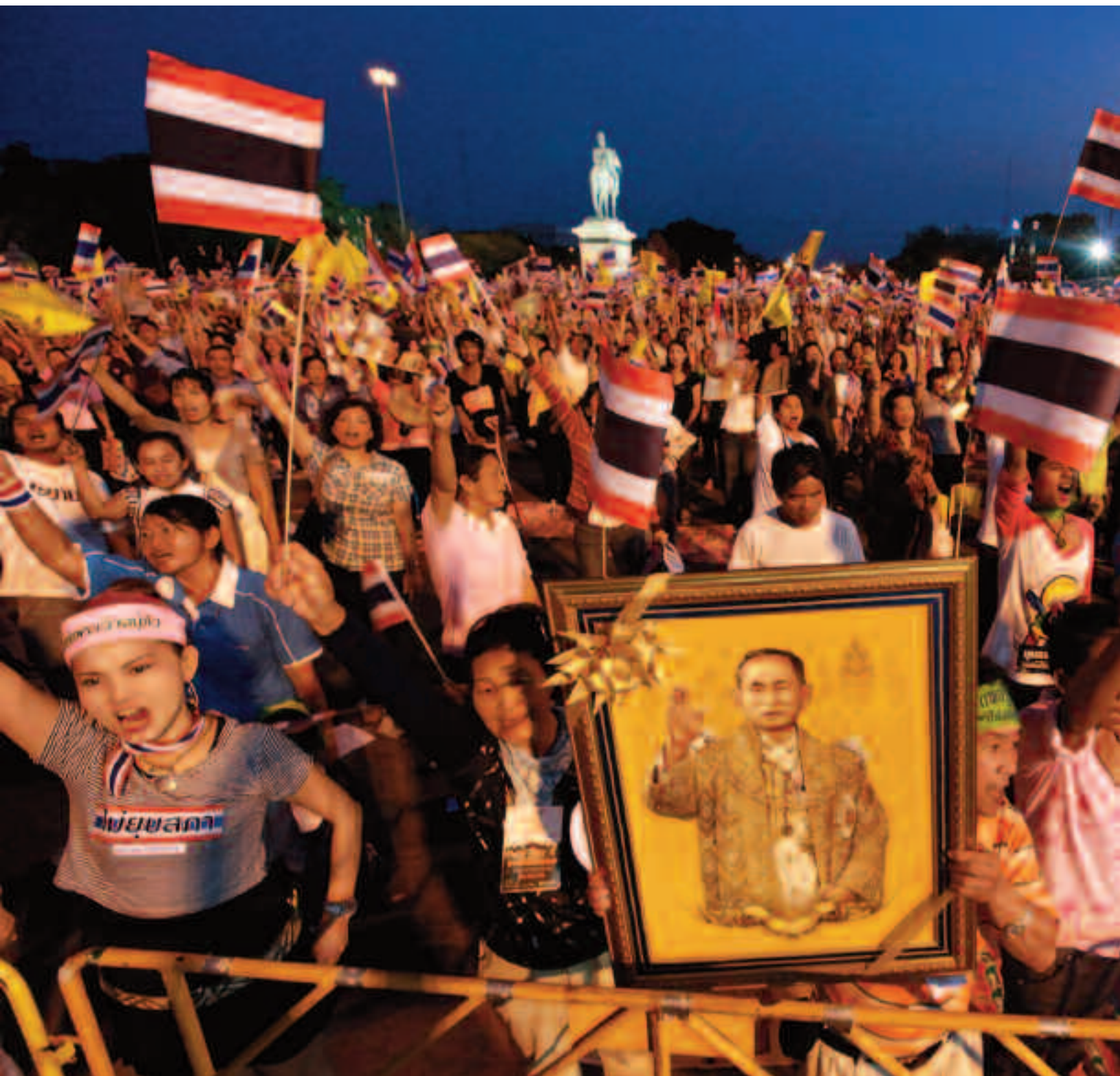
Pro-government Yellow Shirts supporters affiliated with the People's Alliance for Democracy (PAD), sing while holding a portrait of Thailand's revered King Bhumibol Adulyadej and waving Thai national flags and yellow flags during a rally at the Royal Plaza in Bangkok on April 23, 2010.