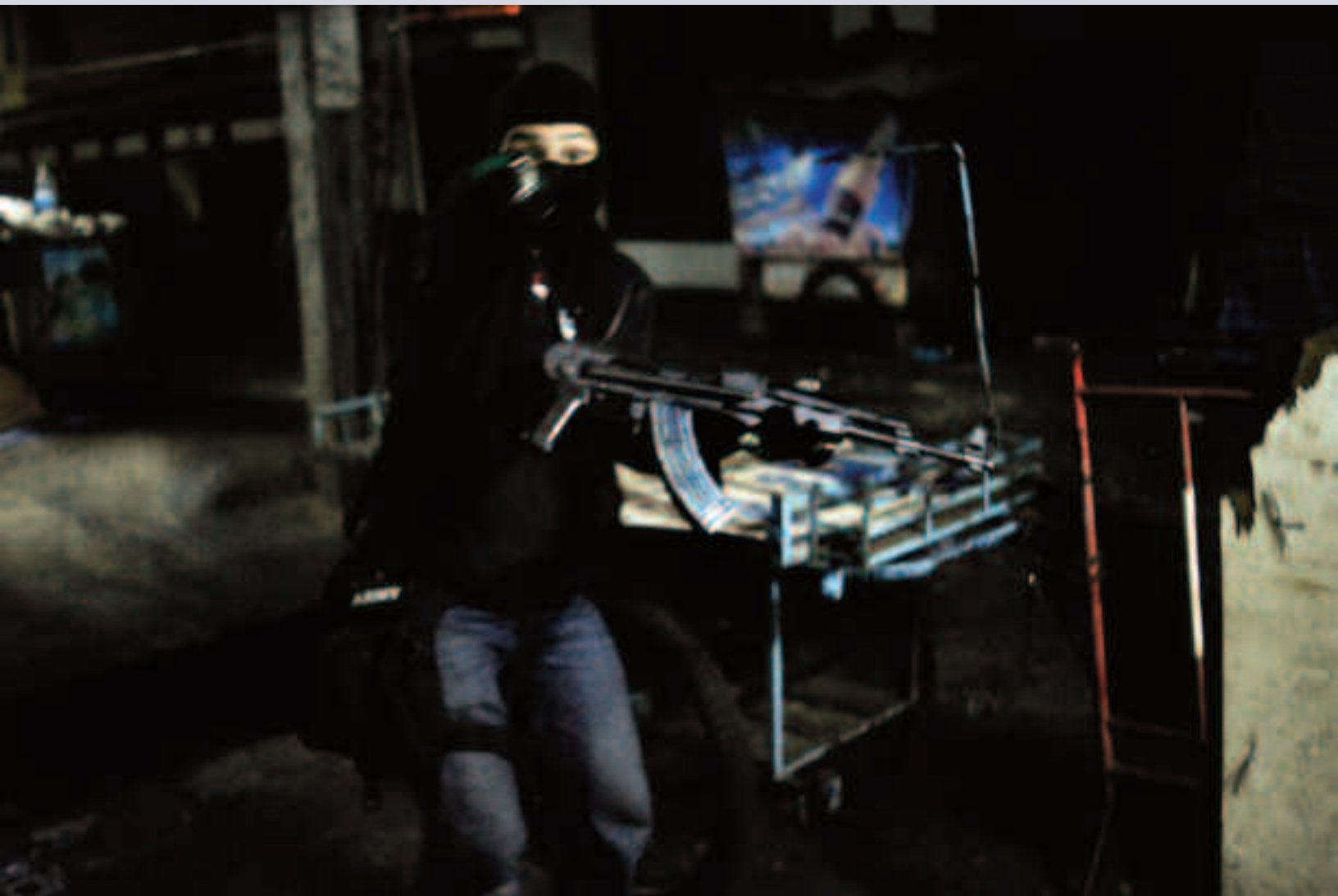
An apparent member of the Black Shirt militants is seen with an AK-47 in a back street of Soi Tanao, near Kao San Road and the Democracy Monument in Bangkok, April 10, 2010.