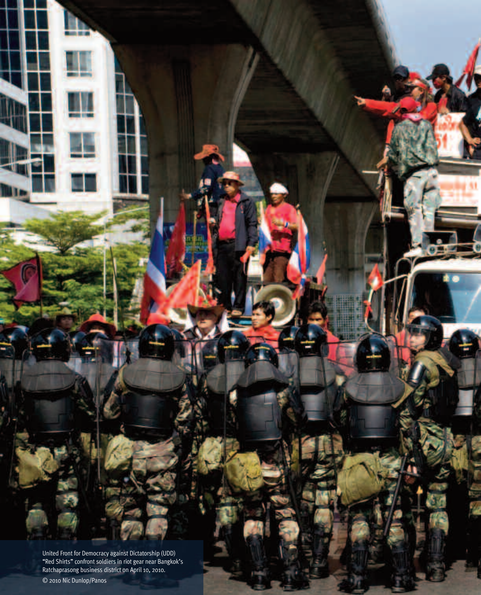
United Front for Democracy against Dictatorship (UDD) "Red Shirts" confront soldiers in riot gear near Bangkok's Ratchaprasong business district on April 10, 2010.