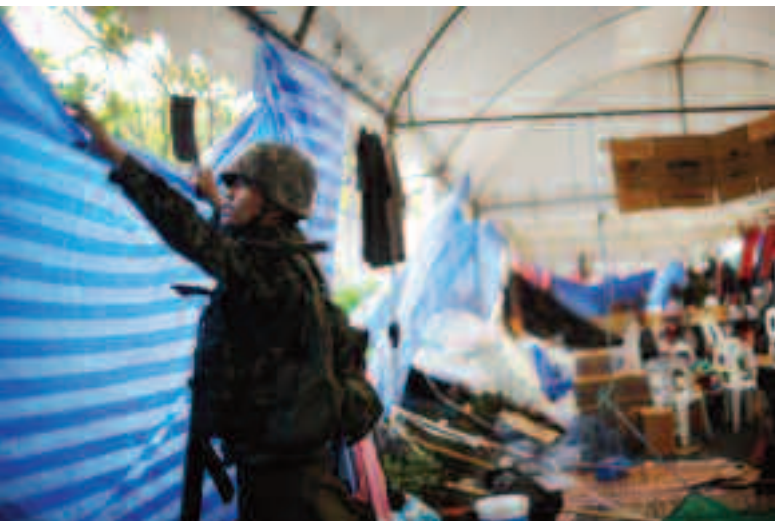
Soldiers break down the Red Shirts' protest camp along Rachadamri Road in Bangkok on May 19, 2010.

Several thousand UDD demonstrators sought sanctuary in the compound of a Buddhist temple, Wat Pathum Wanaram, which had been declared a safe zone several days earlier in an agreement between the government and UDD leaders. Fresh violence led to the deaths of six people in or near the compound. The army, which denied any responsibility for the killings inside the temple, suggested the six fatalities were due to an internal Red Shirt dispute. A Human Rights Watch investigation, based on eyewitness accounts and forensic evidence, found that soldiers fatally shot at least two people outside the temple entrance as they fled, while soldiers on