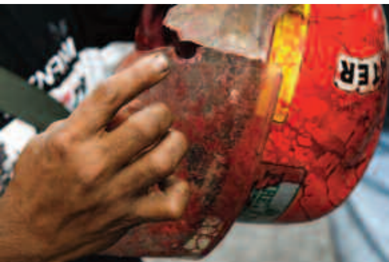
A Red Shirt protester indicates a hole in a helmet left by what he said was a sniper bullet that killed a rescue worker at a Red Shirt position on Rama IV Road in Bangkok on May 15, 2010.