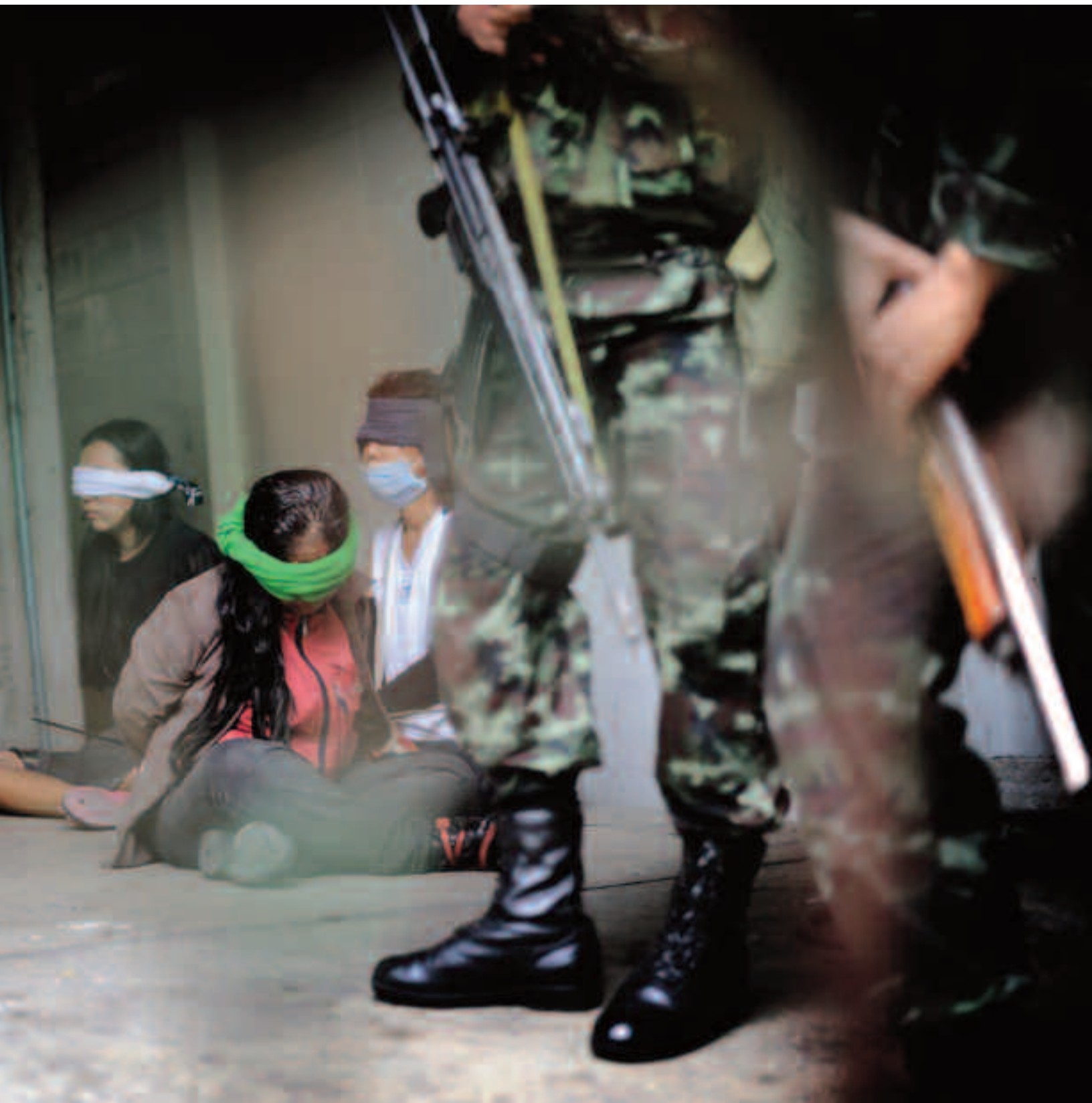
Surrendered Red Shirt protesters are blindfolded and have their hands tied behind their back by soldiers, May 19, 2010 in Bangkok.