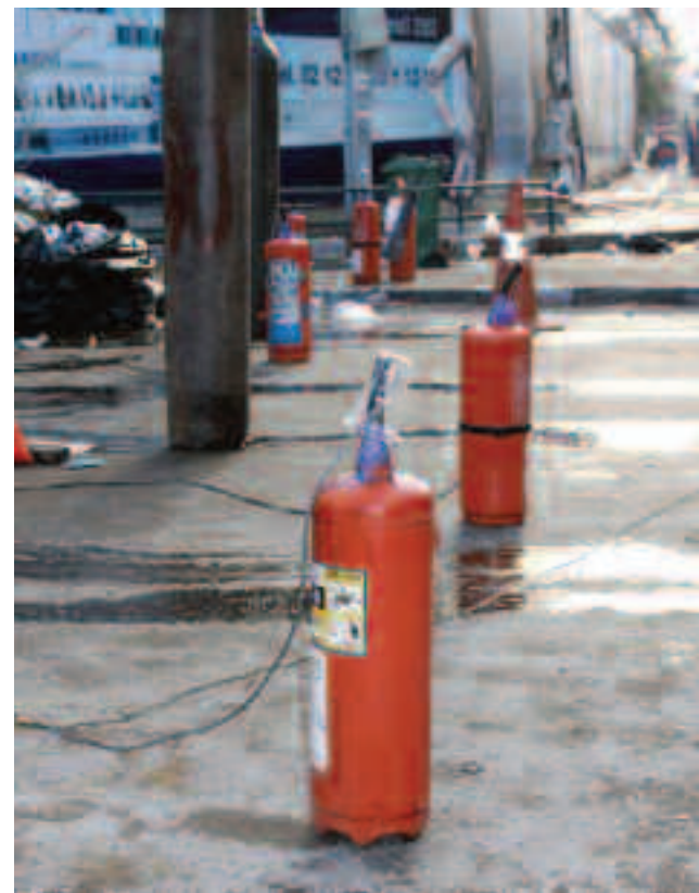
Improvised bombs found at the UDD's barricade on May 19, 2010, Bangkok.