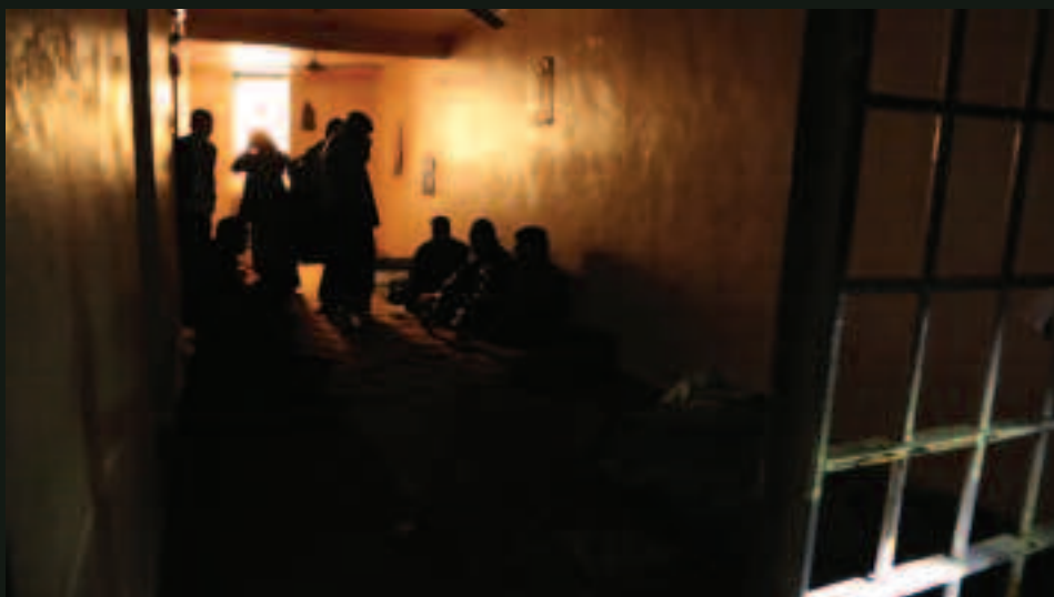
Screenshot from footage shows prisoners sitting in their cell in Malikiyah (Dêrik) prison in February 2013.

As the de facto authority in these regions, the PYD is obliged under international human rights law to grant the people in the areas it controls – Kurds, Arabs, Syrians, and others – their fundamental rights.