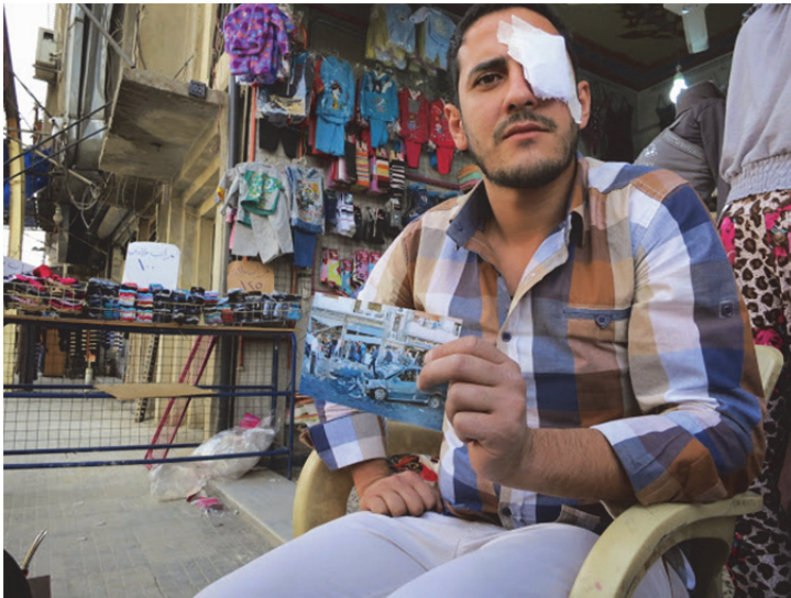
The shop owner injured in the bombing.

About 12:30 p.m. on October 24, 2013, a car bomb exploded on al-Ahram Street near the