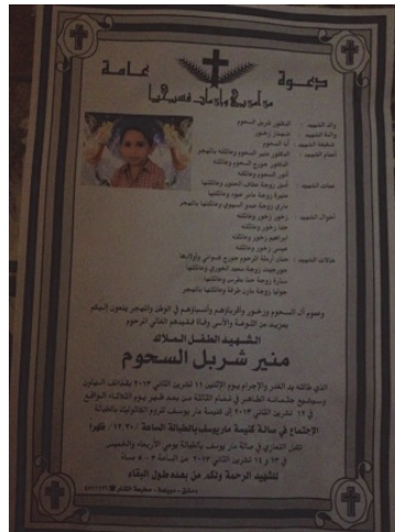
Munir al-Suhoom's death announcement.