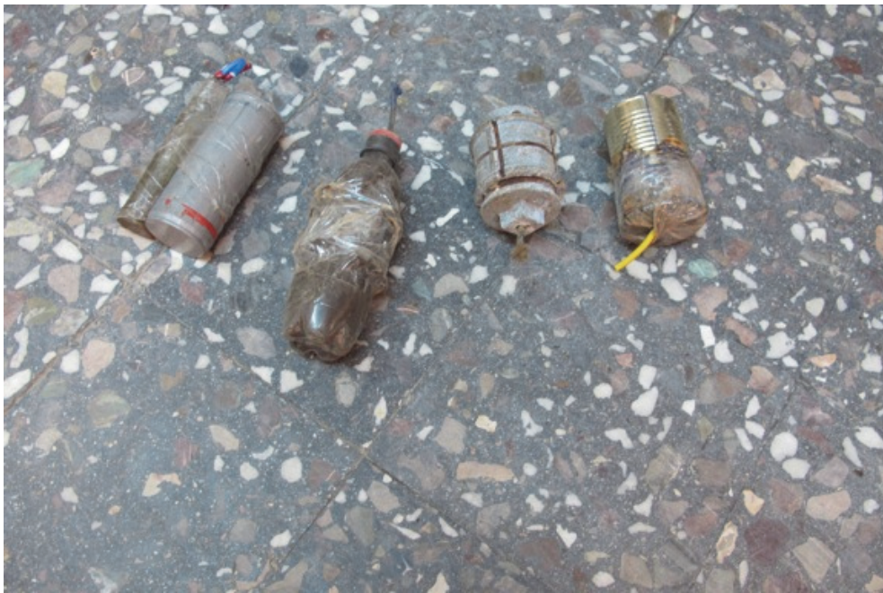
Improvised explosive devices seized by Military Intelligence in Homs.