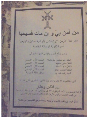
Death announcement. © 2013 Human Rights Watch