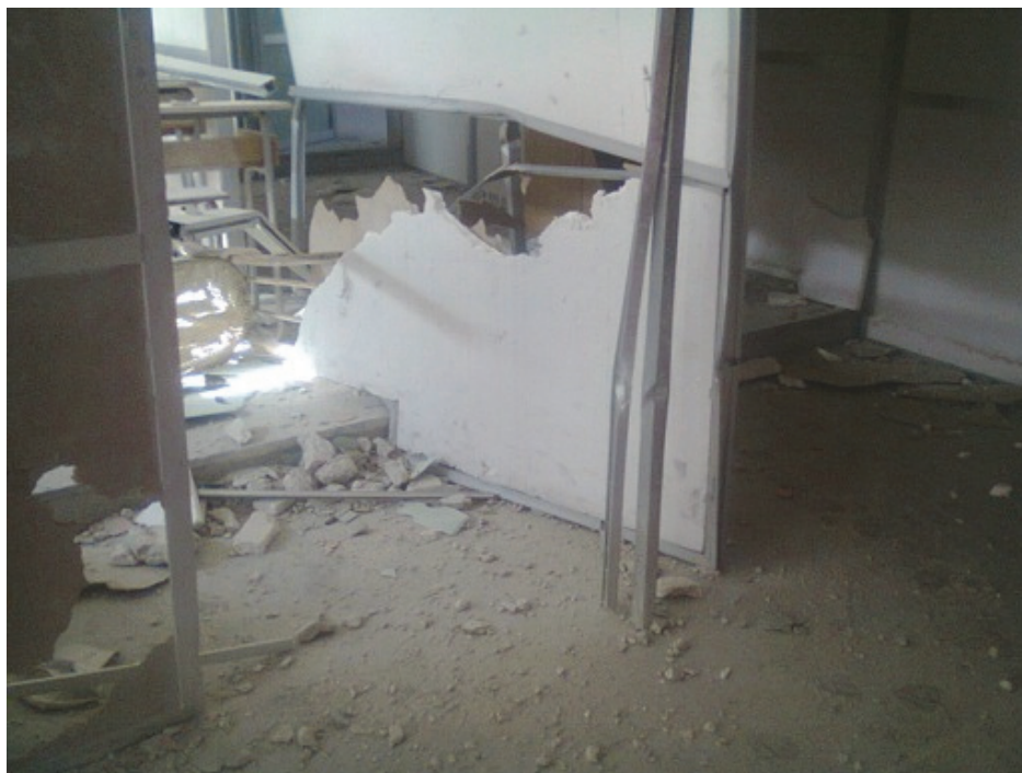
Damage caused by a mortar shell to the Akrama al Makhzoumi school.