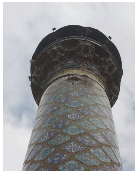
Sayida Zeinab minaret shelled from the west.

In two mortar attacks on the mosque on November 7, 2013, 45 people in the mosque courtyard were injured according to a doctor at the al-Mujtahid hospital who received the wounded. 172