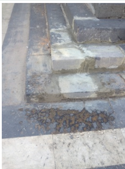
Hijaz train station, damage from November 6, 2013 explosion.