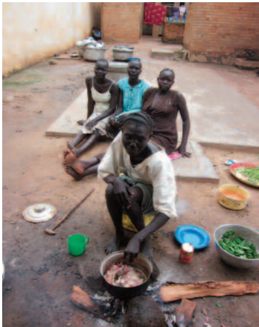
Rumbek Central Prison in Lakes State, South Sudan. Women make up a small number of the prison population and are expected to cook meals for more than 500 prisoners.