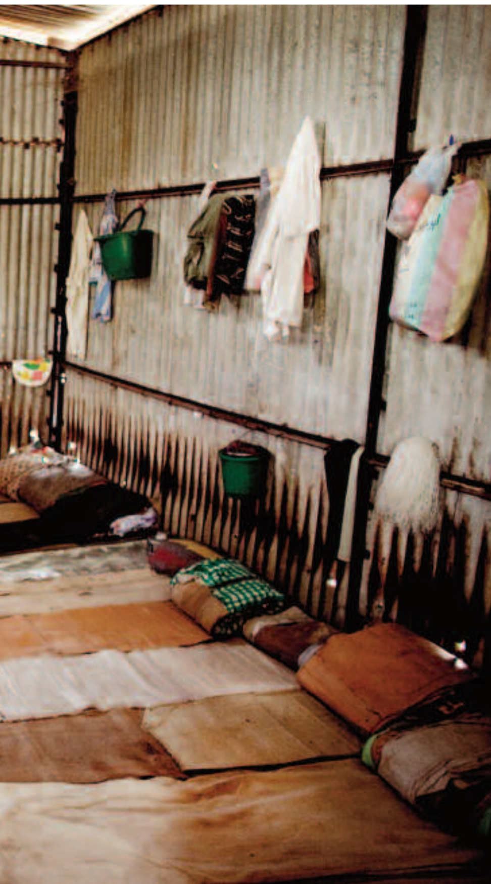
A cell in Bentiu Prison built entirely of corrugated iron sheeting. Few prisoners have mattresses; most sleep on a single sheet or an old food sack. Ventilation is poor, and prisoners complained that it is very hot at night.