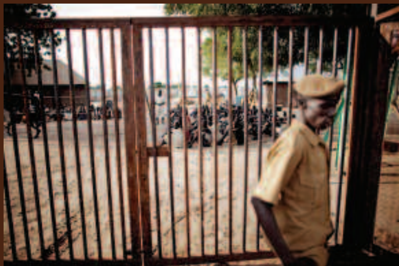
Inmates in Bentiu Prison, Unity State, lining up for the evening prisoner count before entering the cells for the night. There are approximately 250 prisoners in Bentiu Prison.

In the face of severe underdevelopment and myriad long-term challenges, South Sudan’s leaders have voiced their commitment to uphold human rights. The government should urgently work to reduce arbitrary detentions by enacting legal and policy reforms that limit remand detention and end imprisonment for adultery and for non-payment of debts. It should also find a way to guarantee the right to legal aid, to ensure rule of law actors are sufficiently trained, and to provide proper care for people with mental disabilities outside of prison.