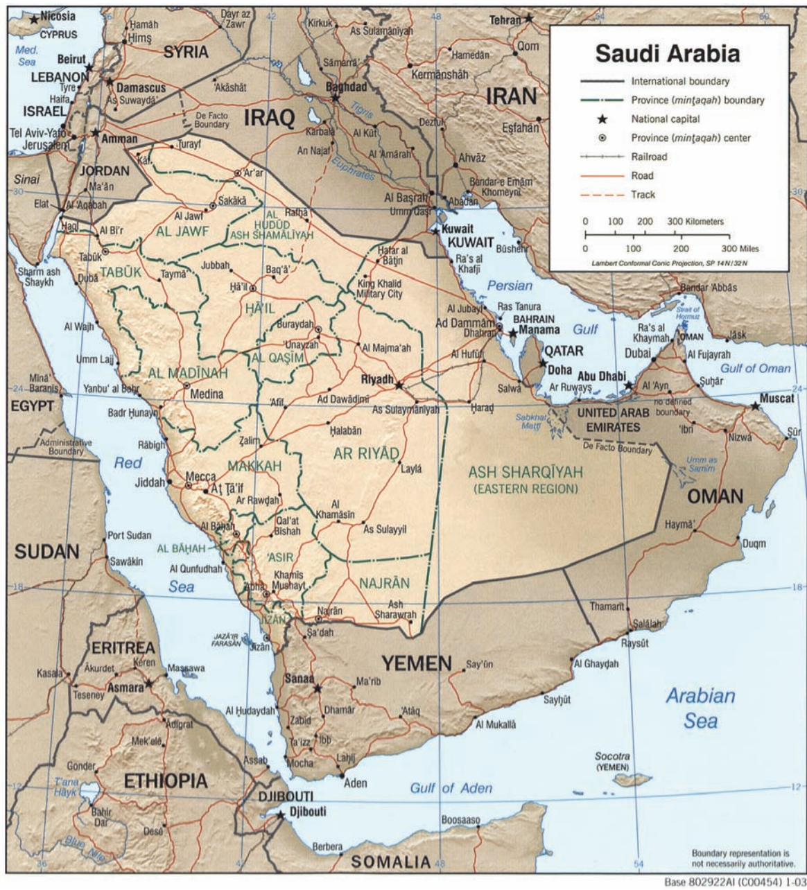
Map of Saudi Arabia.