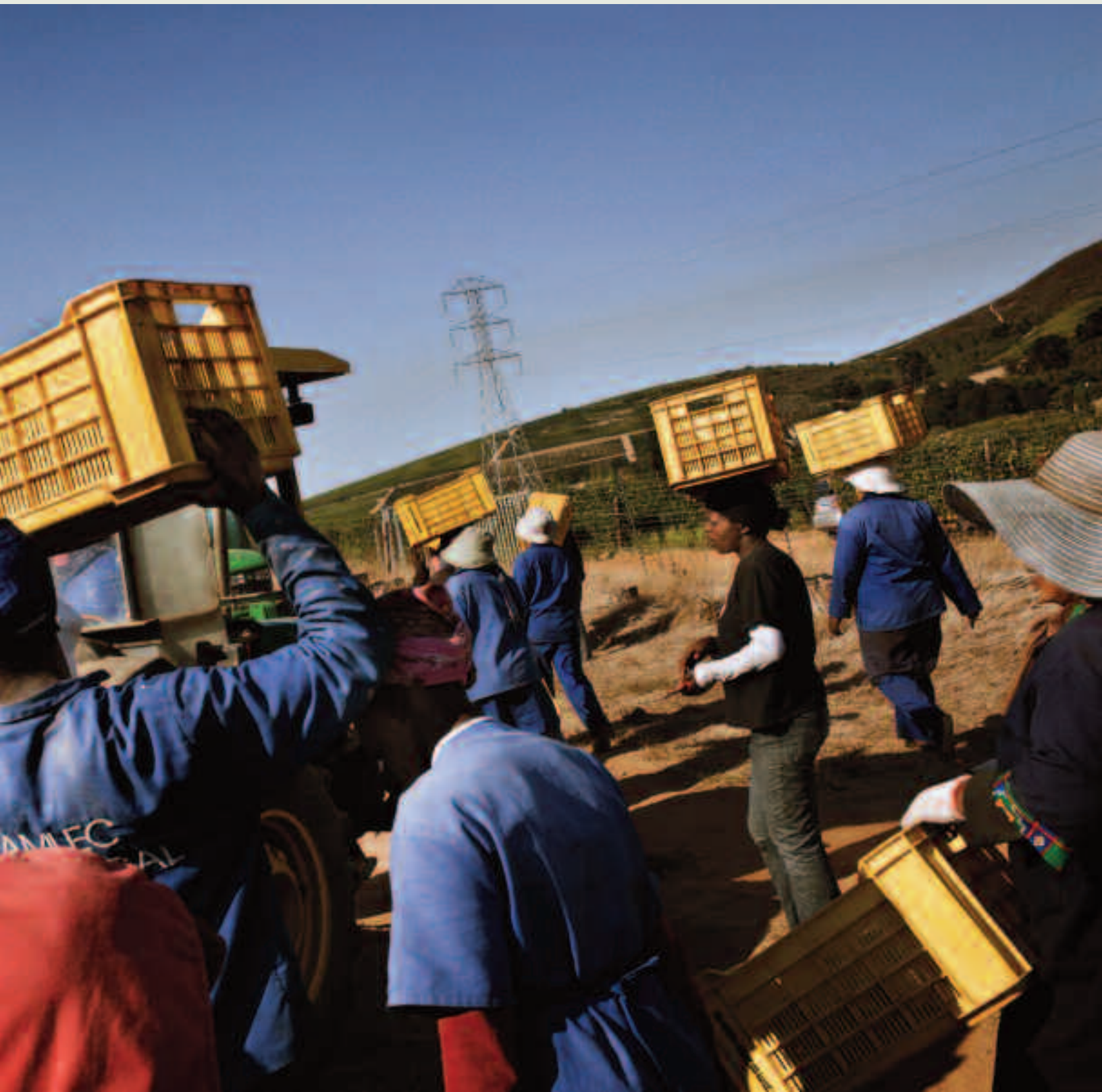
Farmworkers in Stellenbosch collect grapes during harvest time.