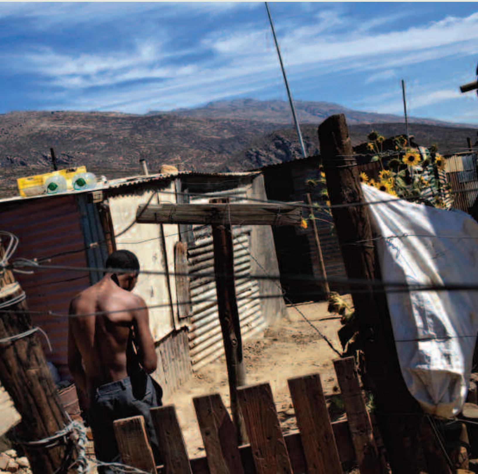
A resident of Stofland township returns home.