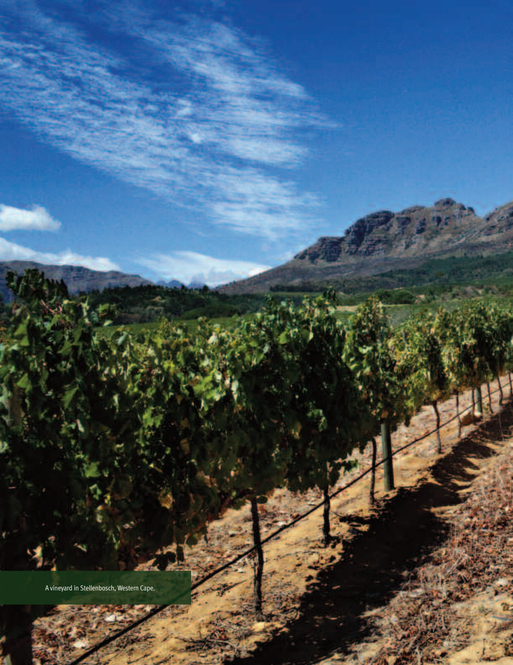
A vineyard in Stellenbosch, Western Cape.