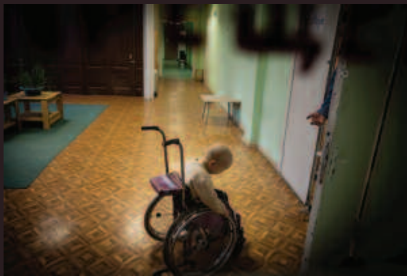
A child in a Russian state orphanage for children with disabilities.

Human Rights Watch calls on the Russian government to immediately end violence and neglect towards children living in institutions. Russia should also reduce the number of children in institutions by transitioning them out of orphanages into birth or foster families. In the long term, Russia should make a plan to end institutionalization of children with disabilities so that children can be placed in state care only in limited circumstances that serve their best interest and in compliance with international human rights law.