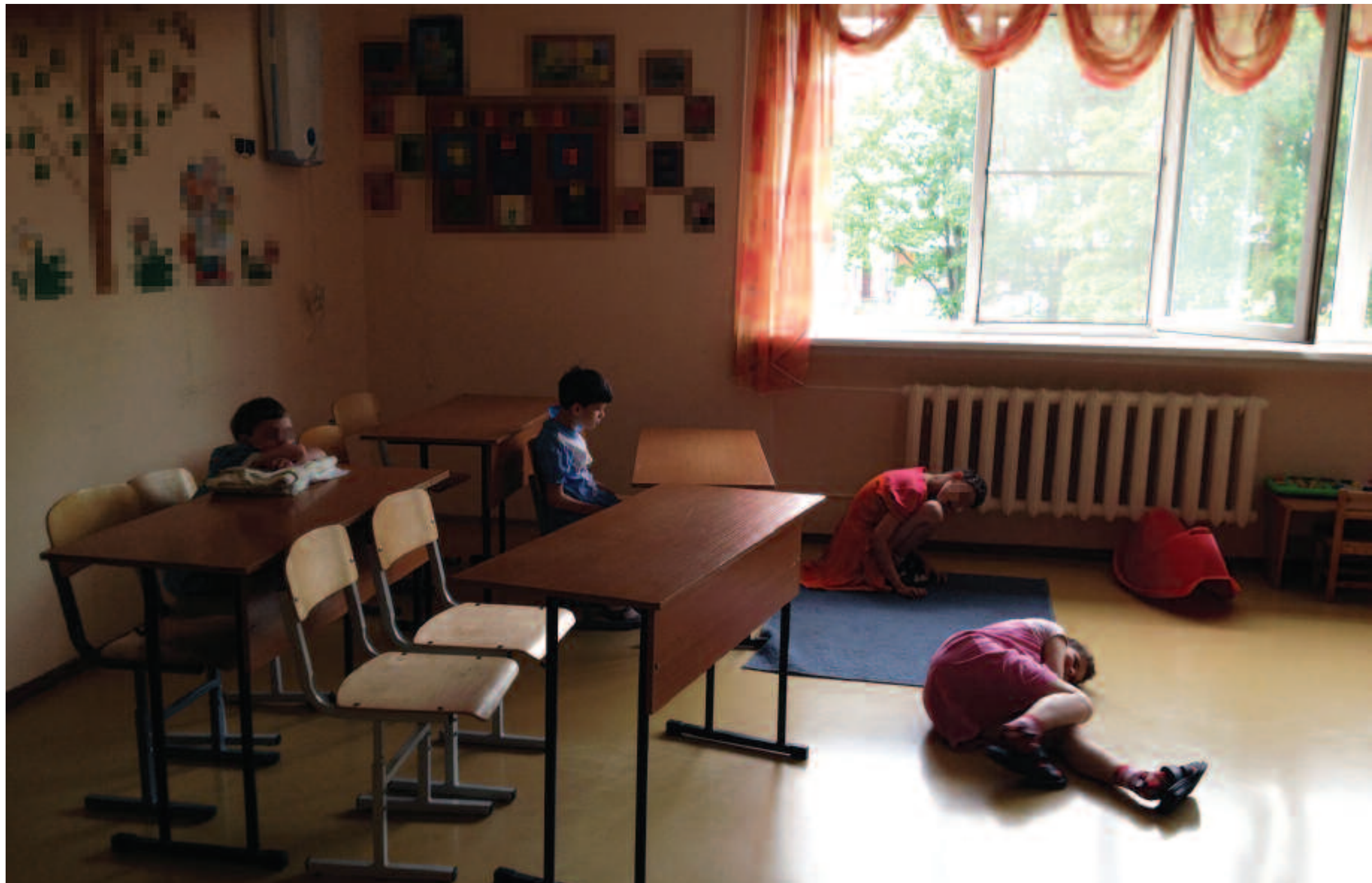
A group of girls, ages 10 to 15, in an orphanage for children with disabilities in northwest Russia. Many children in “specialized” orphanages spend their days seated in rooms with minimal attention from staff, who often lack training and other resources to engage children in activities appropriate to their ages and disabilities.

Until the government acts, it will needlessly continue to consign these children to lifetimes within four walls, isolated from their families and communities, and robbed of the opportunities available to other children.