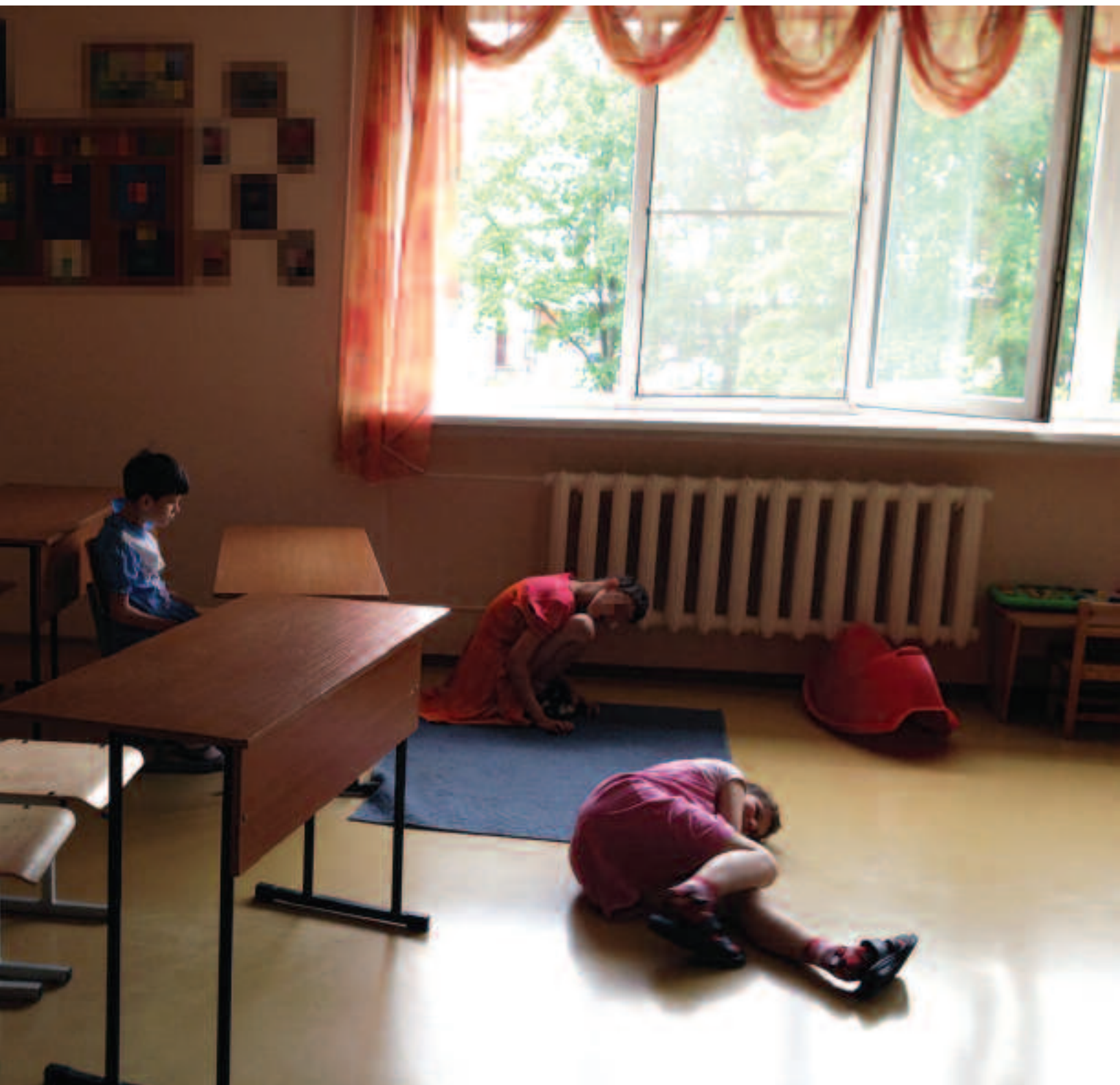
A group of girls, ages 10 to 15, in an orphanage for children with disabilities in northwest Russia. Many children in “specialized” orphanages spend their days seated in rooms with minimal attention from staff, who often lack training and other resources to engage children in activities appropriate to their ages and disabilities.