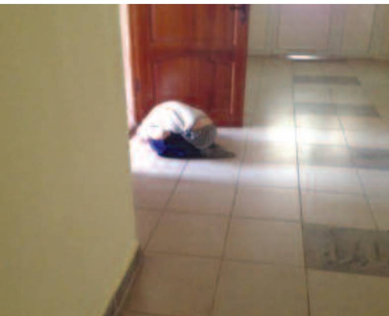
A boy crouches on the floor of a state orphanage for children with disabilities, Sverdlovsk region.