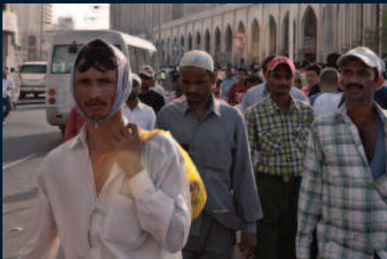
Migrant workers gather on “Bank Street,” in downtown Doha, where many workers wire remittance money to their families in their home countries. “Bank Street,” as it is known by the workers, is less than a five-minute walk from Doha’s sweeping waterfront Corniche.

The report includes recommendations to the government on legal reforms and implementation mechanisms, and to the relevant private sector actors on public commitments that could alleviate such abuses moving forward.