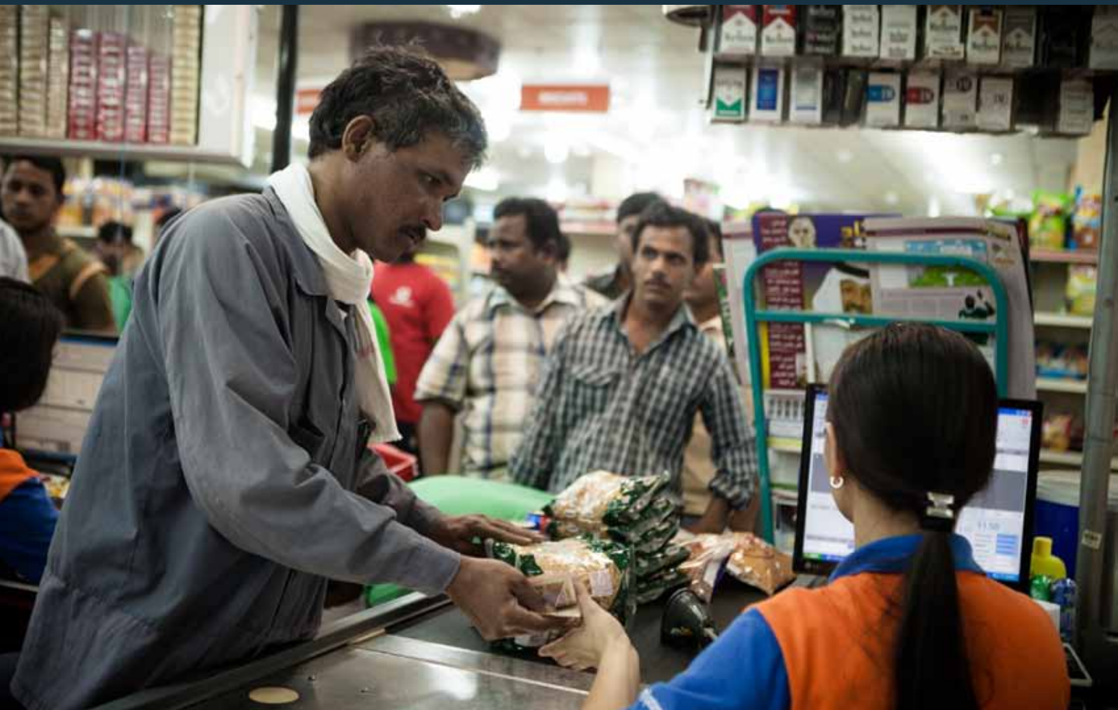
Migrant workers housed in Doha's Industrial Area shop at food markets in the neighborhood.