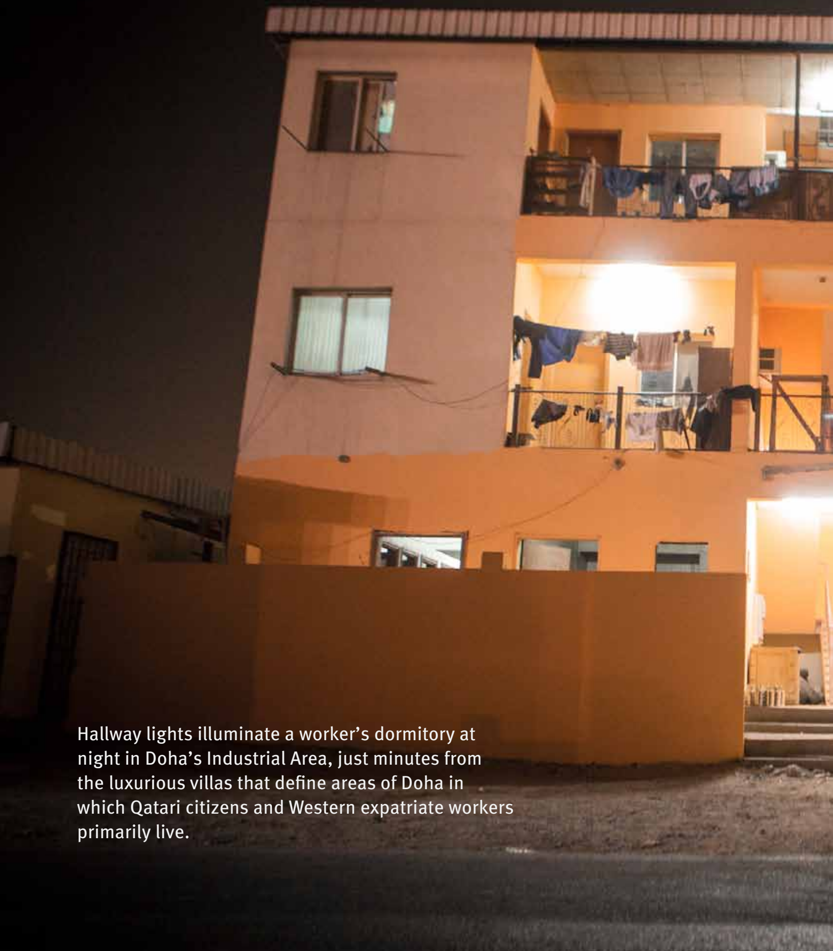
Hallway lights illuminate a worker's dormitory at night in Doha's Industrial Area, just minutes from the luxurious villas that define areas of Doha in which Qatari citizens and Western expatriate workers primarily live.