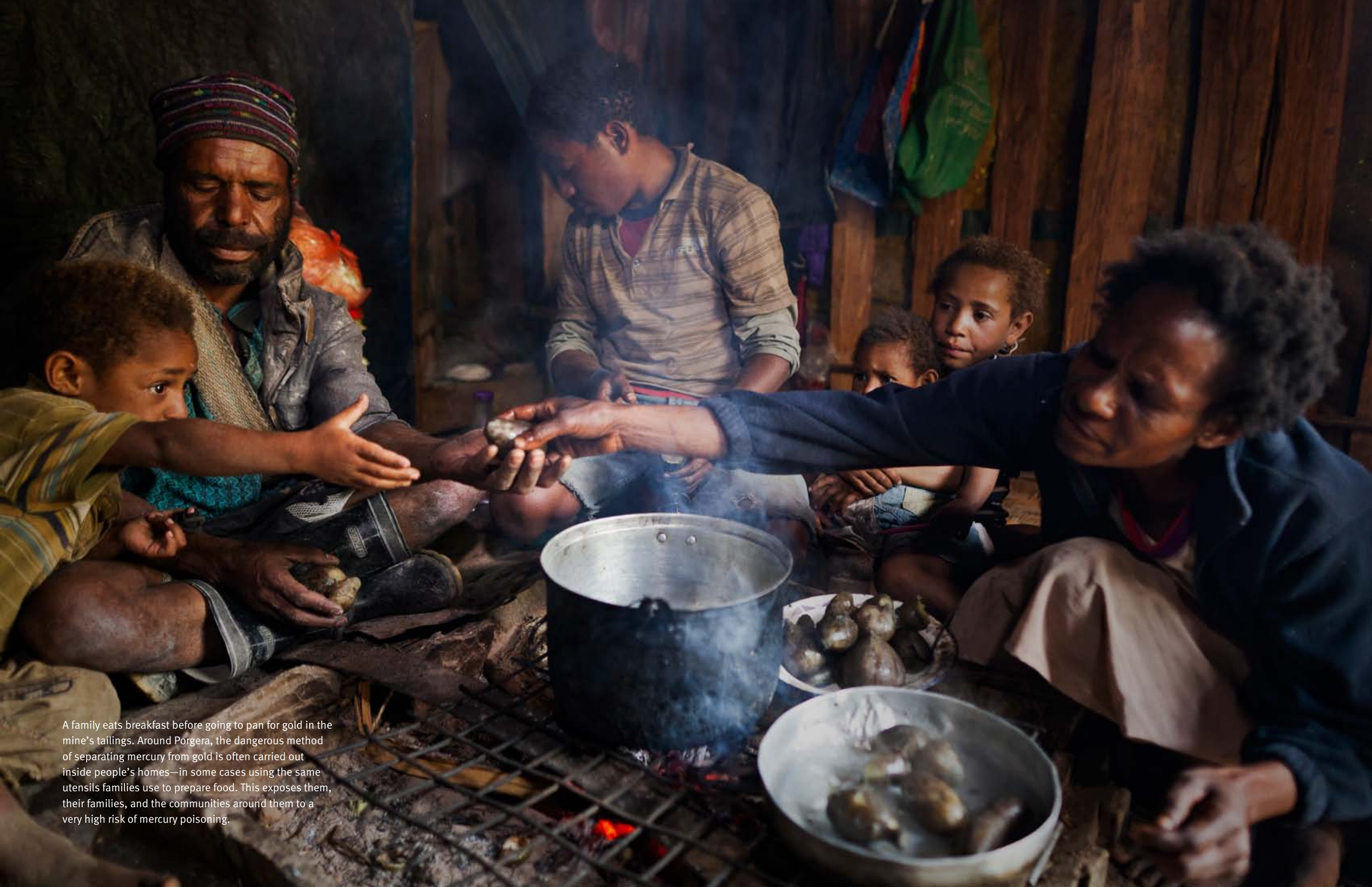
A family eats breakfast before going to pan for gold in the mine's tailings. Around Porgera, the dangerous method of separating mercury from gold is often carried out inside people's homes—in some cases using the same utensils families use to prepare food. This exposes them, their families, and the communities around them to a very high risk of mercury poisoning.