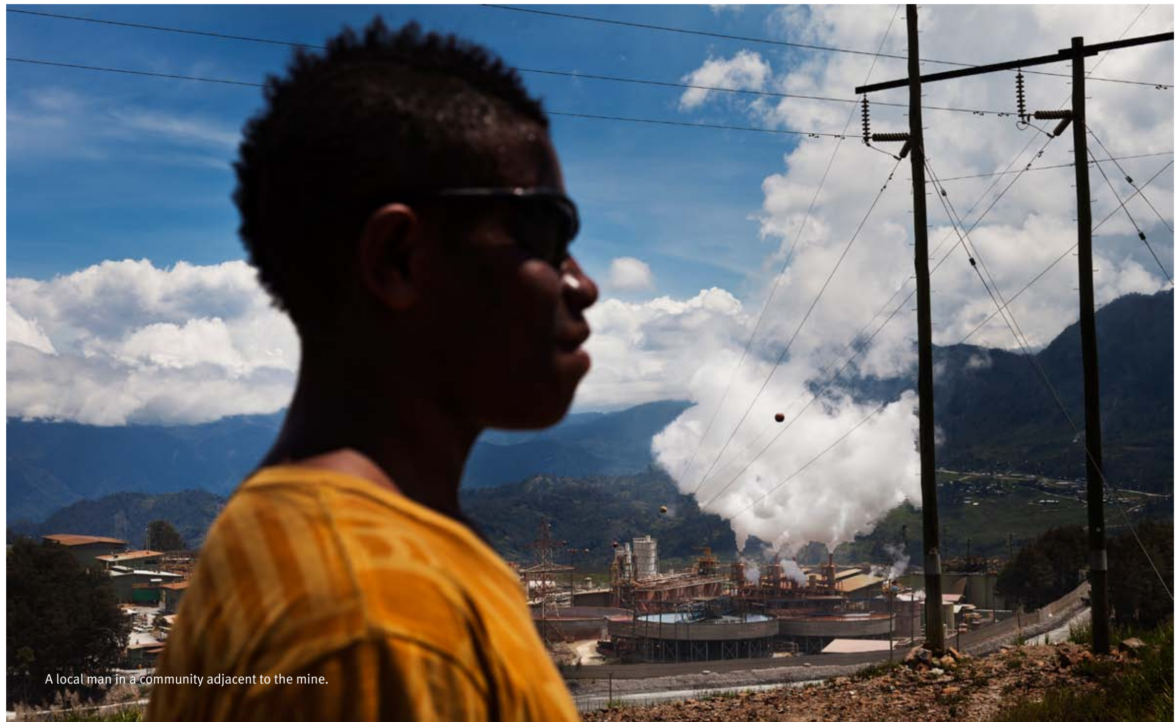
A local man in a community adjacent to the mine.

provided material support to a police investigation into the allegations of sexual violence by members of the PJV security force.