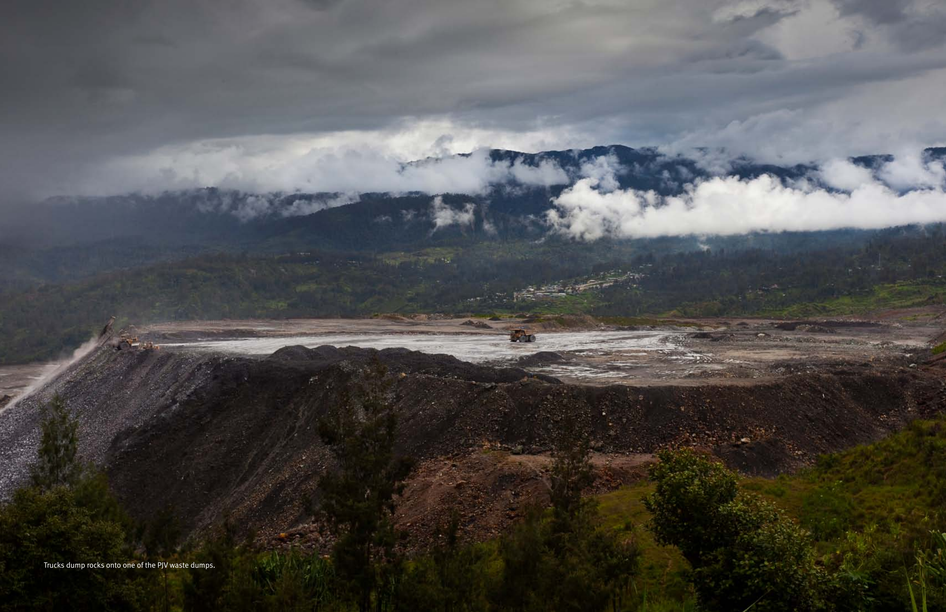
Trucks dump rocks onto one of the PJV waste dumps.