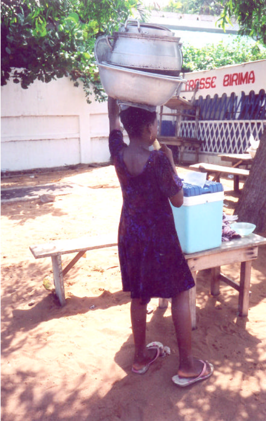
Too many children working in West Africa's markets have been trafficked from other countries.