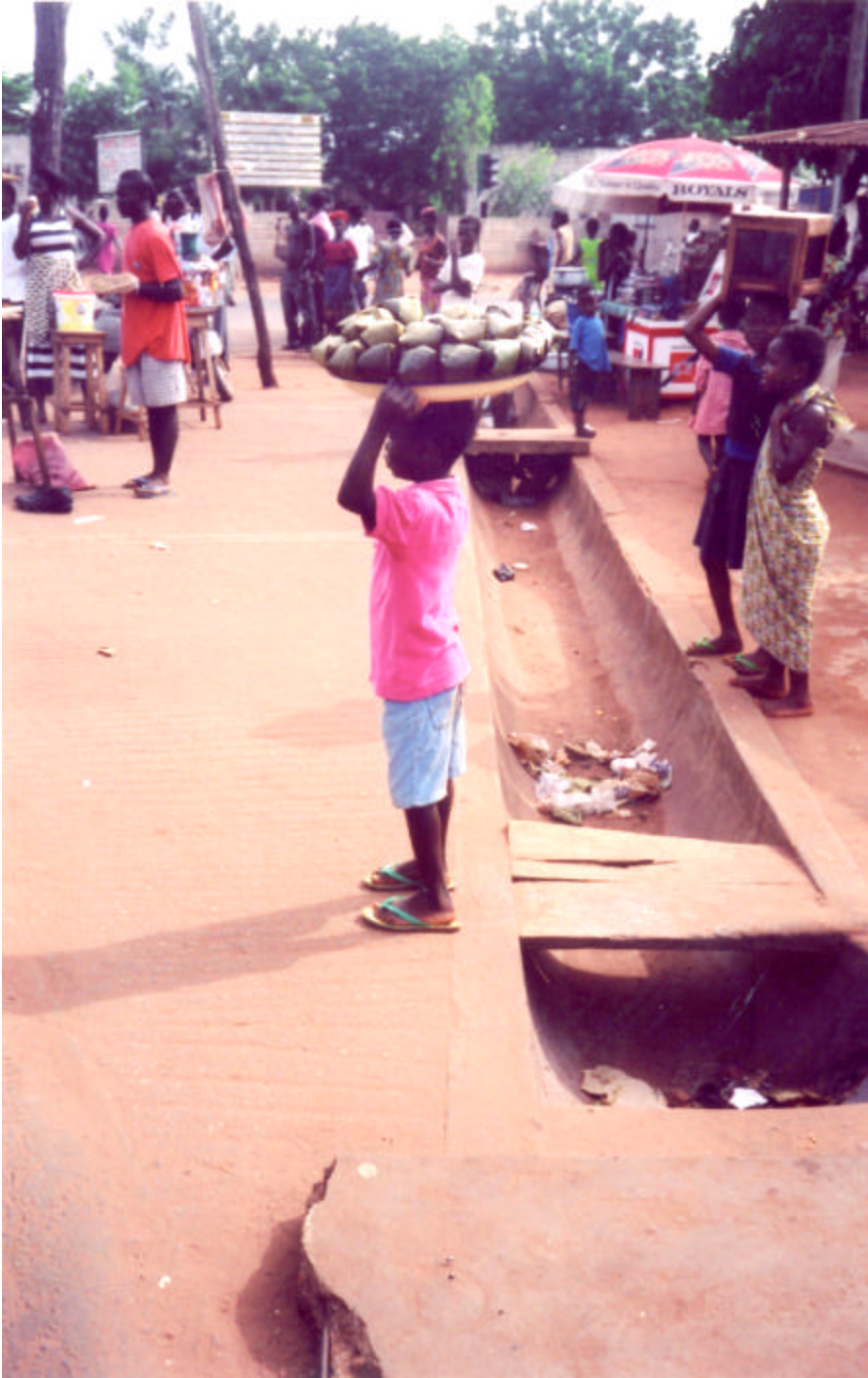
A young boy working in a market in Togo. Many trafficked children are forced to work in restaurants, markets, and homes.