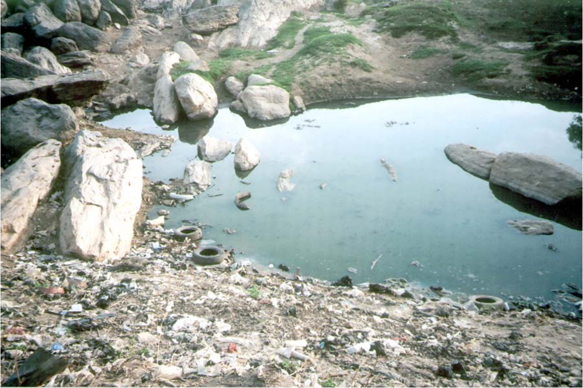
Rubbish dump in Kabala Costain, Kaduna, where eight men were shot dead by soldiers and police on November 22, 2002.