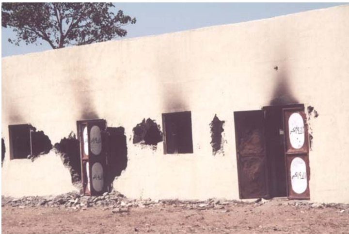
Mosque in Kabala West, Kaduna, destroyed in November 2002.

Testimony to Human Rights Watch by a community leader in Nasarawa, Kaduna, December 2002.