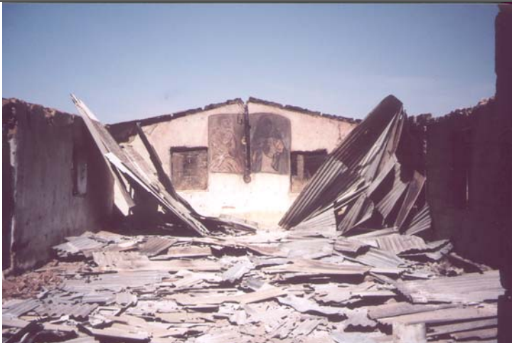
Christ Apostolic Church in Nariya, destroyed in November 2002.

"I saw a soldier shoot a man dead in front of me, on Saturday morning. The soldier had two stripes on his uniform. He was from the army. Soldiers were chasing people. A man was trying to enter his house. They shot him outside the house. [...] I could see he was not holding any weapon. The soldier aimed at him directly. He shot him in the chest from the front. It was on Nasarawa road, after the market. He died on the spot. Then the soldier just walked away."