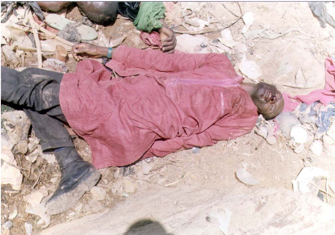
The body of Dr. Hamisu Umar after he was killed on November 22, 2002.