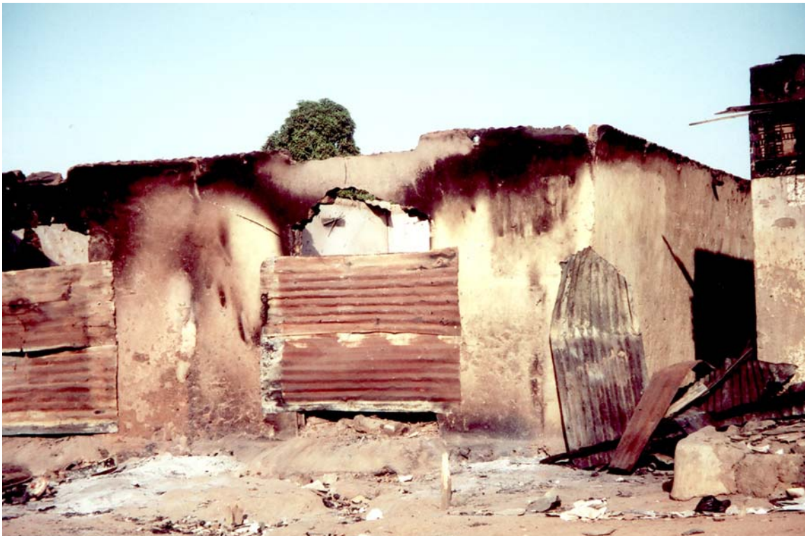
Houses burned in a Muslim area of Nasarawa, Kaduna.