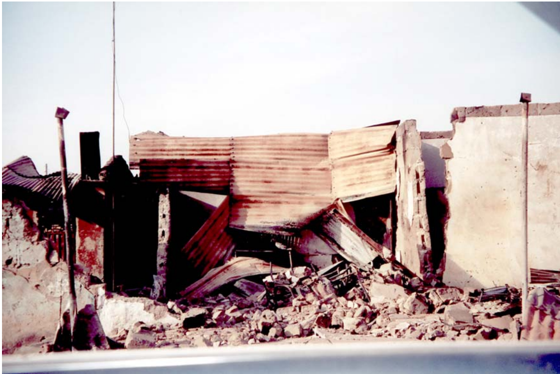
Houses burned in a Muslim area of Nasarawa, Kaduna.