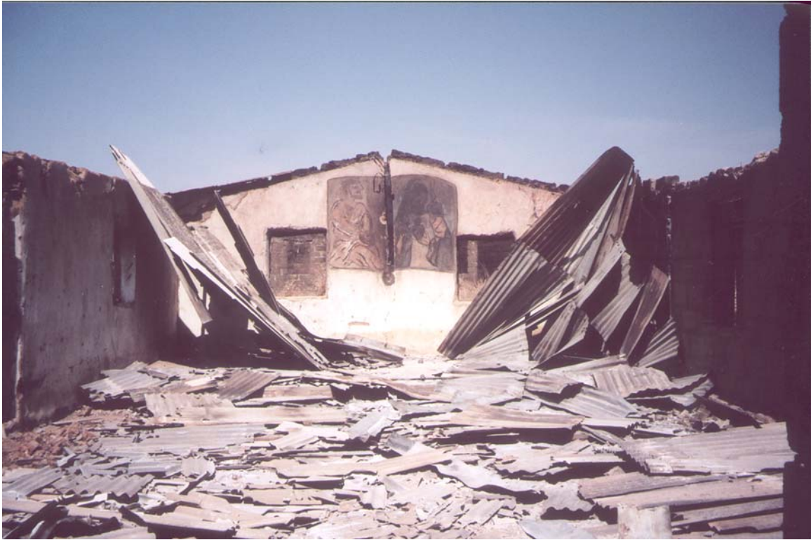
Christ Apostolic Church in Nariya, destroyed in November 2002.