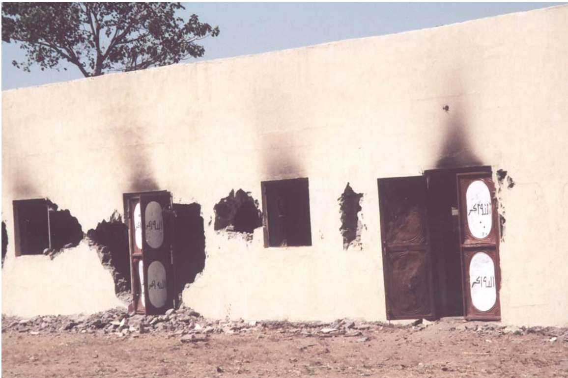
Mosque in Kabala West, Kaduna, destroyed in November 2002.