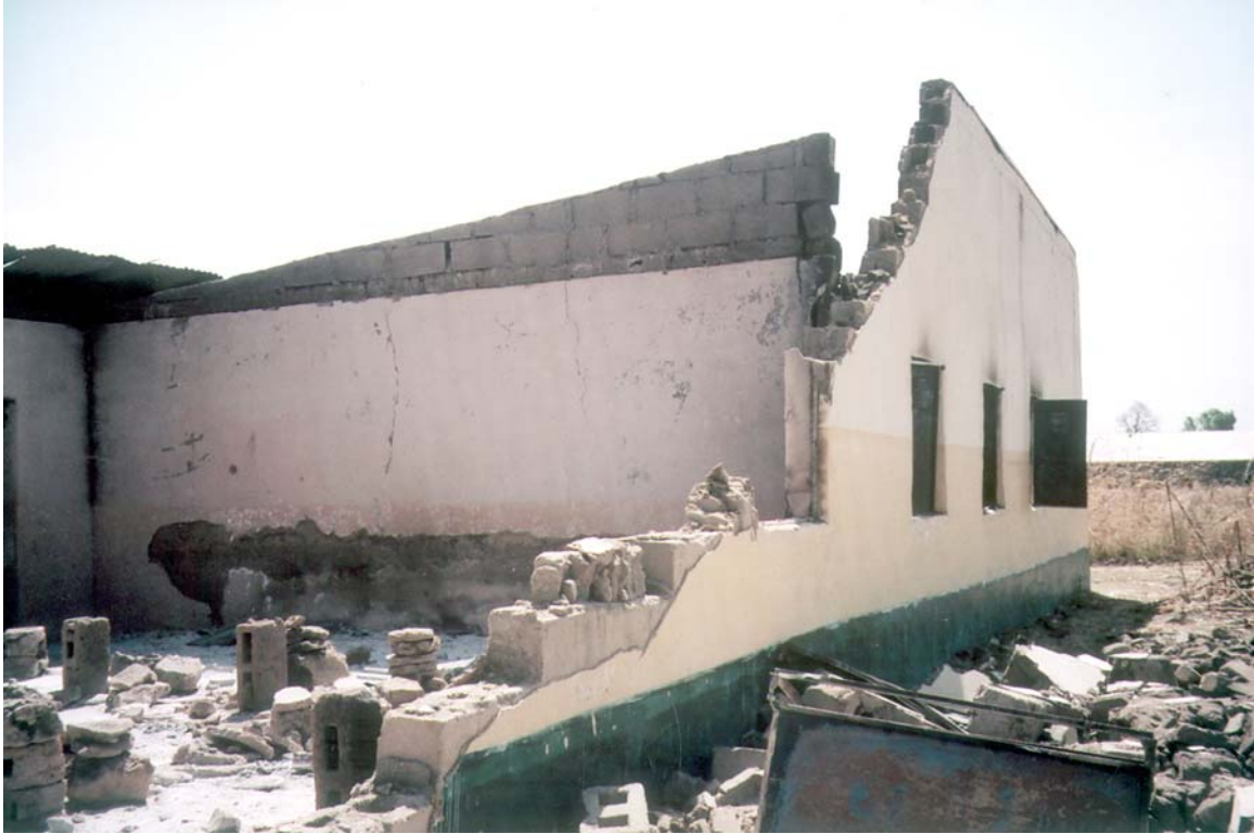
Primary school in Nariya, destroyed in November 2002.