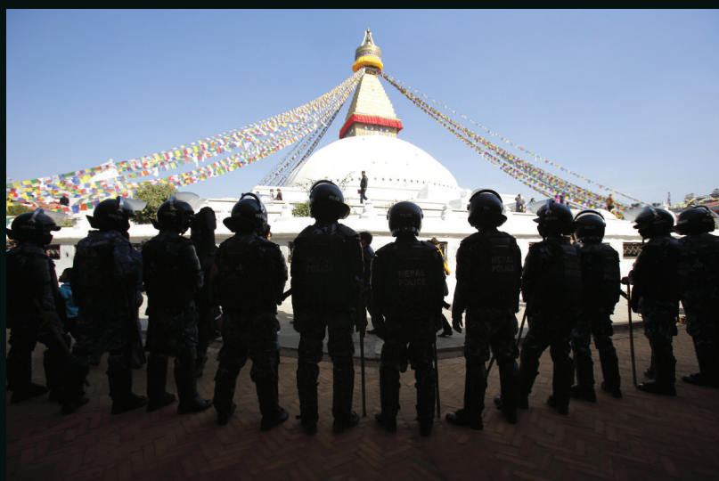
Nepalese police stand guard at the premises of the Boudhanath Stupa after a Tibetan monk self-immolated in Kathmandu on February 13, 2013.

The report urges Nepal to take specific measures to better guarantee the basic rights of Tibetans in the country. It calls on China to lift restrictions on and end abuses against Tibetans, and to stop pressuring Nepal to take measures inconsistent with Nepal’s international human rights and refugee law obligations.